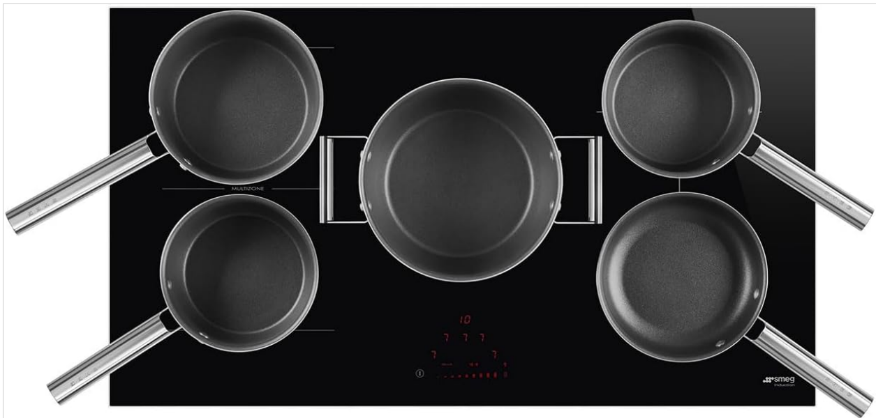
Image Description: A top-down view of the Smeg SI1M4954D induction hob with five black pots placed on its cooking zones. The left side shows two pots on the Multizone area, while the right side has three individual pots on their respective zones, demonstrating the hob's capacity.