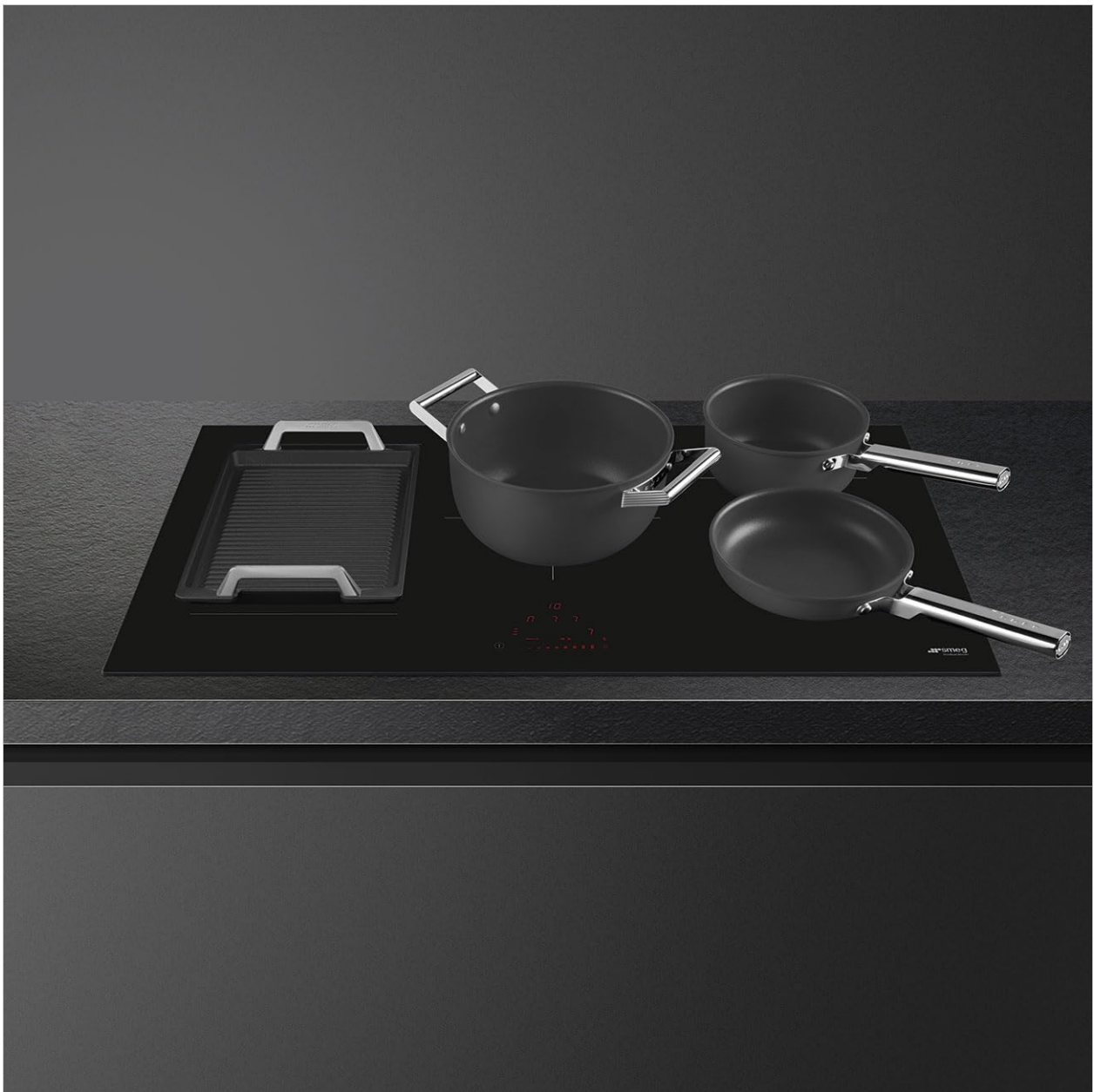
Image Description: A Smeg SI1M4954D induction hob with various cookware. A rectangular grill pan is positioned on the left Multizone area, while a large pot and a frying pan are on the right individual cooking zones, illustrating the hob's versatility for different cooking methods.