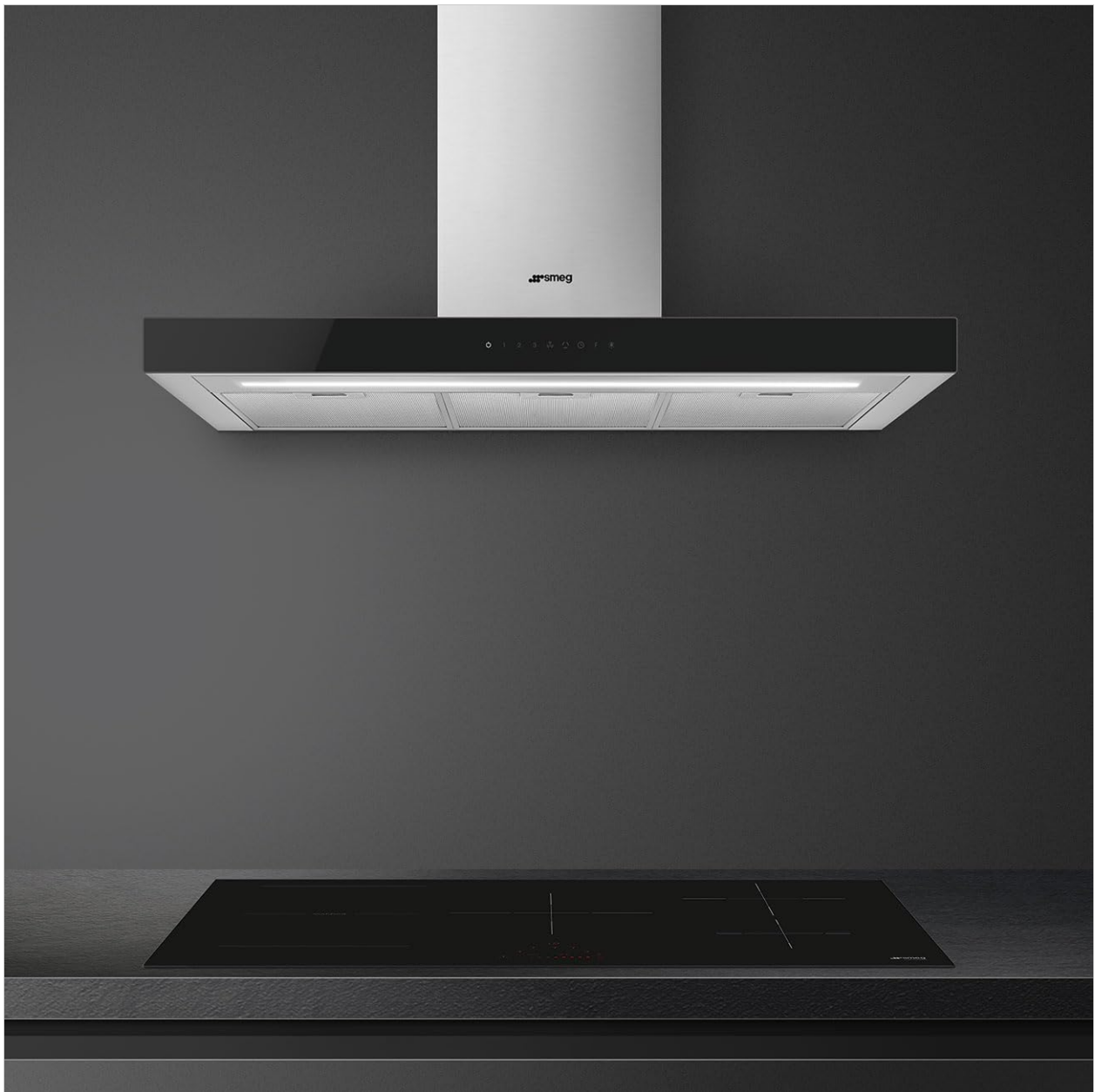
Image Description: A Smeg SI1M4954D induction hob installed beneath a sleek, stainless steel Smeg range hood. This setup demonstrates the integrated design and potential for the AutoVent 2.0 feature to connect the hob and hood for automatic ventilation control.