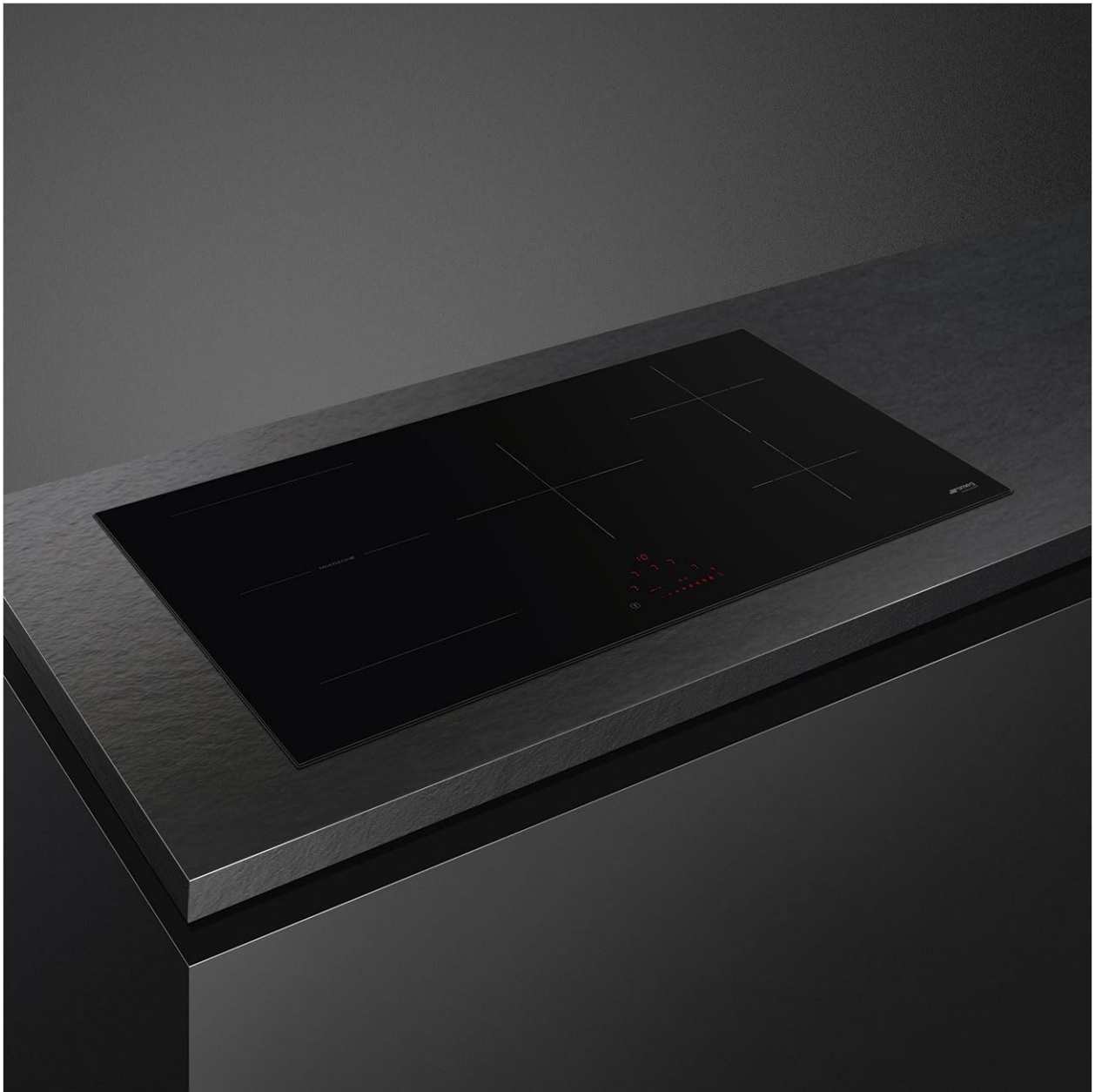
Image Description: A Smeg SI1M4954D induction hob seamlessly integrated into a modern dark kitchen countertop. The hob's black glass surface blends with the counter, highlighting its sleek design.