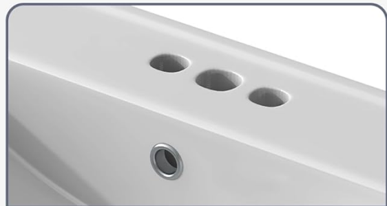
Plumping Access Holes