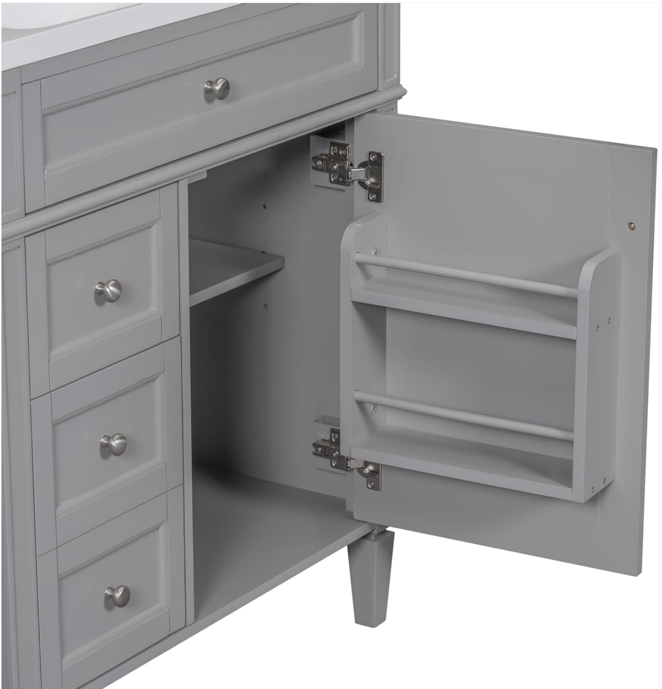
Image: A close-up view of the open cabinet door, showing the integrated organizer shelves designed to hold smaller bathroom items, maximizing storage efficiency.