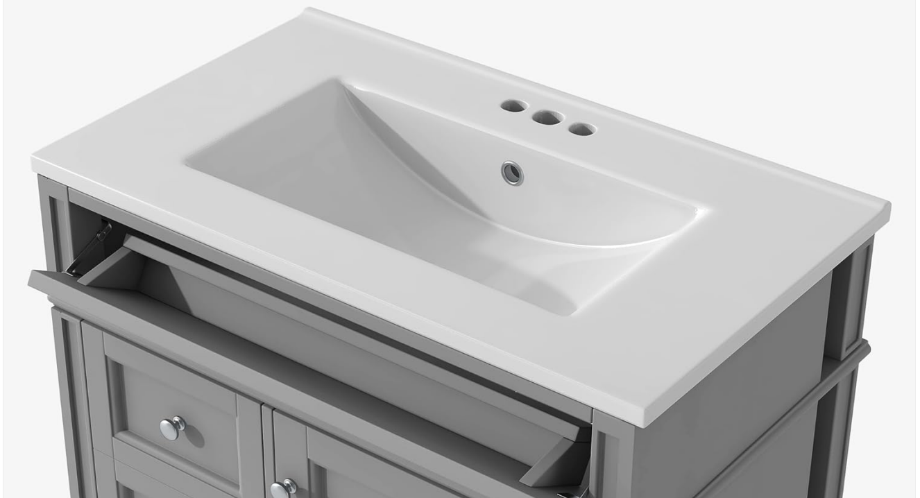
Image: A detailed view of the white ceramic sink top, highlighting its glossy surface and the pre-drilled holes for faucet installation. This image also shows the tip-out drawer partially open.