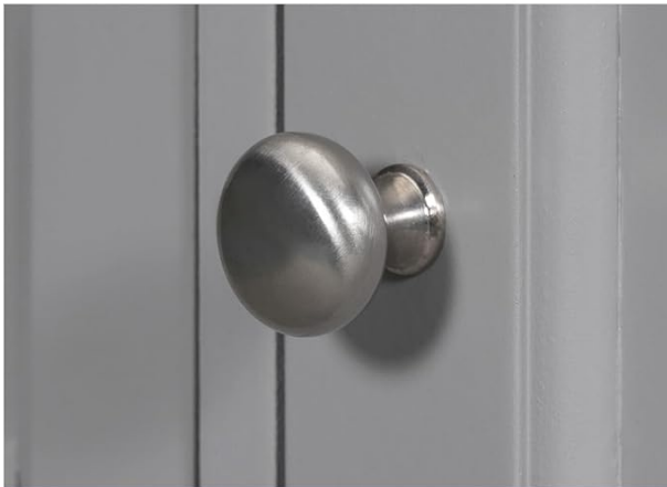
Textured metal handle