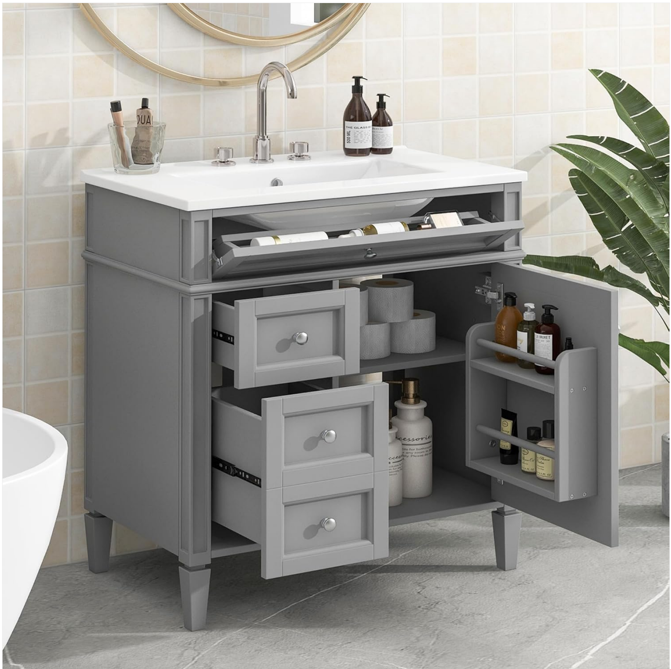
Image: The Virubi 30 Inch Bathroom Vanity with its cabinet door and drawers open, showcasing the internal storage compartments and the tip-out drawer beneath the sink. The vanity is grey with a white ceramic sink.