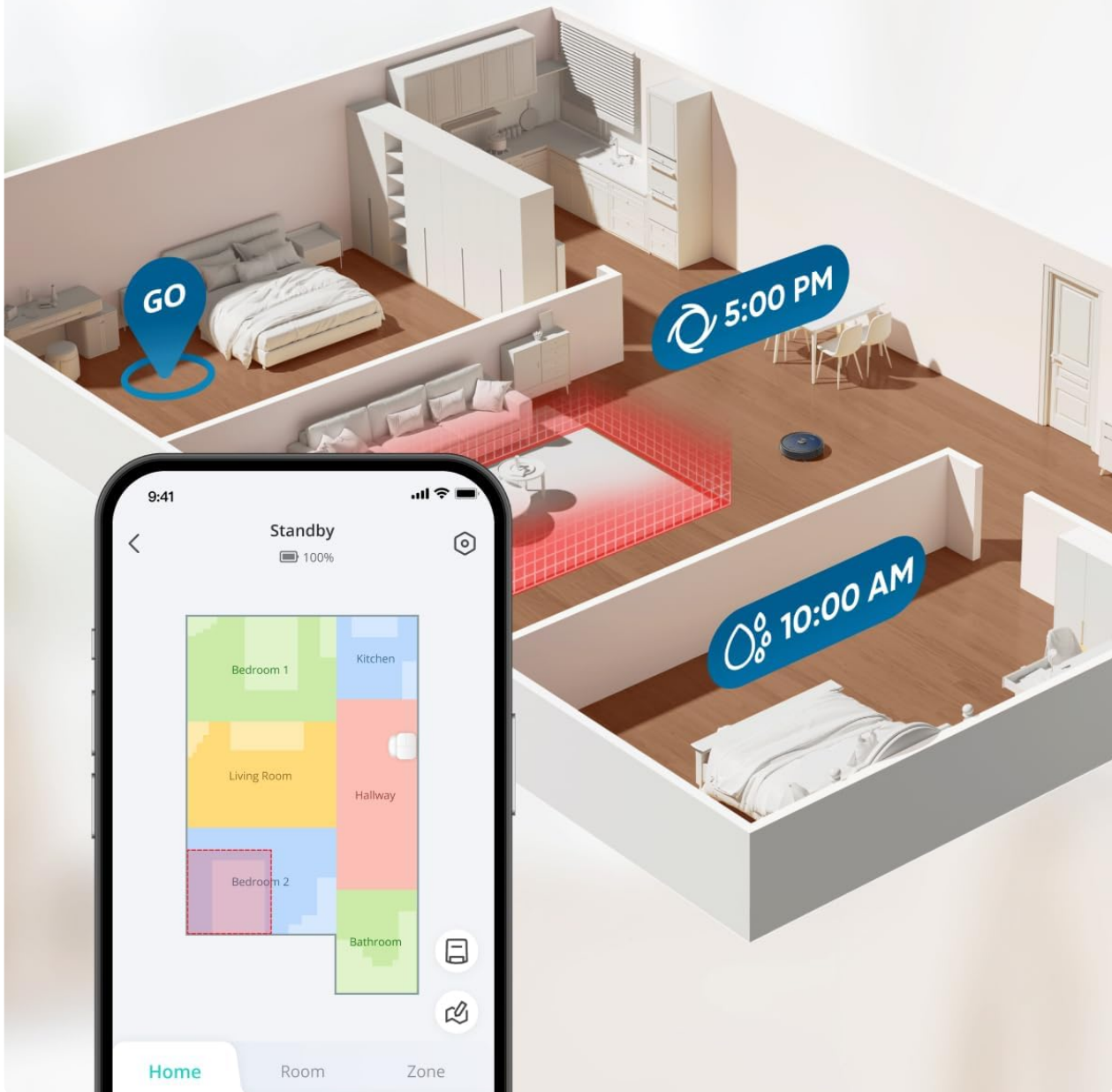
Figure 4: The eufy Clean app displaying a customizable floor plan, allowing users to tailor cleaning routines.