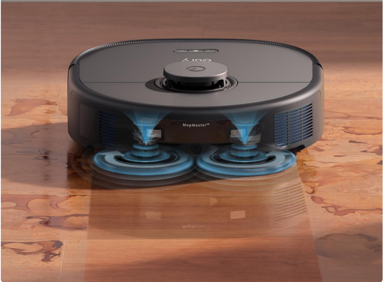
Figure 7: The dual rotating mop pads of the eufy X10 Pro Omni, designed for effective scrubbing.