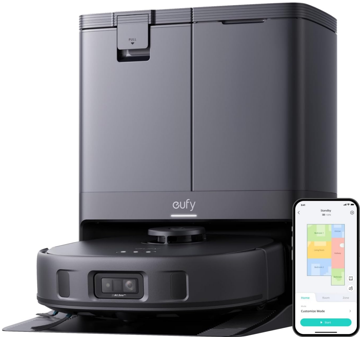
Figure 1: eufy X10 Pro Omni Robot Vacuum and Mop Combo with its Omni Station and a smartphone displaying the app interface.