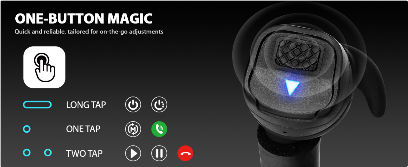
Image: One-Button Magic controls.