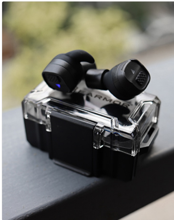
Image: Earbuds in charging case.

Your browser does not support the video tag.