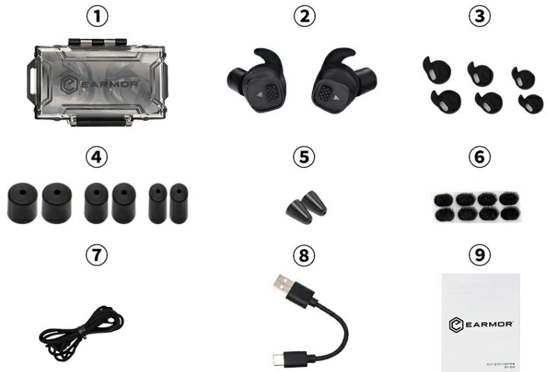
Image: EARMOR M20T package contents.