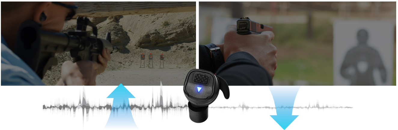
Image: Advanced Ambient Awareness.

Suppress noise above 82dB; enhance communication and awareness