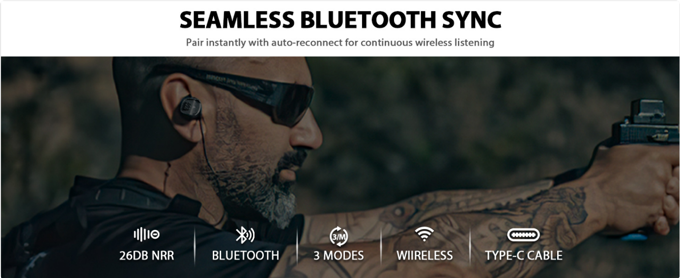
Image: Seamless Bluetooth Sync.