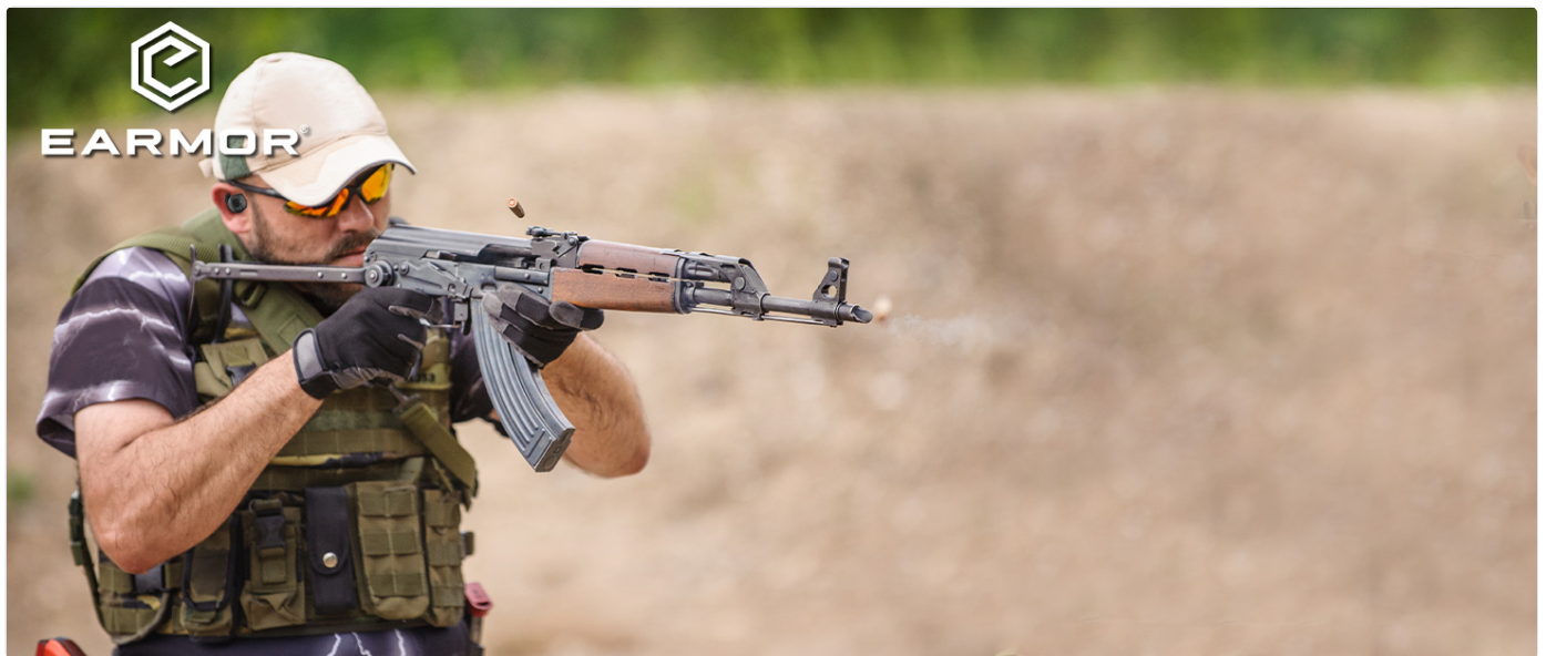
Image: Proper wearing of EARMOR M20T earbuds.