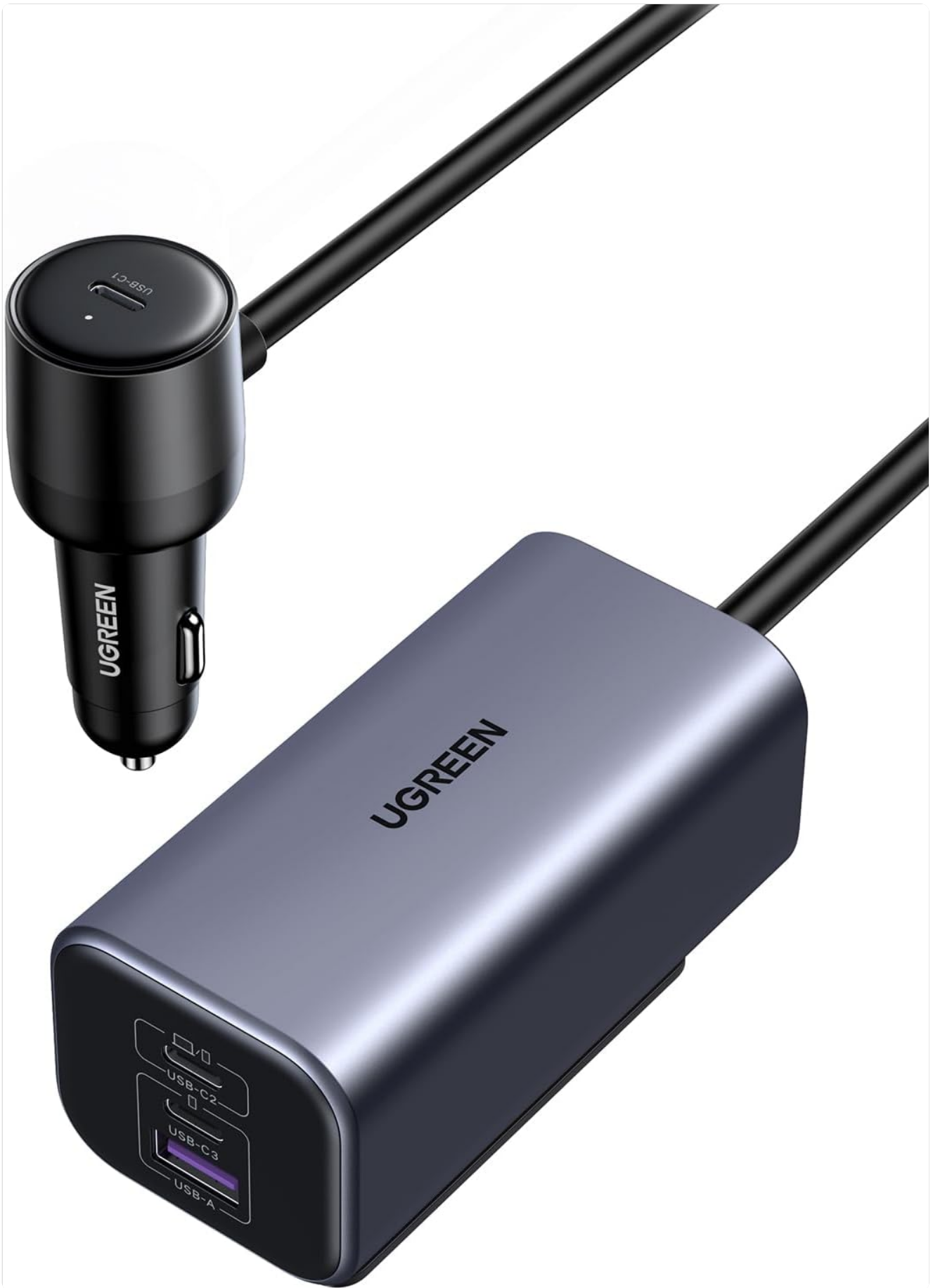
The UGREEN 150W USB C Car Charger and its accompanying 3.3 ft charging cable.