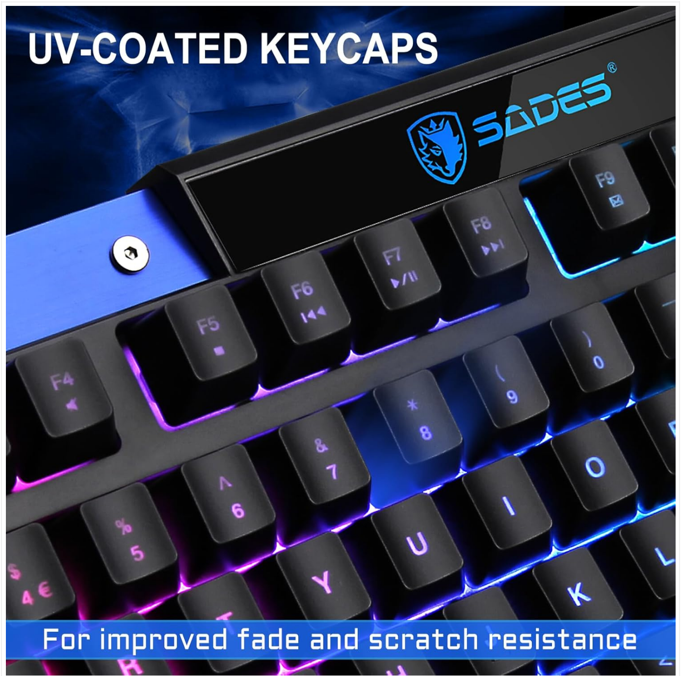
Image: Close-up of the keyboard's UV-coated keycaps, designed for enhanced durability against fading and scratches.