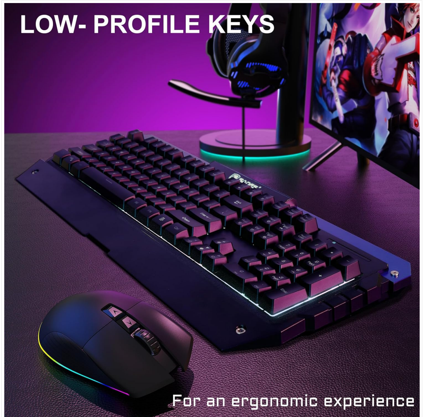
Image: The keyboard featuring low-profile keys, designed to provide an ergonomic typing and gaming experience.