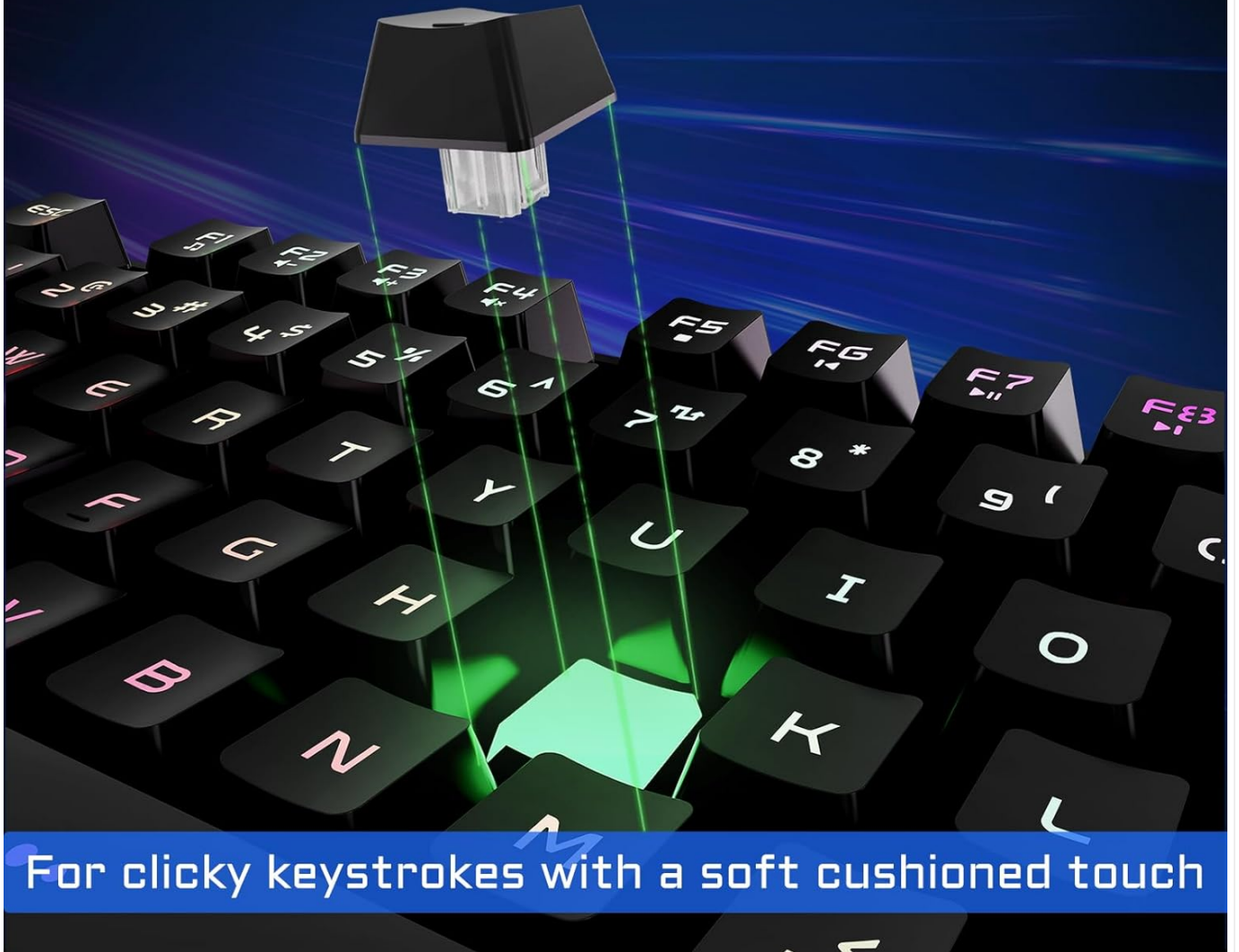
Image: A detailed view of the SADES Mecha-Membrane switches, illustrating their design for a tactile keystroke experience.