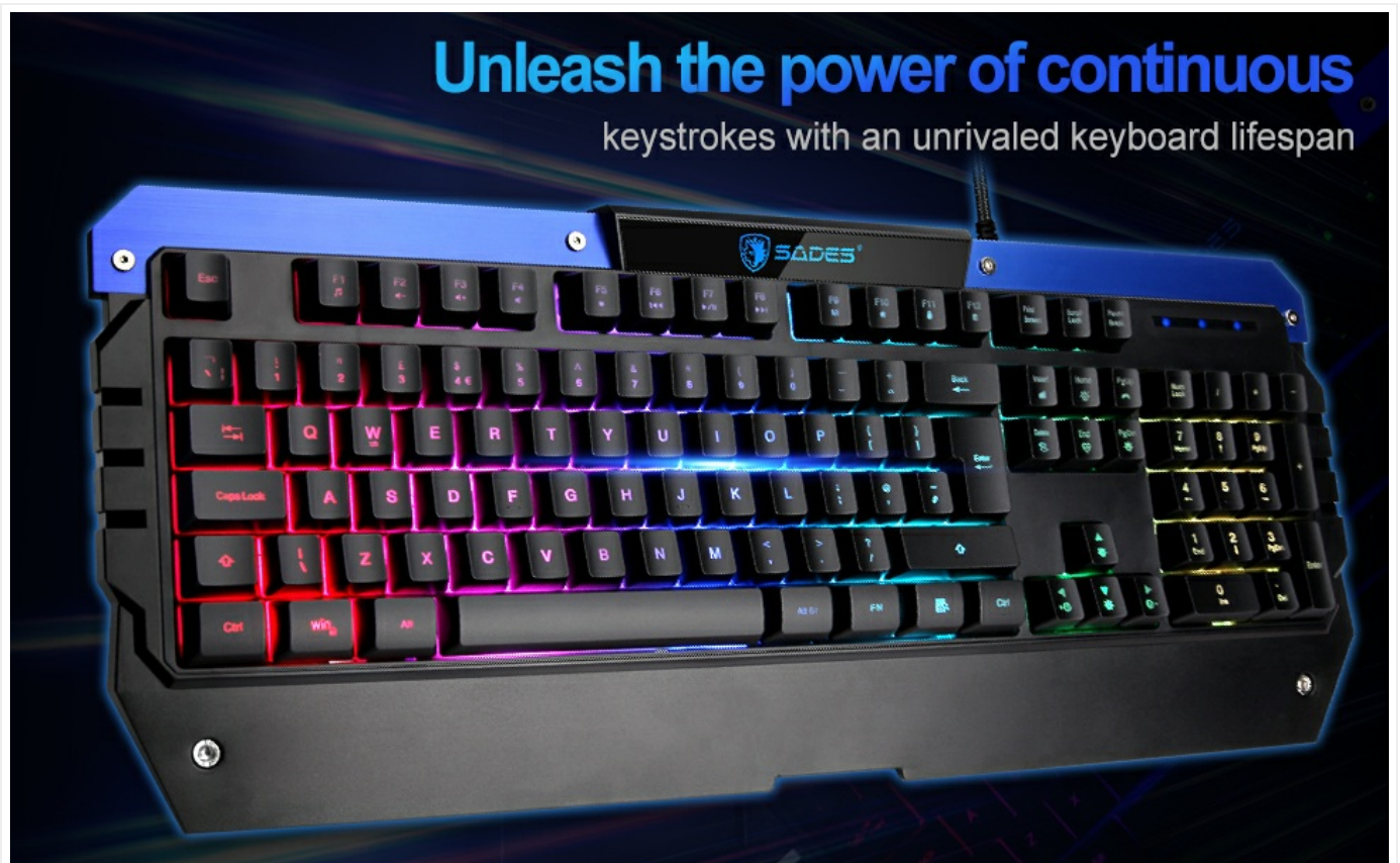
Image: Illustration highlighting the FN+WIN key combination, 12 multimedia shortcuts, and 104 anti-ghosting keys on the SADES gaming keyboard.