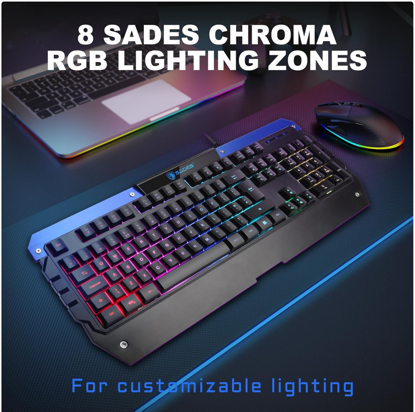
Figure 5.1: SADES Battle Ram Gaming Mouse with customizable RGB lighting.