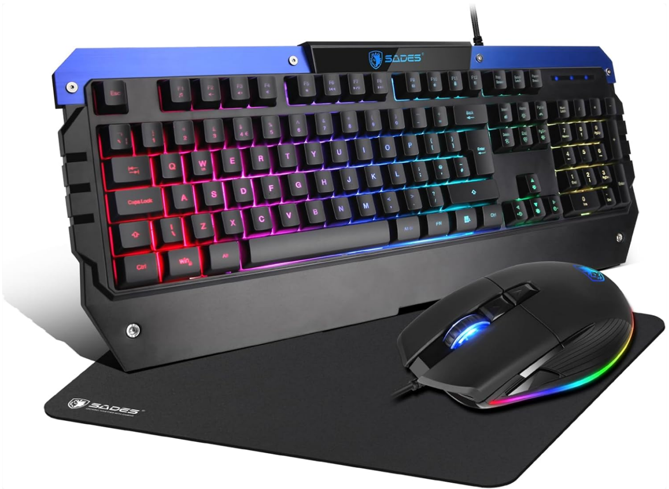
Figure 3.1: SADES Battle Ram Gaming Keyboard and Mouse connected and ready for use.