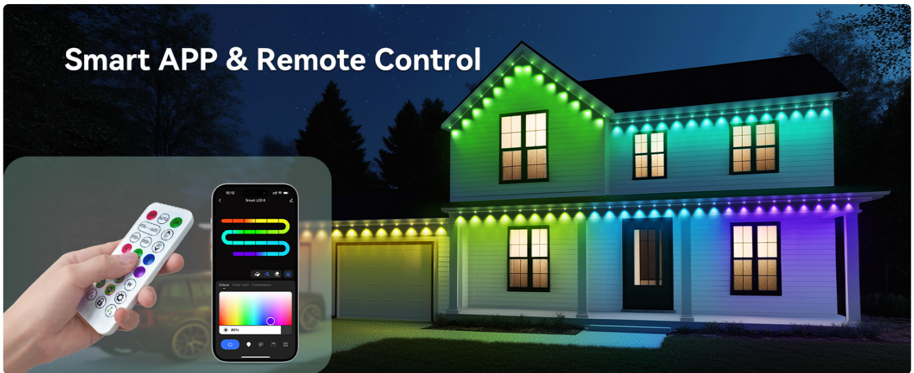
Figure 1: Overview of the Permanent Outdoor Lights Kit contents.