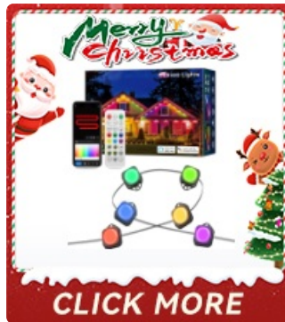
Figure 6: Remote control for the lights.

Use the included remote control for quick adjustments to colors, modes, and brightness. Ensure the remote has a clear line of sight to the control box.