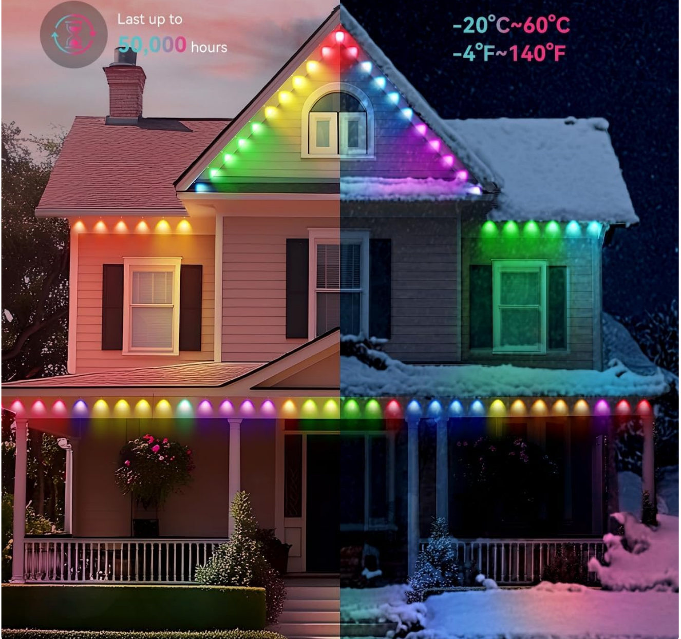
Figure 8: Warm and Cold White lighting options.