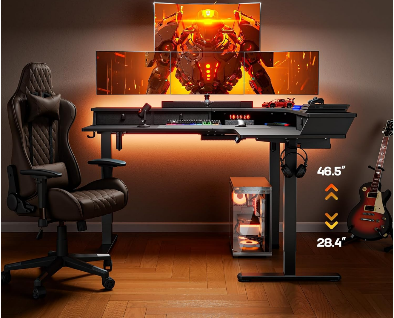
Image: Visual representation of the ErGear L-Shaped Standing Desk adjusting between its minimum height of 28.4 inches and maximum height of 46.5 inches, illustrating the ergonomic flexibility.