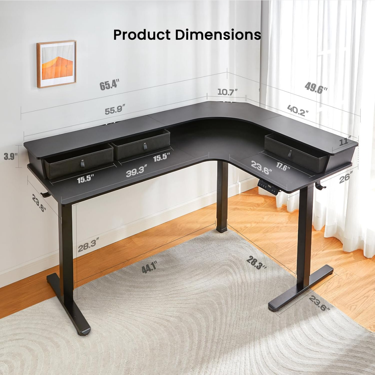
Image: Overview of the ErGear L-Shaped Standing Desk with key dimensions indicated, providing a visual guide for assembly and placement.