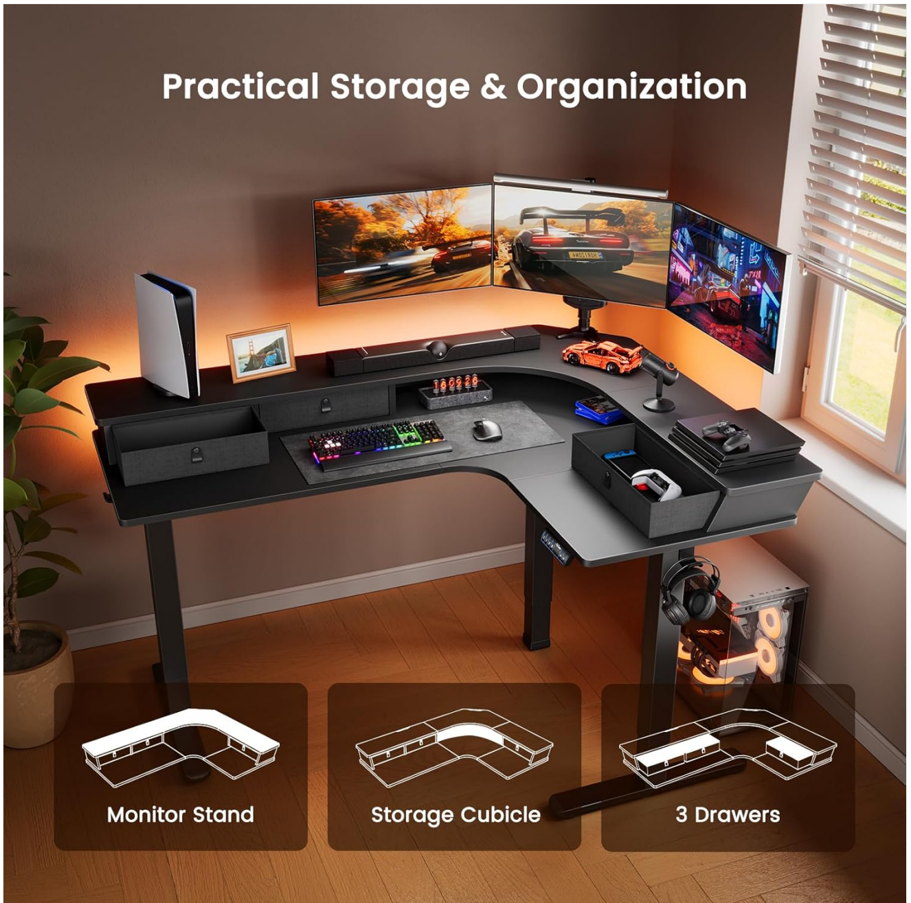
Image: The ErGear L-Shaped Standing Desk showcasing its practical storage features, including the monitor stand, storage cubicle, and three drawers, with a gaming setup for context.