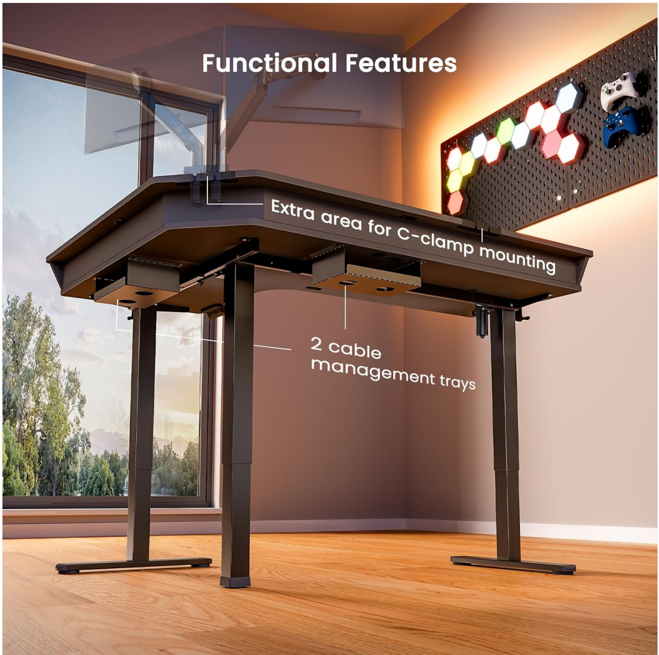
Image: Underside view of the ErGear L-Shaped Standing Desk, highlighting functional features such as the extra area for C-clamp mounting and the two cable management trays.