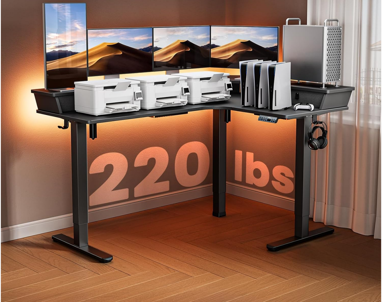
Image: Close-up view highlighting the powerful dual motors and the 220 lbs weight capacity of the ErGear L-Shaped Standing Desk, demonstrating its robust lifting mechanism.