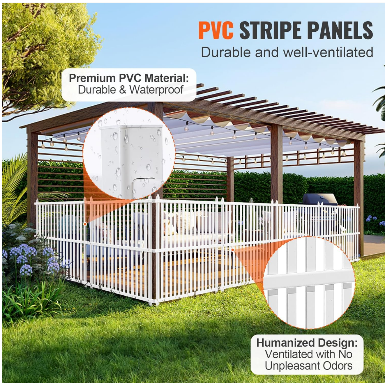
Image 1.1: Overview of VEVOR PVC Strip Panels, highlighting durable, waterproof, and ventilated design.