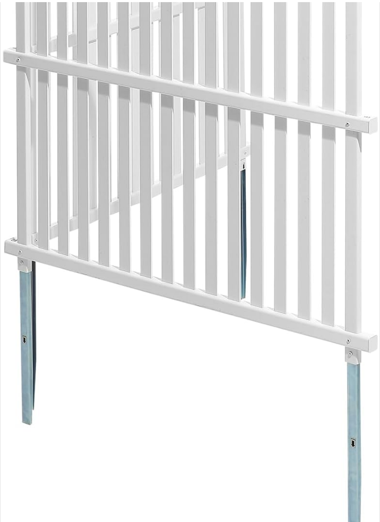
Image 3.4: Example of the fence panels used to enclose an air conditioning unit.