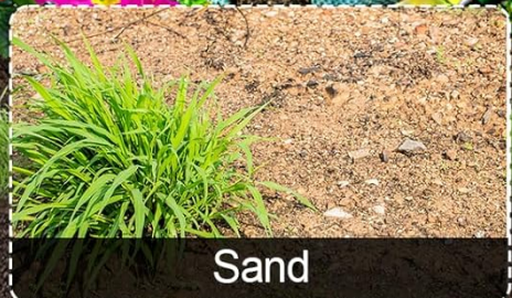
Image 3.3: The pointed metal ground stakes are suitable for various soft grounds like soil, gravel, or sand.