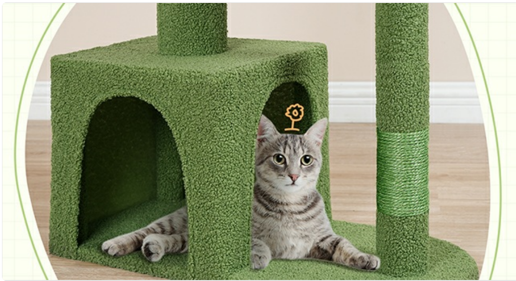
Image 3.2: A kitten engaging with the scratching post section of the cat tree, highlighting its utility for natural feline behavior.