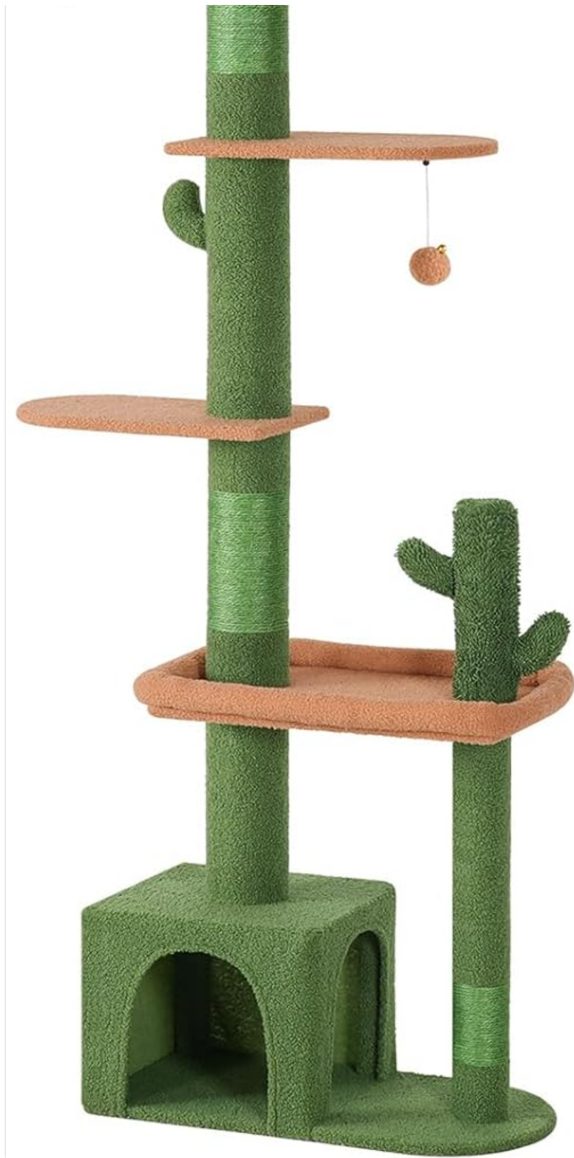
Image 1.1: The HOOBRO Cactus Cat Tree, showcasing its multi-tiered structure and green and brown color scheme.