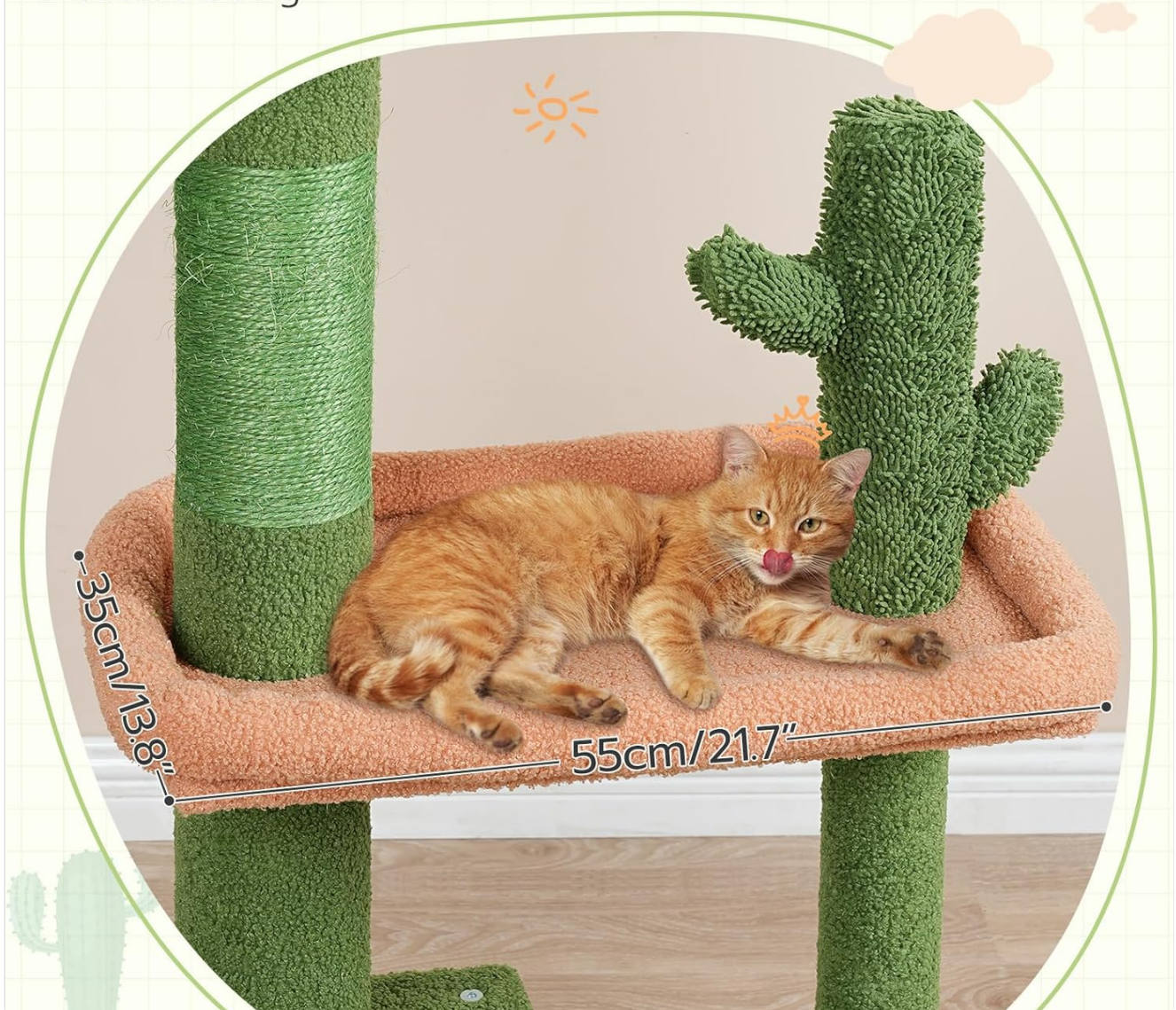
Image 3.1: A cat comfortably resting on the large platform of the cat tree, demonstrating a potential use for the space.

Offering a more comfortable rest and play space with a cactus design.