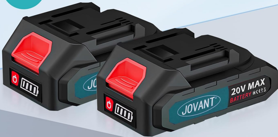
Image: Two jovant 20V 2.0Ah Lithium-ion Batteries, indicating a two-piece set.