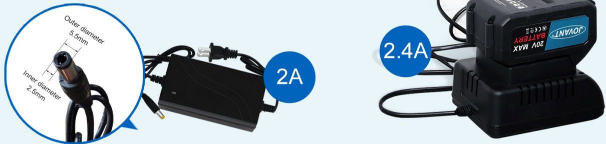
Image: Diagram illustrating the Jovant 20V battery being charged with a compatible Jovant charger, highlighting the charger's specifications.

Your browser does not support the video tag.