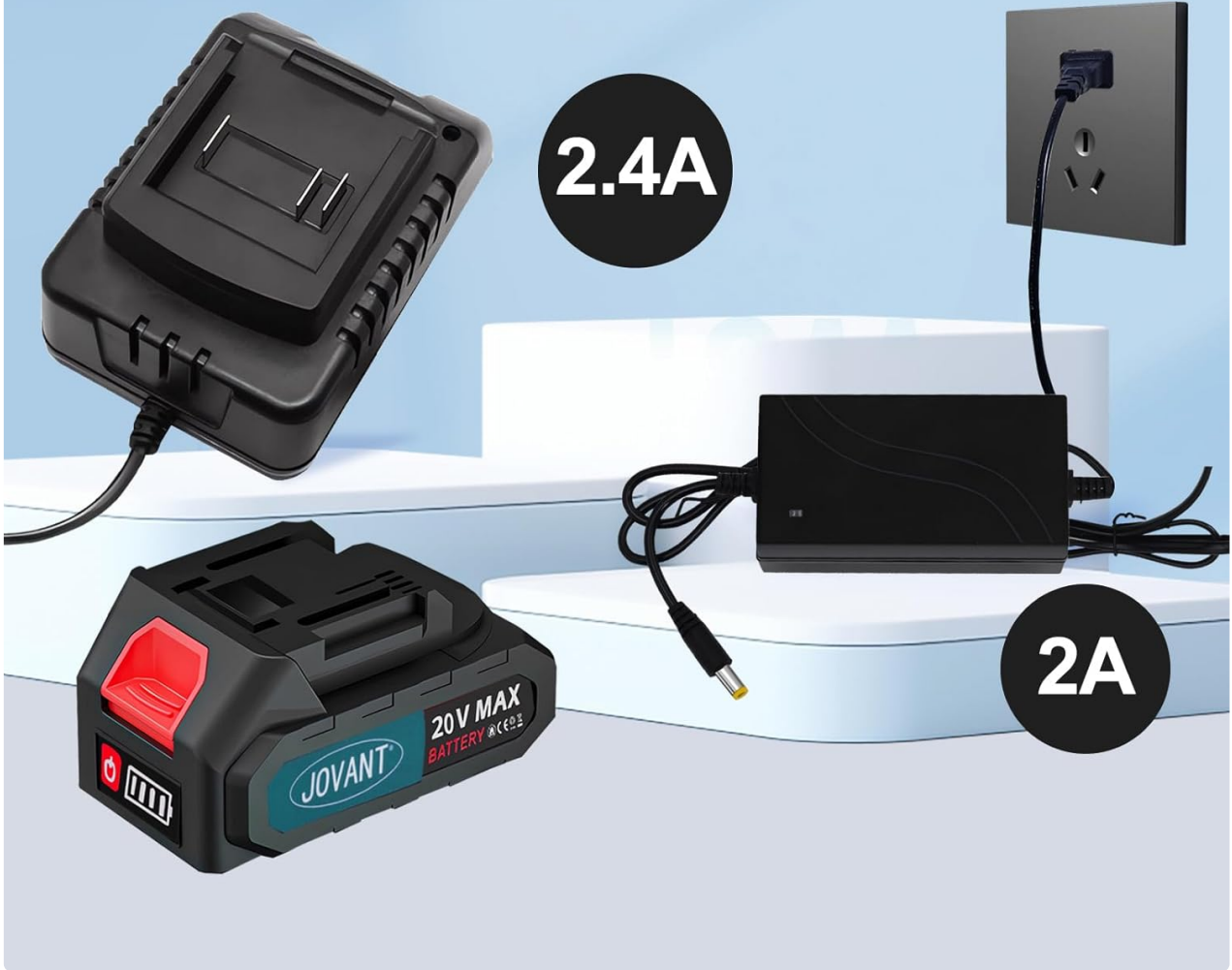
Image: Front view of the jovant 20V 2.0Ah Lithium-ion Battery.