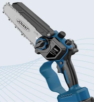
Image: The jovant 20V 2.0Ah battery shown alongside various compatible cordless tools like a nail gun, chainsaw, and pruning shears.