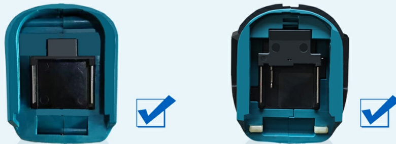
Image: Illustration showing various tool interfaces that are compatible with Jovant 20V batteries.