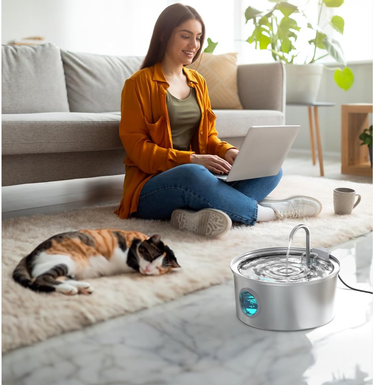
Image: The FOFNON Cat Water Fountain operating quietly in a home environment, demonstrating its low noise level that won't disturb work or rest.