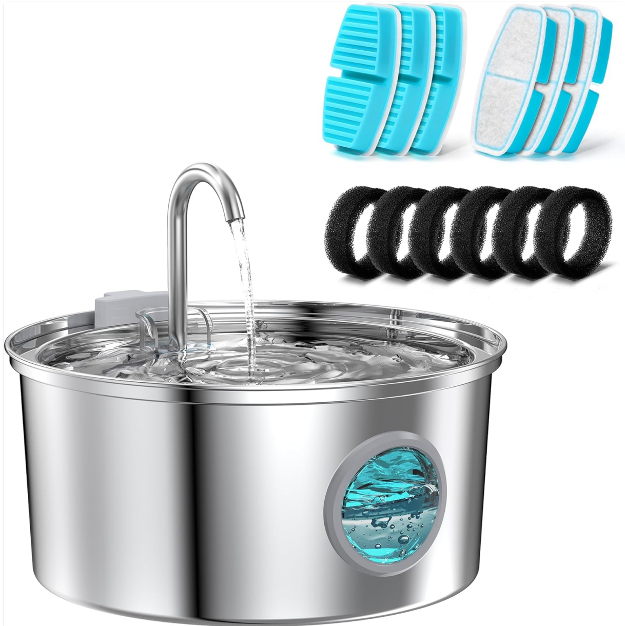
Image: The FOFNON Cat Water Fountain, showcasing its stainless steel design and the included carbon filters and sponge filters.