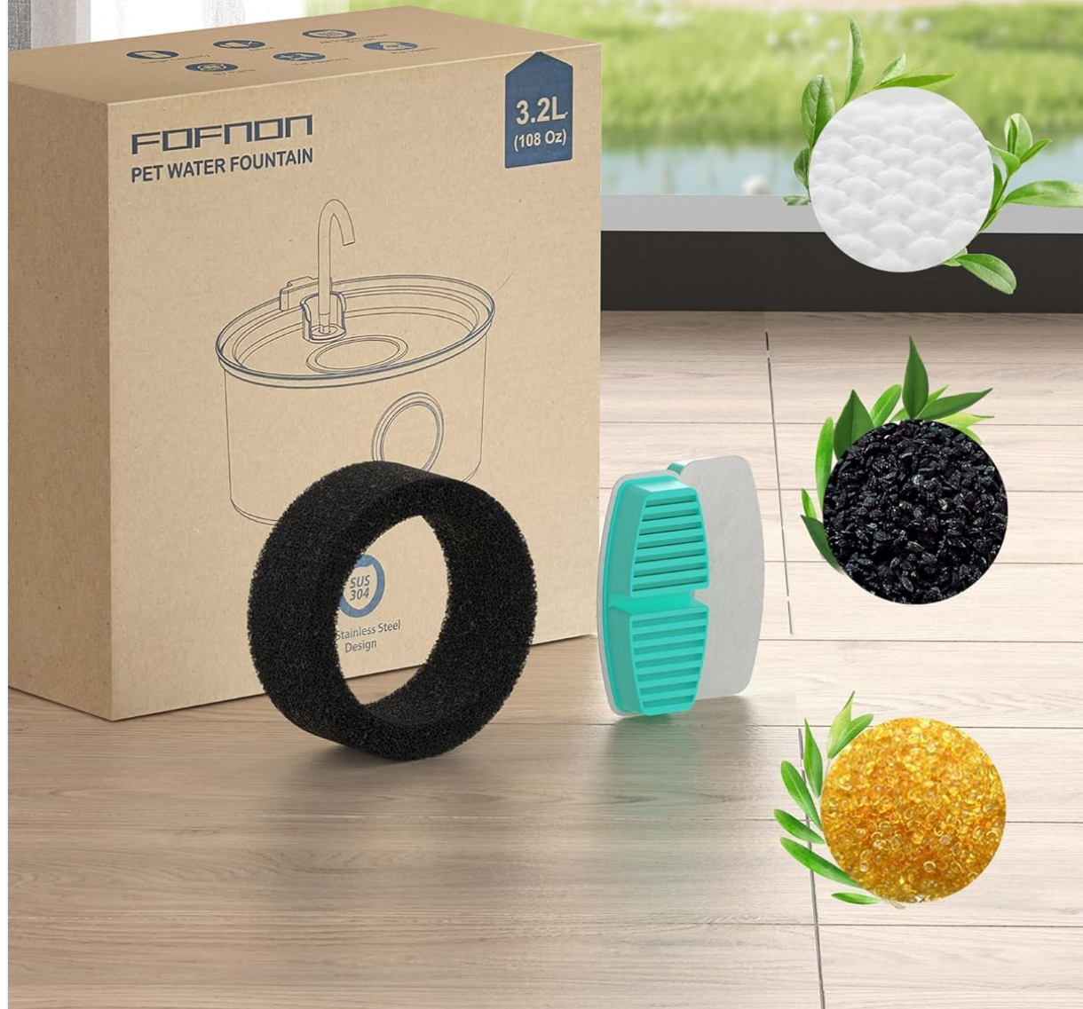
Image: A visual representation of the multi-stage filtration system components, including the carbon filter and sponge filter, alongside the fountain packaging.