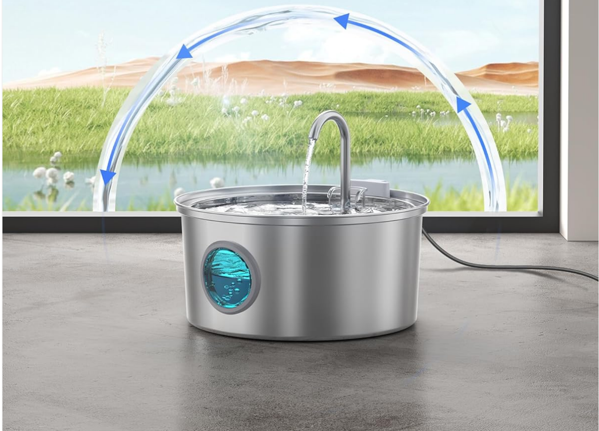
Image: The FOFNON Cat Water Fountain with a continuous stream of water, designed to mimic natural living water and encourage pets to drink more.