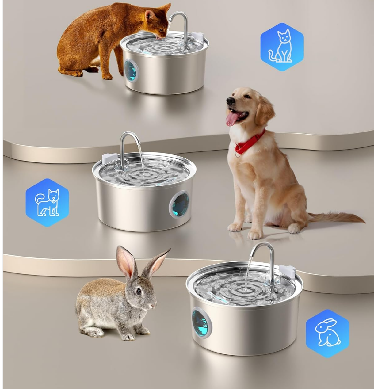
Image: The FOFNON Cat Water Fountain shown with different pets (cat, dog, rabbit), illustrating its 3.2L capacity suitable for various animals.