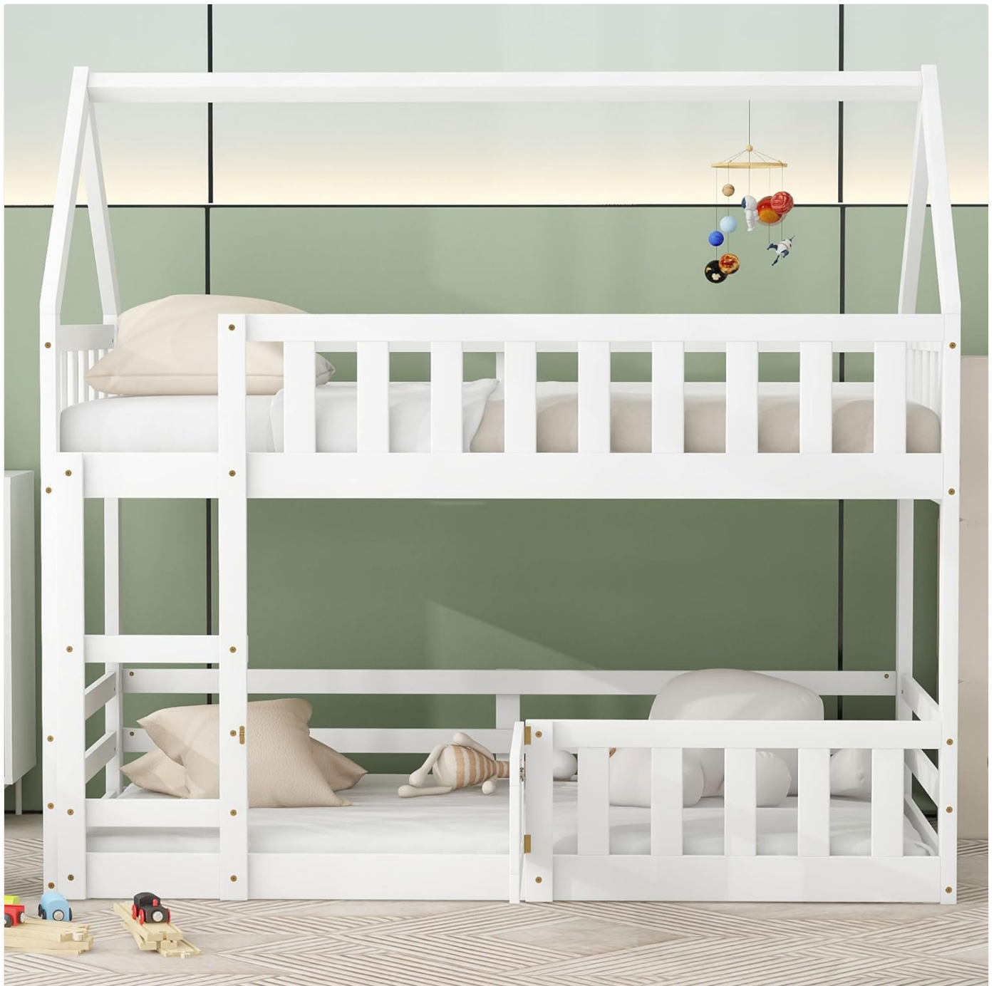
Figure 3: Side View with Ladder and Door. This image shows the side of the bunk bed, clearly displaying the ladder for the top bunk and the small, hinged door on the lower bunk for easy entry and exit.