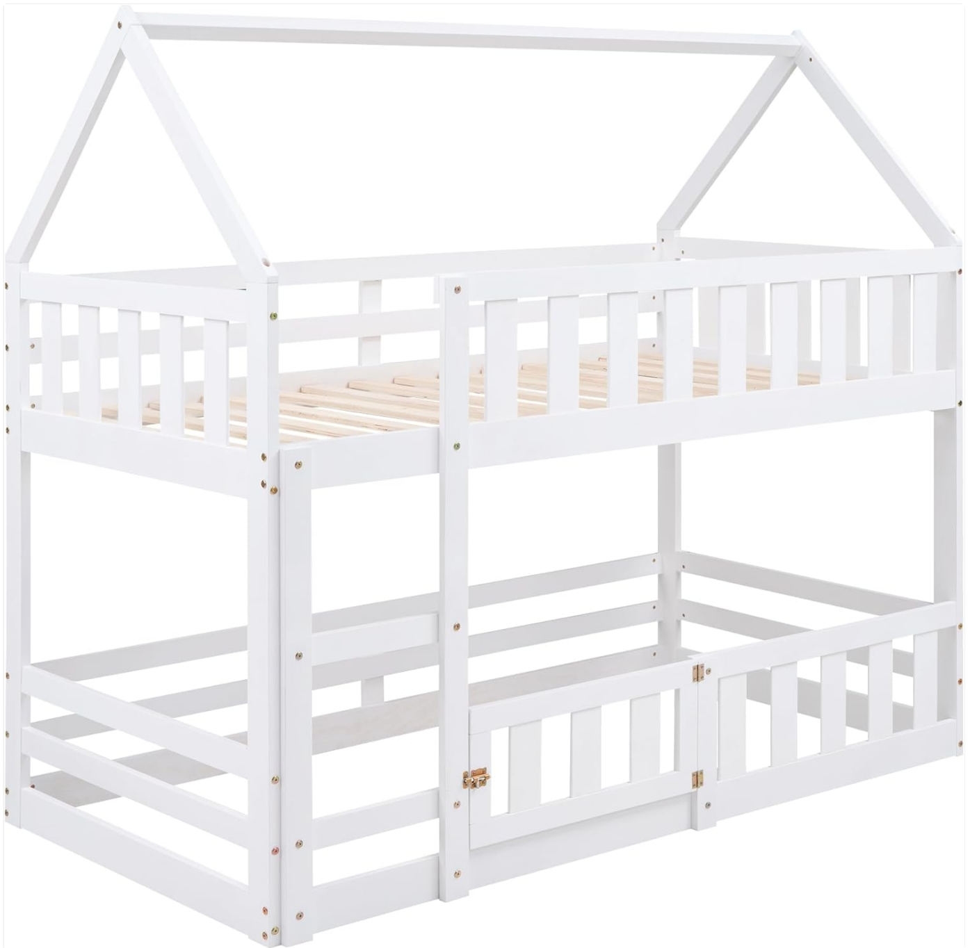
Figure 2: Assembled Bunk Bed Structure. This image provides an angled view of the bunk bed, highlighting the house-shaped roof frame, the ladder, and the guardrails on both the upper and lower bunks.