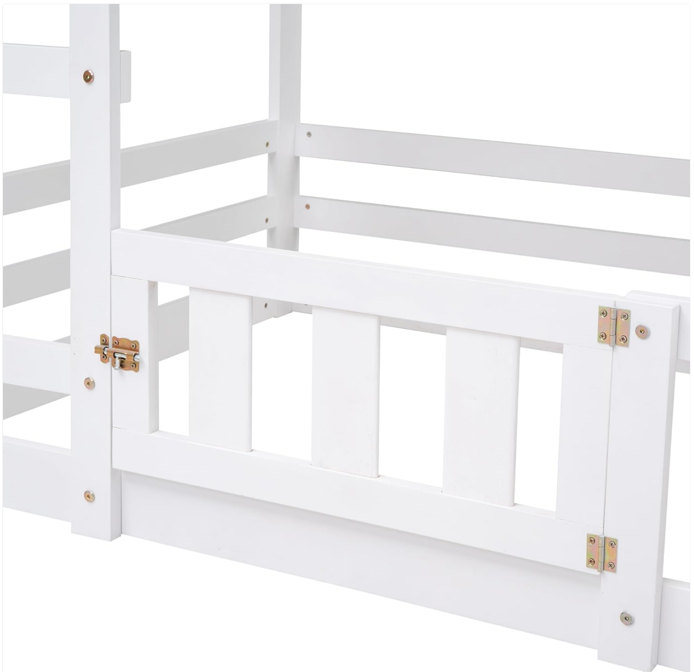
Figure 4: Lower Bunk Door Latch. A detailed view of the latch mechanism on the small door of the lower bunk, demonstrating how it secures the door.