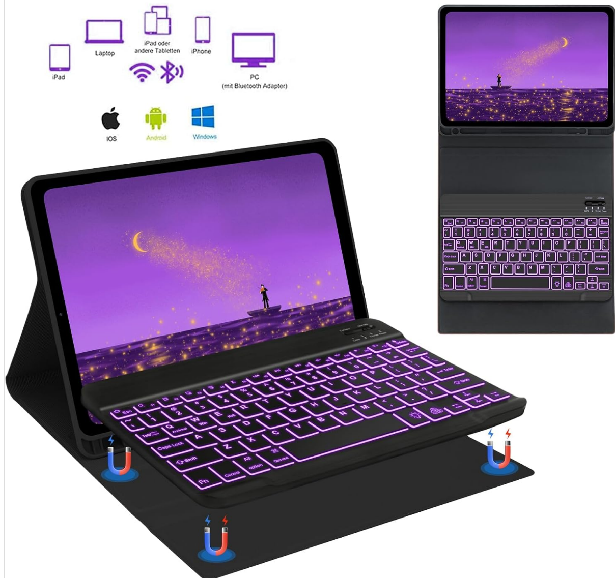
Image 3.1: The detachable wireless Bluetooth keyboard, highlighting its magnetic attachment to the case and compatibility with various operating systems.