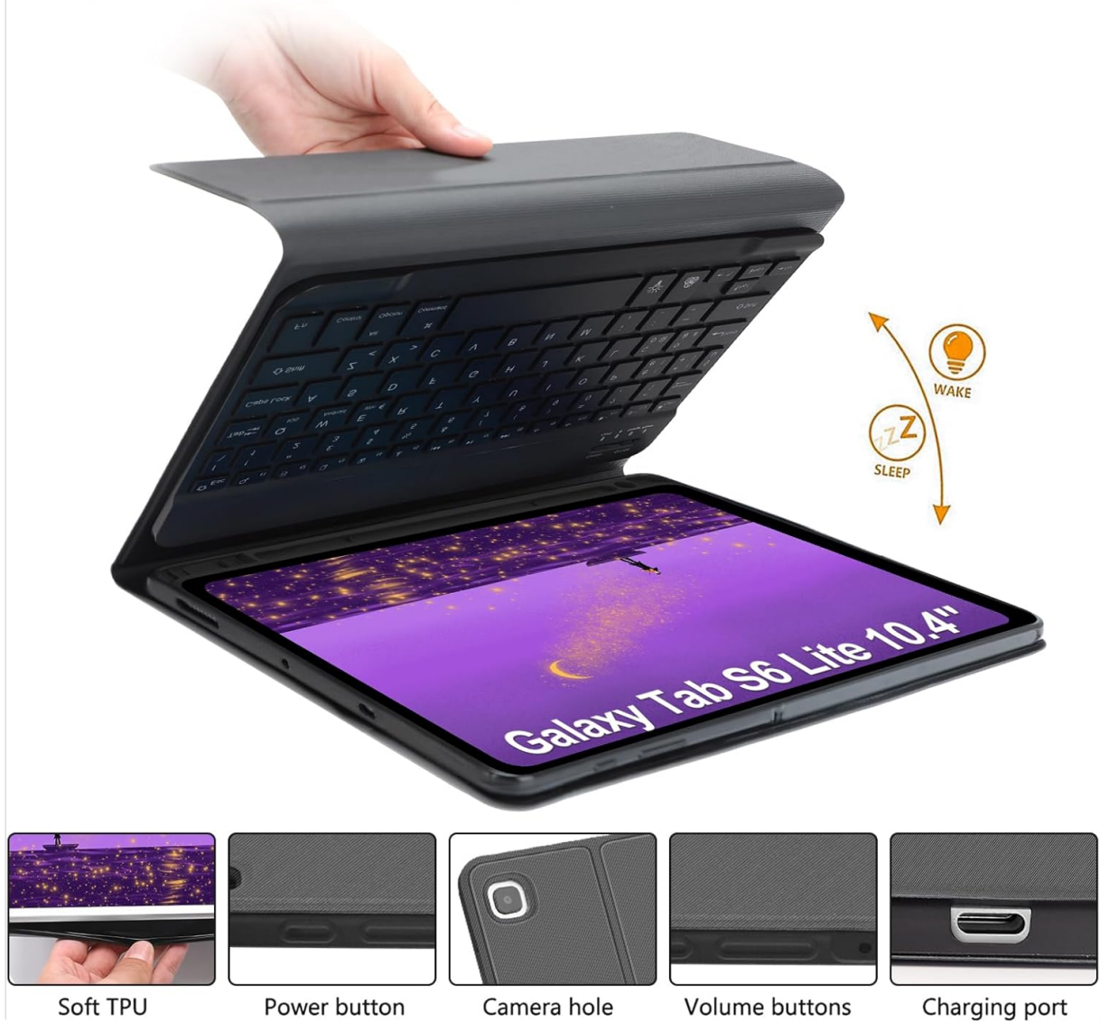
Image 4.4: Illustration of the automatic sleep/wake function, showing the tablet screen turning on when the case is opened and turning off when closed.