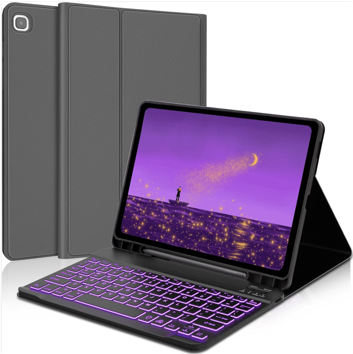
Image 1.1: The IVEOPPE Keyboard Case with a Samsung Galaxy Tab S6 Lite, showcasing the tablet in the case with the backlit keyboard.