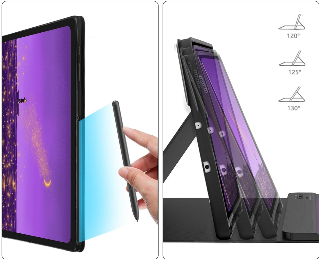
Image 4.2: The tablet case configured to demonstrate three different viewing angles (120°, 125°, 130°).