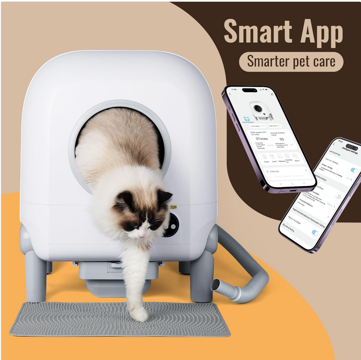
The ZeaCotio ZS-02 integrates with a smart mobile application, allowing users to monitor and control the litter box remotely. This image shows a cat using the unit, while the app interface on the phones highlights features like cleaning cycles, usage tracking, and settings adjustments.