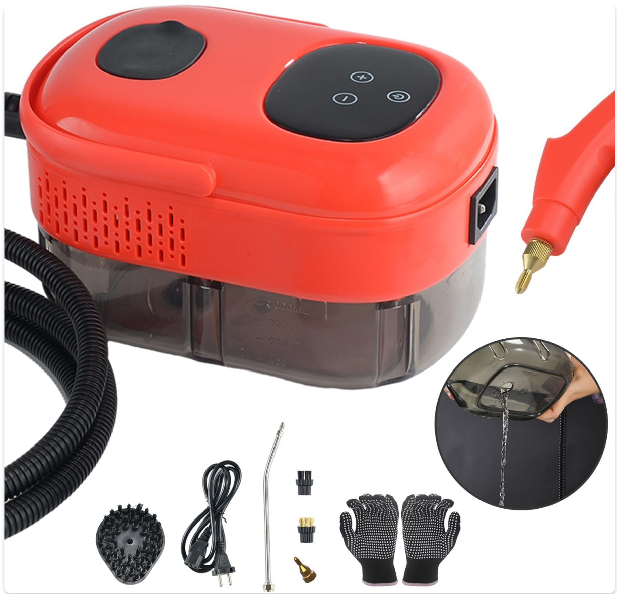
Image 1: Goyappin Handheld Steam Cleaner with included accessories.