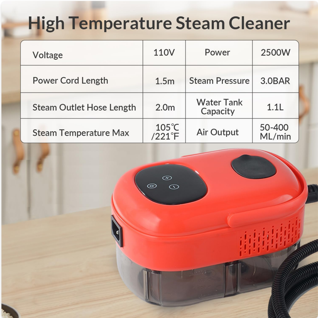
Image 6: Detailed specifications of the Goyappin Handheld Steam Cleaner.