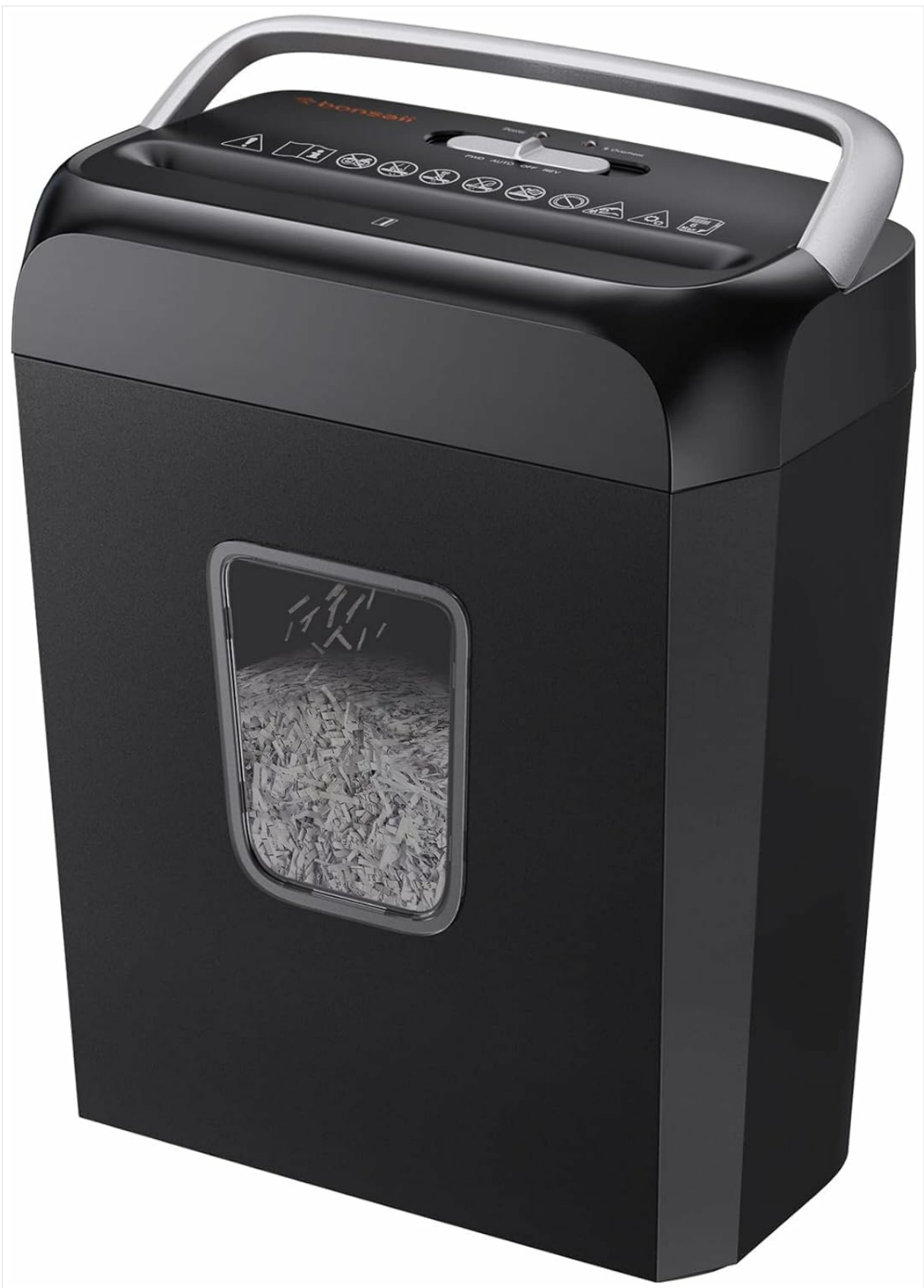
Image: The Bonsai C237-B shredder head placed on its wastebasket, highlighting its 6-sheet capacity and 3-minute continuous shredding time.