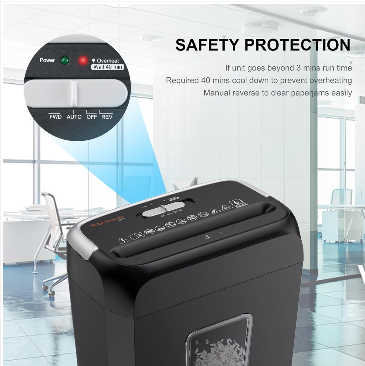
Image: Close-up of the shredder's control panel, showing the FWD, AUTO, OFF, and REV switch positions, along with Power (green) and Overheat (red) indicator lights.

If unit goes beyond 3 mins run time Required 40 mins cool down to prevent overheating Manual reverse to clear paperjams easily