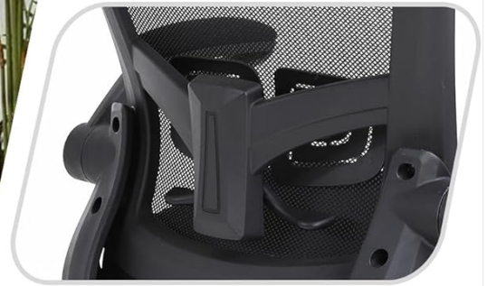
Strong "Y" Backrest