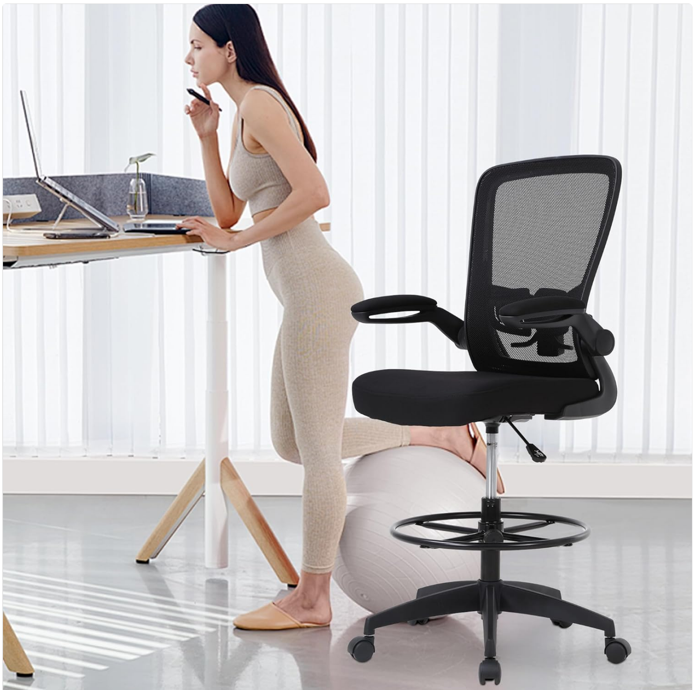
Image: The PayLessHere Ergonomic Drafting Chair in a modern office environment, showcasing its design and functionality.