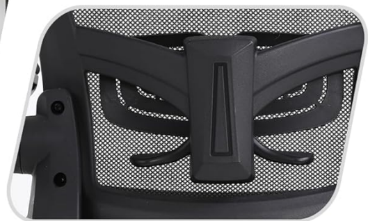
Butterfly shaped waist support

Image: A close-up view illustrating the adjustable seat height lever and the gas lift mechanism, showing the range of adjustment.