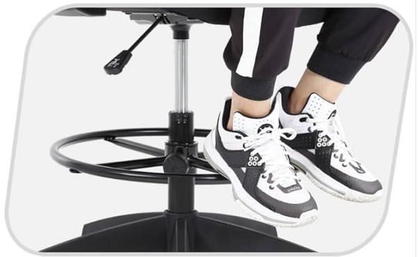
Image: A visual guide demonstrating how to adjust the foot ring to achieve optimal leg support and comfort.