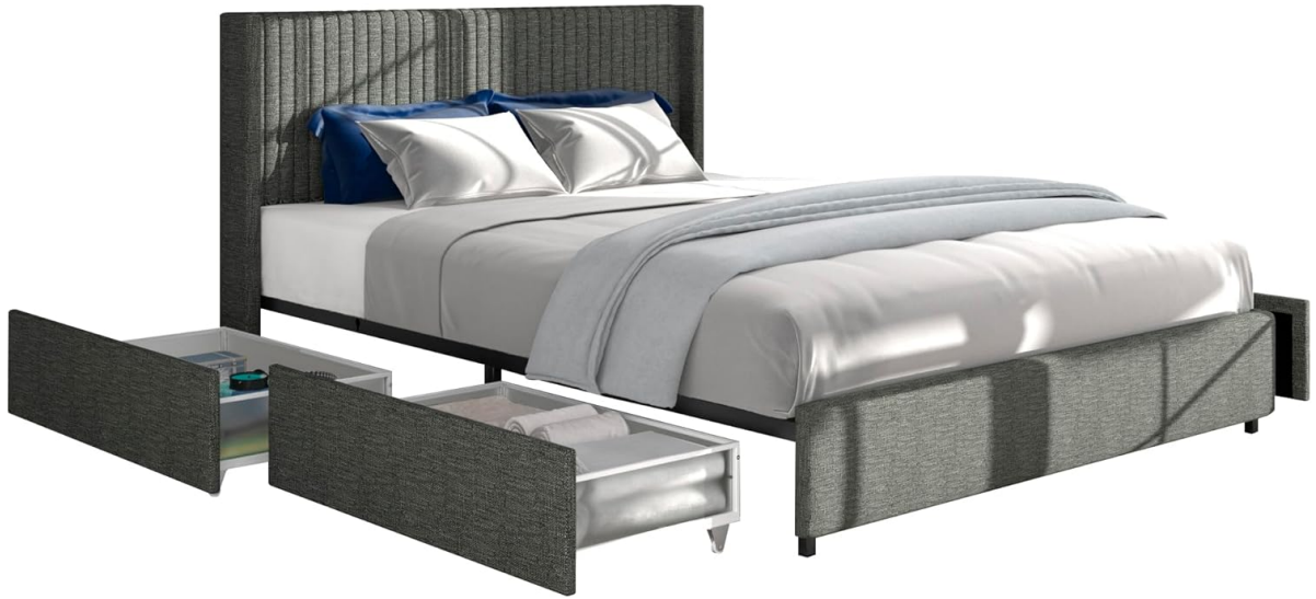
Image: The Anna Platform Bed with two of its four under-bed storage drawers partially extended, showing their capacity.

7. Final Check: Ensure all bolts are tightened and the bed frame is stable before placing your mattress.