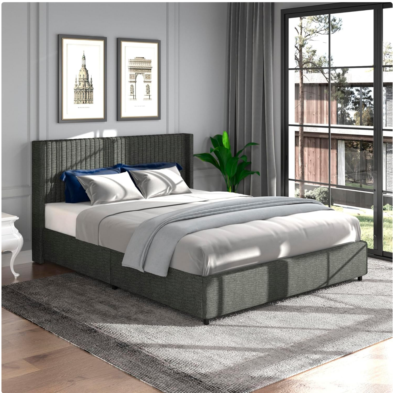
Image: The Anna Queen Size Gray Linen Upholstered Wingback Platform Bed, showcasing its modern design and wingback headboard in a bedroom environment.