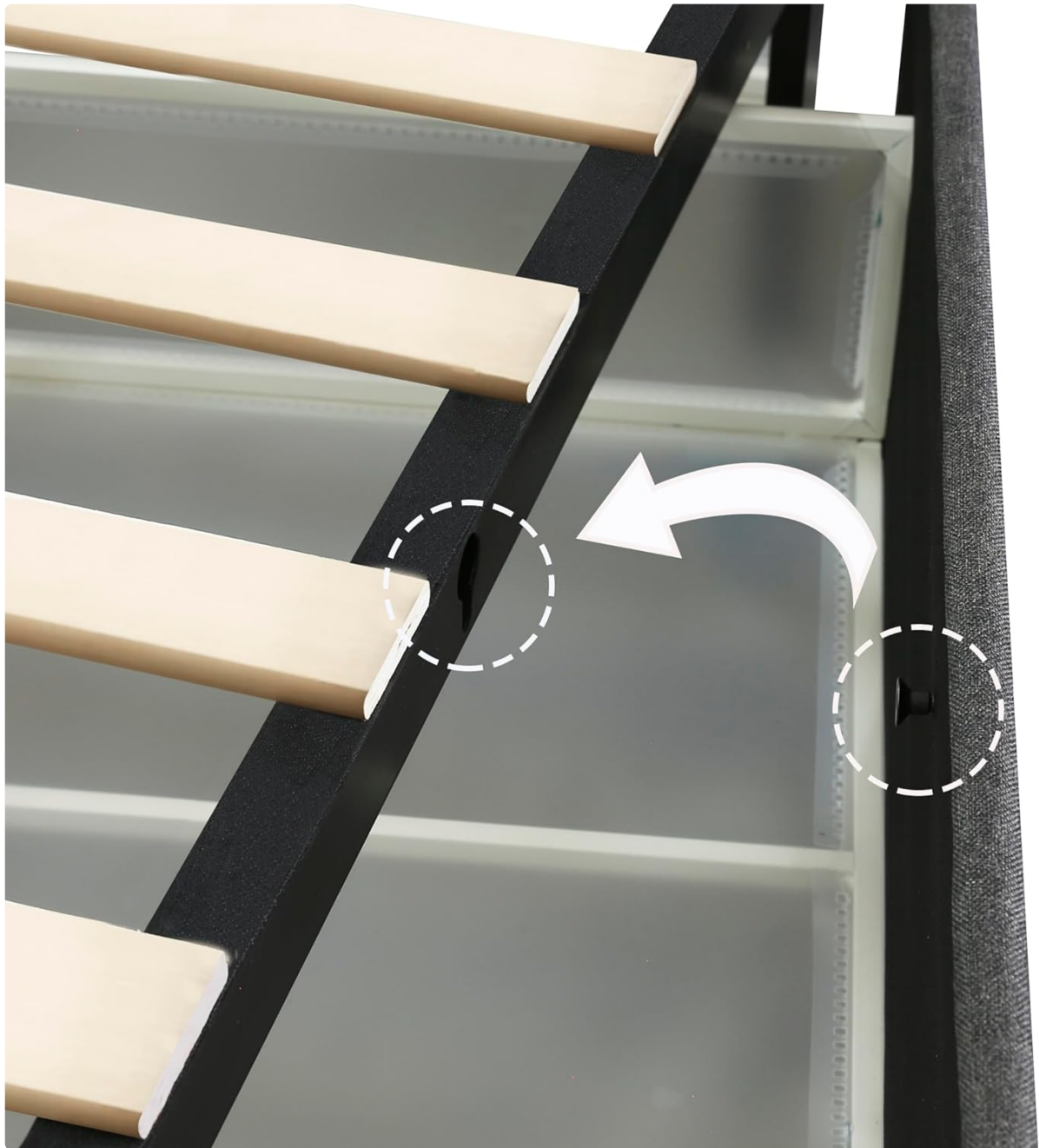
Image: A close-up view illustrating how the wooden slats attach to the bed frame, ensuring secure mattress support.