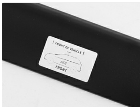
Image: Ensure the crossbar labeled "FRONT OF VEHICLE" is positioned correctly.