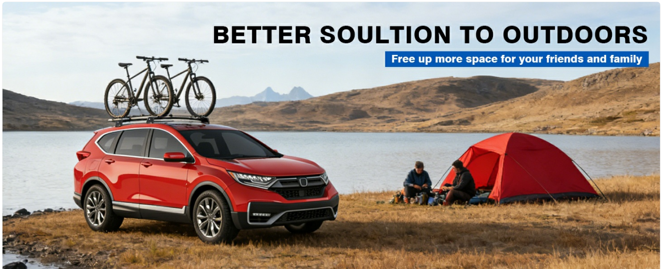
Image: Illustrates the roof rack's capacity and design features for carrying various cargo.