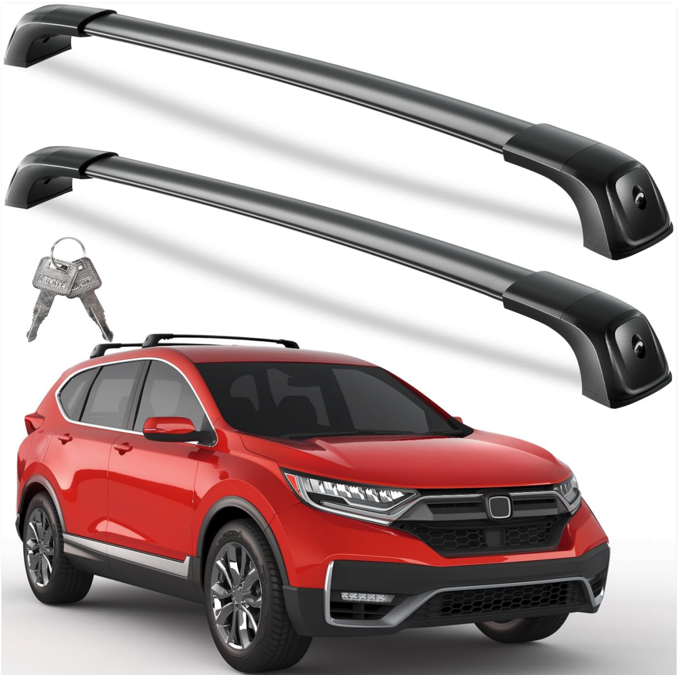
Image: Wonderdriver Roof Rack Cross Bars installed on a red Honda CRV, showcasing the product's appearance.