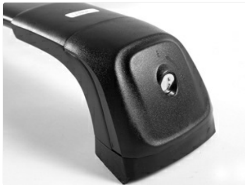
Image: The integrated lock mechanism for added security.