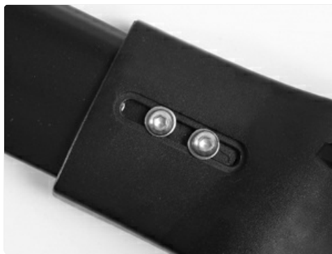
Image: The special bolts provided for secure attachment.