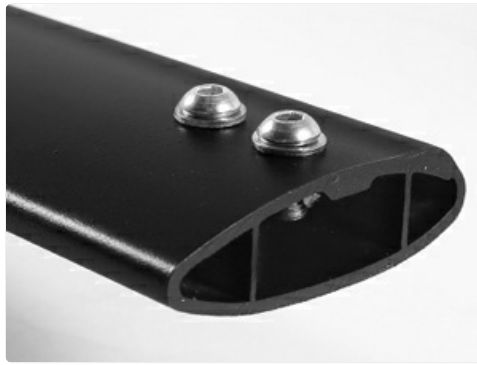
Image: Detail of screws used to secure the base to the crossbar.