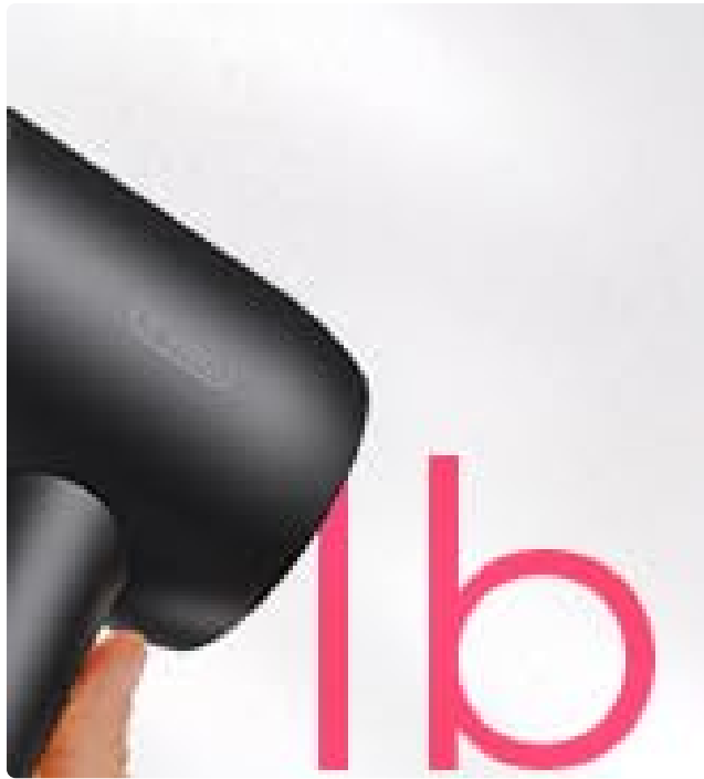
Step 2: Orient: Demonstrates how to hold the device and insert a hair section.