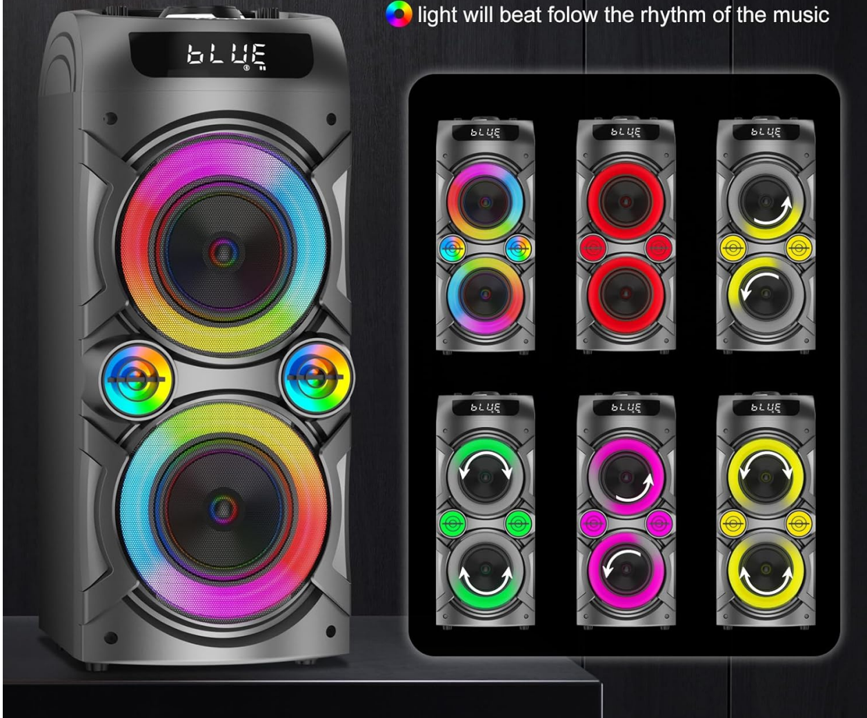
Image: The speaker showcasing different colorful disco light modes.