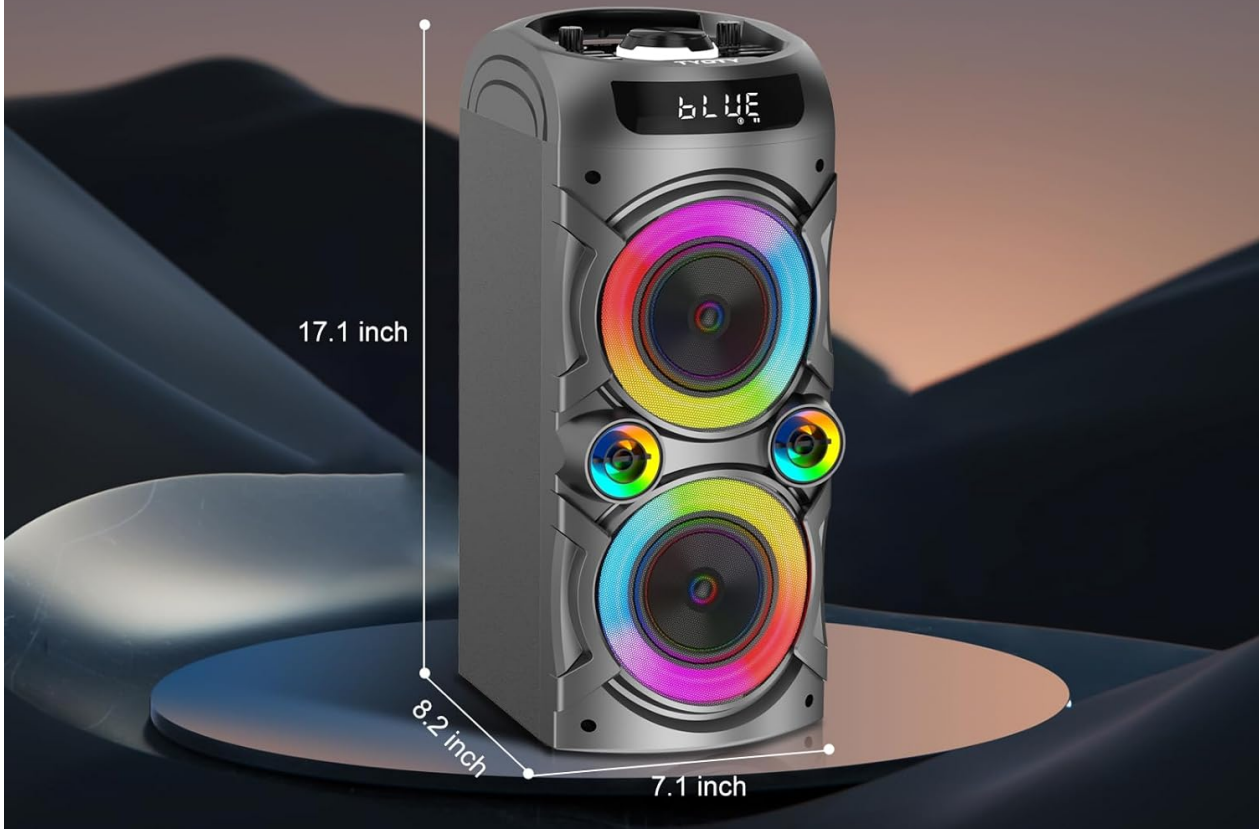
Image: The TYOTY A90 Karaoke Machine highlighting its portable design and key features like Bluetooth 5.0, dual microphones, colorful lights, AUX, and USB connectivity.