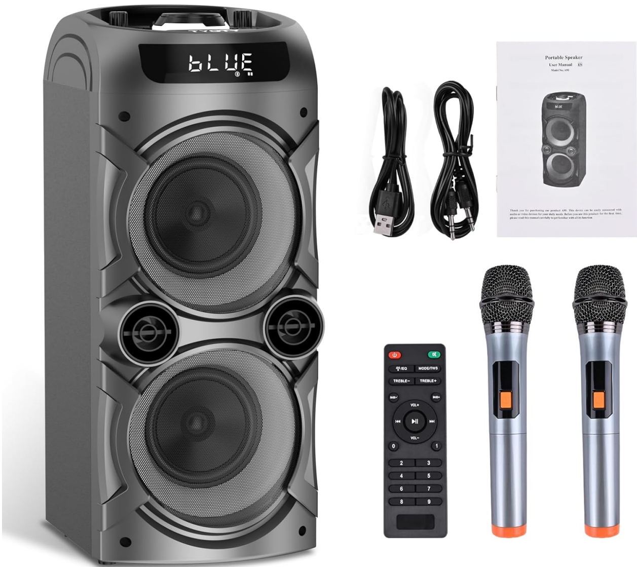
Image: All components included in the product package, neatly laid out.