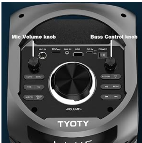
Image: Detailed view of the control panel, showing input ports, volume knobs, and function buttons.