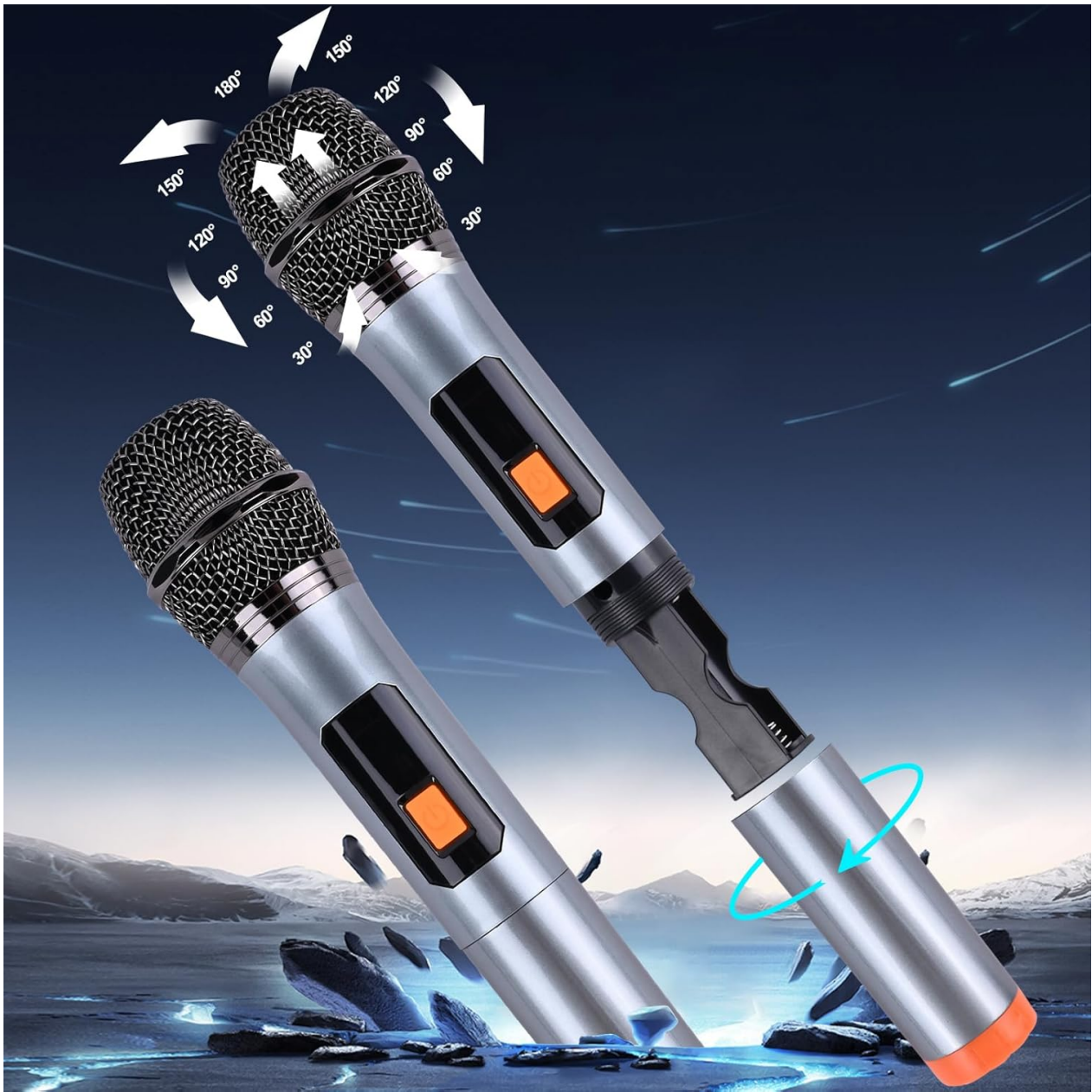
Image: The two wireless microphones, showing how to access the battery compartment.

Video: A seller's video demonstrating the functionality of the wireless microphones with the karaoke machine.