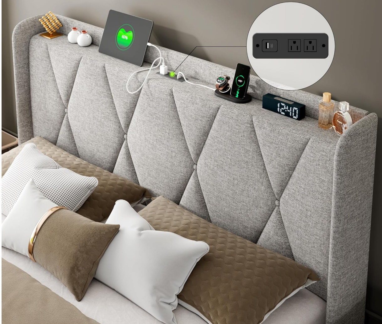
Image 5.1: Close-up of the upholstered headboard, showing the integrated 2 AC outlets, 1 USB, and 1 Type-C port for convenient device charging.

No more worrying about not being able to charge in bed