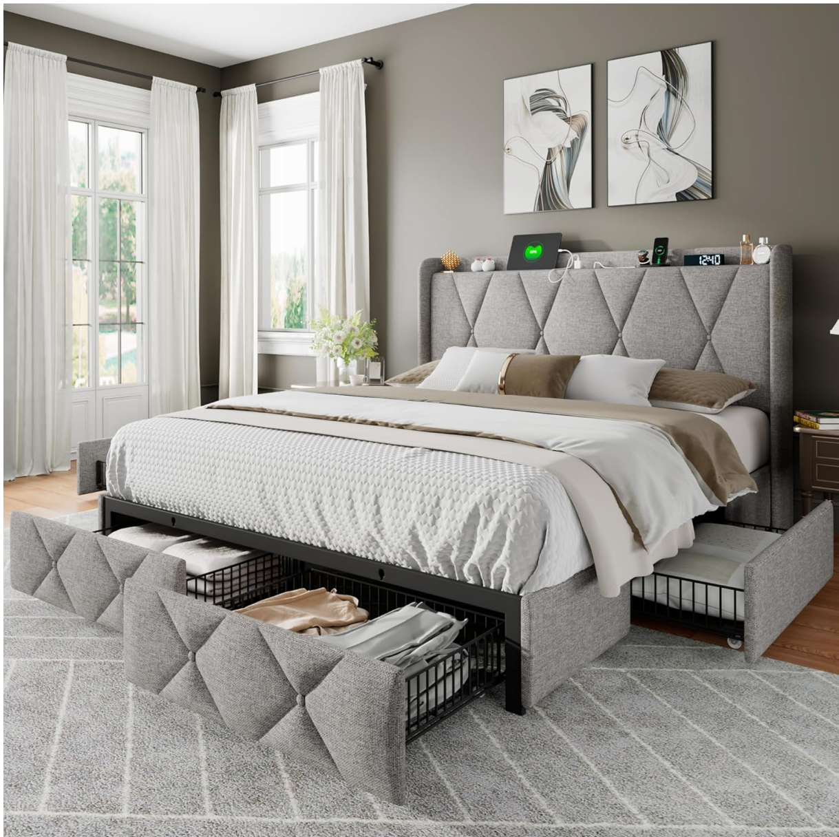
Image 1.1: Fully assembled Feonase Full Bed Frame in light grey, showcasing the upholstered headboard, integrated charging station, and four pull-out storage drawers.