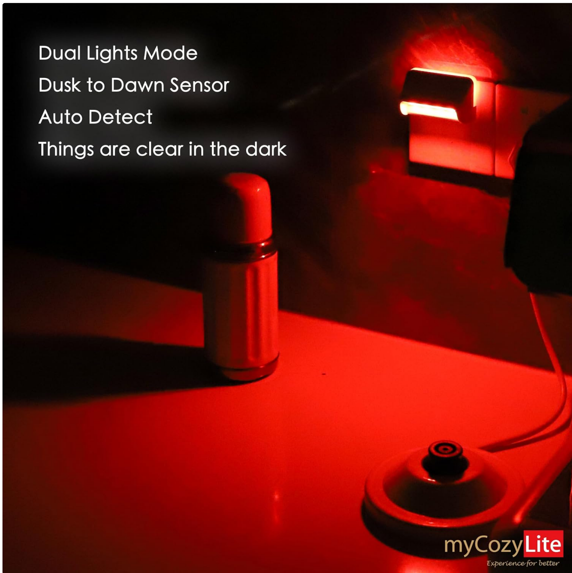
Image: The night light in 'Dual Light Mode', providing sufficient red light to clearly see objects in a dark environment.

Dual Lights Mode Dusk to Dawn Sensor Auto Detect Things are clear in the dark