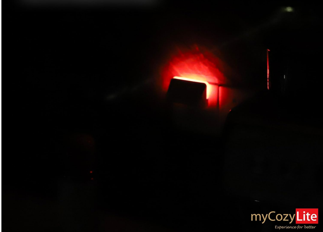
Image: The night light in 'Night Light Mode', emitting a very soft red backlight that does not disturb sleep.

Night Light mode Auto Detect Soft Backlight Does not disturb the sleep