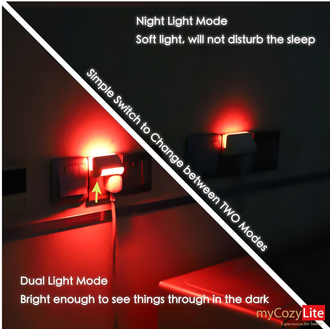
Image: A visual comparison of the night light operating in 'Night Light Mode' (softer glow) and 'Dual Light Mode' (brighter glow), with an arrow indicating the mode selection switch.

turned off. This provides a very gentle, soothing glow that is ideal for bedrooms or nurseries, as it is designed not to disturb sleep.