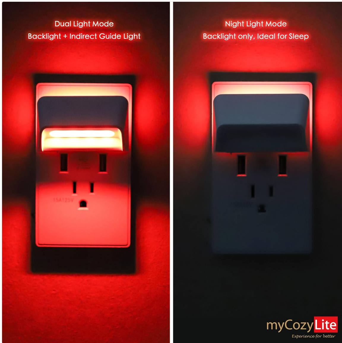
Image: Two night lights side-by-side, illustrating the difference between 'Dual Light Mode' (showing both backlight and indirect light) and 'Night Light Mode' (showing only the backlight).