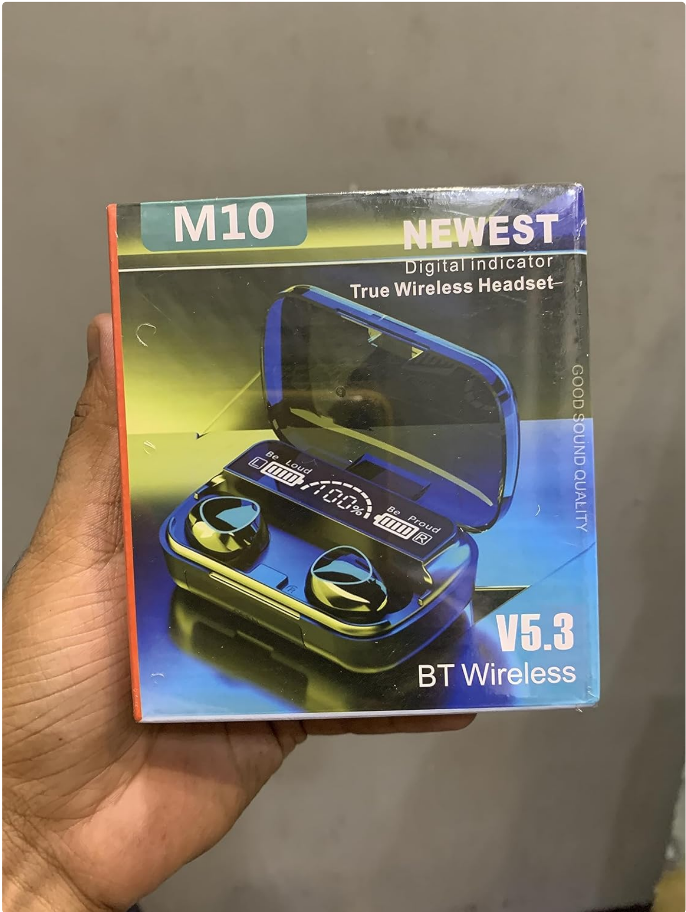
The retail packaging for the M10 TWS Bluetooth Headset, indicating "NEWEST Digital indicator True Wireless Headset V5.3 BT Wireless" on the box.