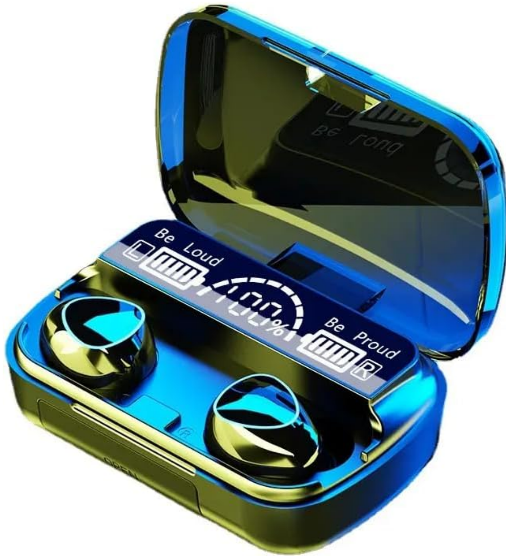
The Andron M10 Wireless Earbuds are shown inside their open charging case. The case features a smart LED display indicating battery levels for both the case and individual earbuds, providing clear visual feedback on power status.