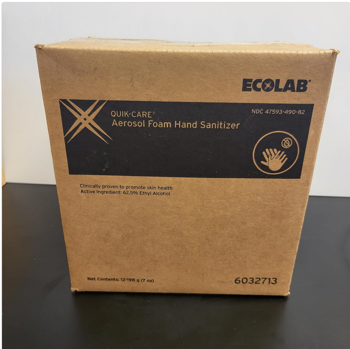
Figure 3: A case containing multiple units of Ecolab Quik-Care Foam Aerosol Hand Sanitizer.