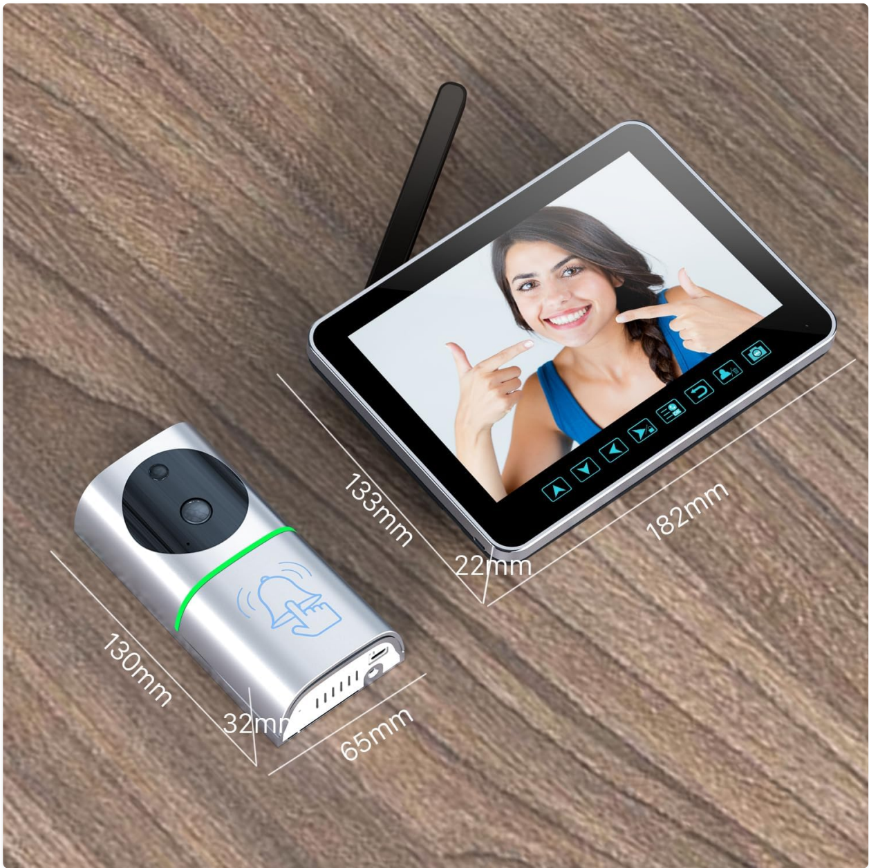
Dimensions of the outdoor unit and indoor monitor.