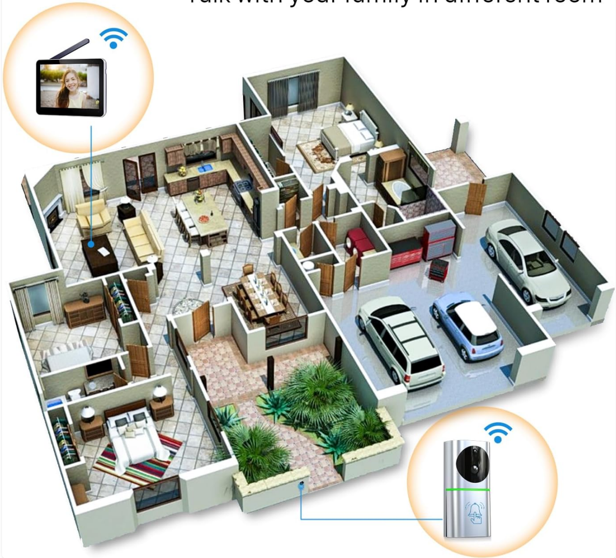
Diagram illustrating how multiple indoor monitors can be used for intercom conversations within the home.