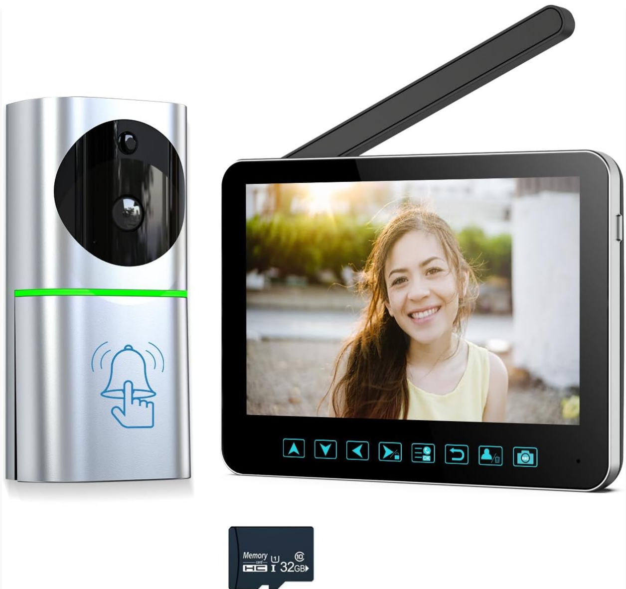
Main components of the SIMBAILAI doorbell system: outdoor unit, indoor monitor, and a 32GB memory card.