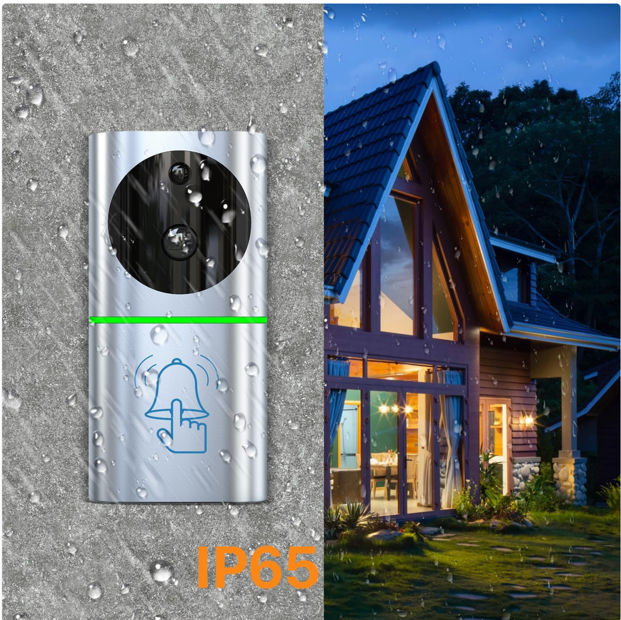
The outdoor unit is IP65 rated, suitable for outdoor use in various weather conditions.