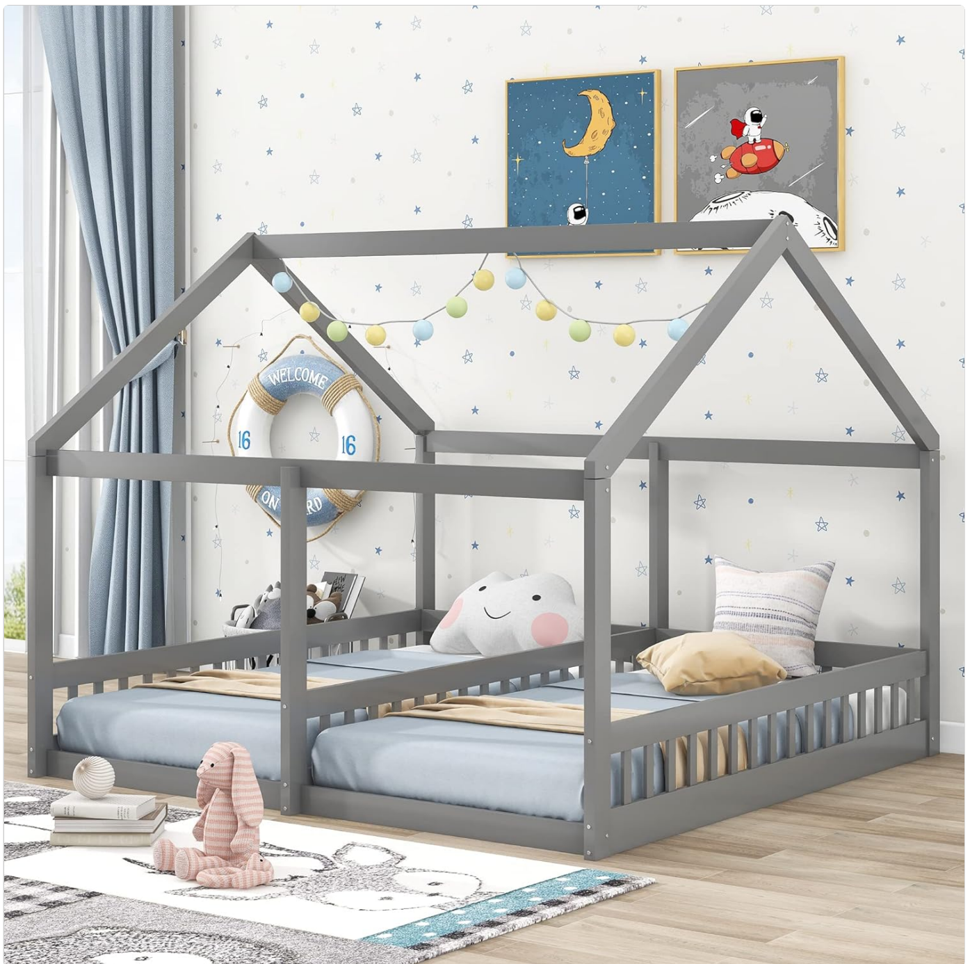
Figure 1: Assembled Merax Twin & Twin House Beds in Grey.