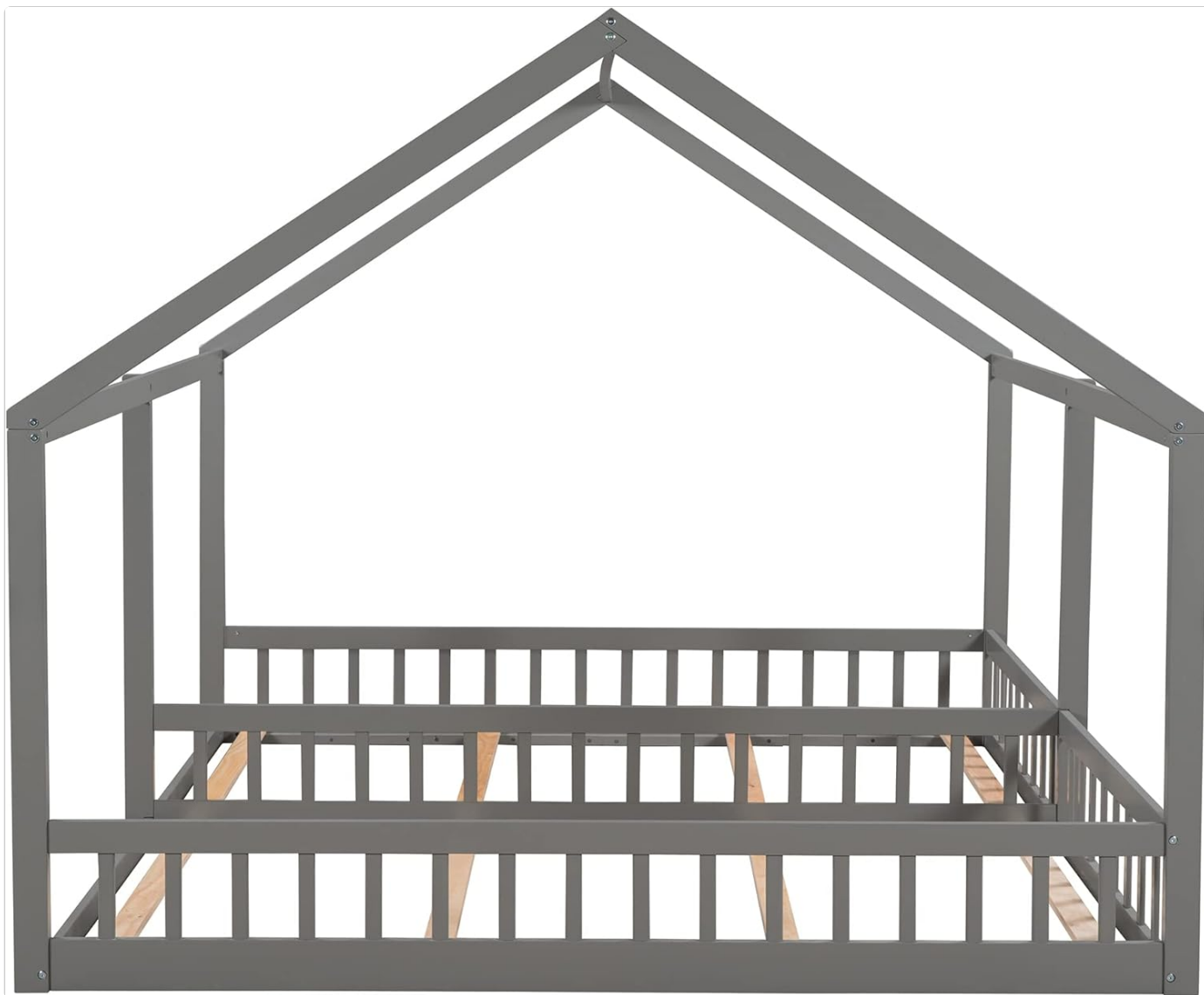
Figure 3: Angled view of the bed frame, illustrating the dual bed design.