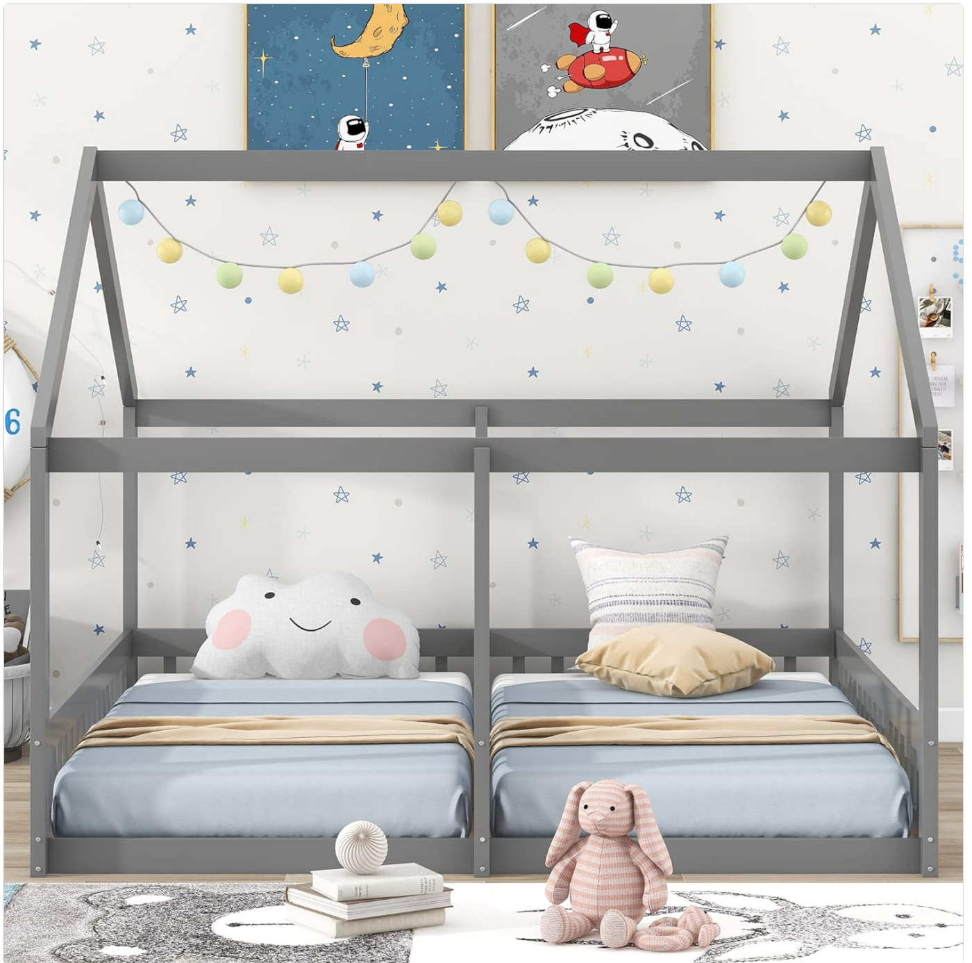
Figure 2: Structural view of the bed frame, highlighting key components.