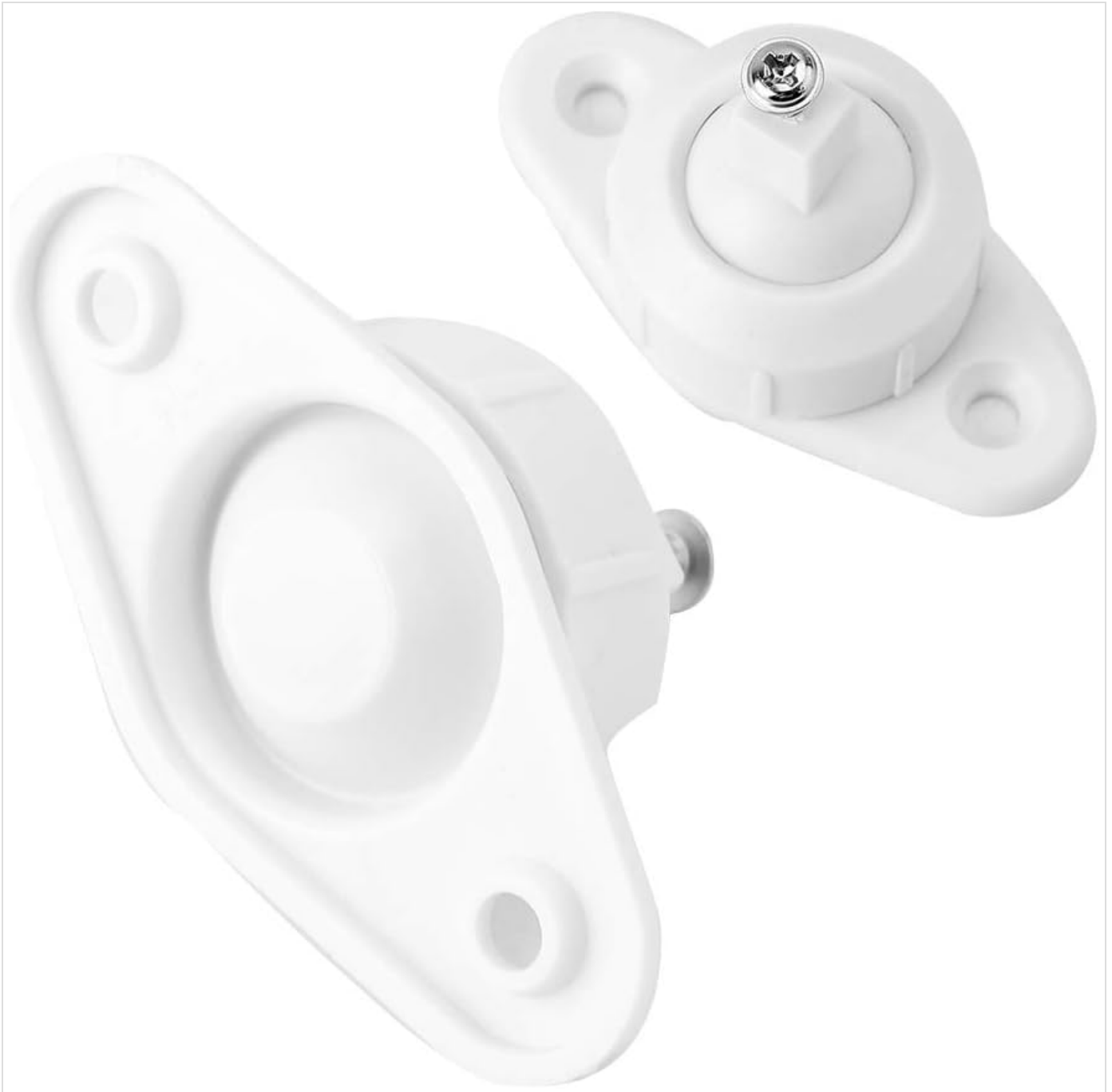
Image 3.1: Illustration of the bracket's base with mounting holes, ready for wall attachment.