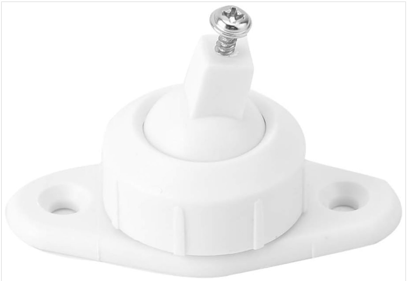
Image 1.1: Front view of the Yinling Bracket Holder, showing the adjustable ball joint and mounting base.