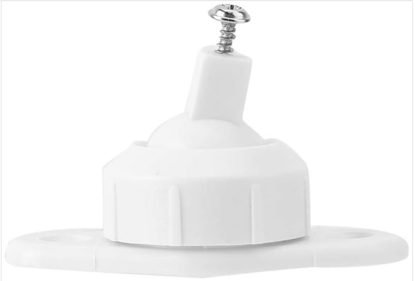
Image 4.1: Side view demonstrating the adjustable nature of the bracket's ball joint.