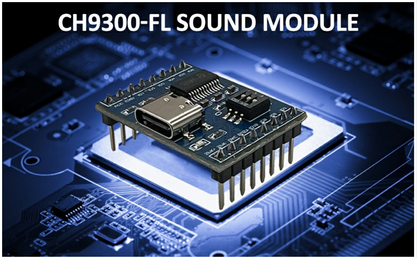
Figure 2: Detailed view of the CH9300-FL Sound Module, showing its USB-C port and pin headers.