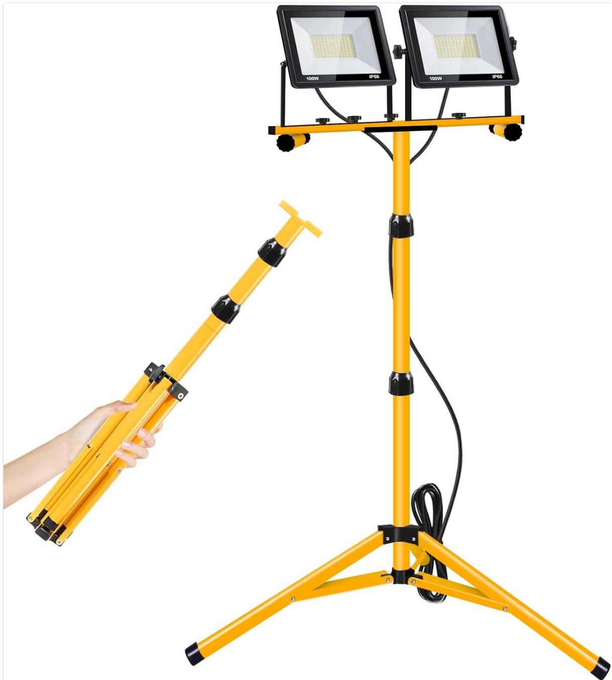
Image 1.1: Yurnomy 2-Head LED Work Light with Tripod Stand, illustrating the assembled unit and the compact, folded tripod for portability.