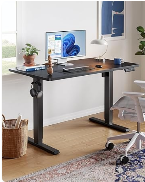
Image 3.1: The control panel for height adjustment, featuring memory presets and up/down controls.