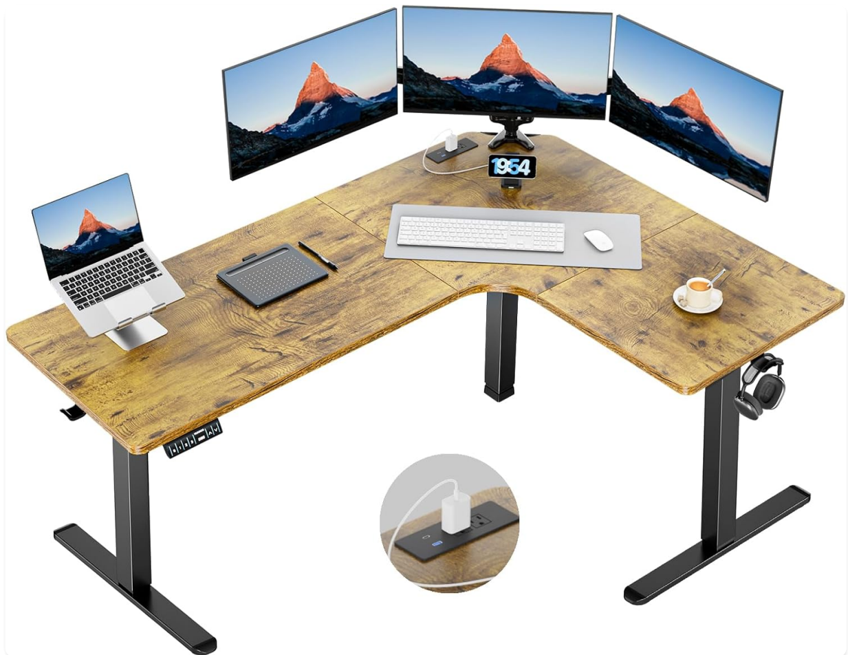
Image 1.1: The HUANUO 63-inch L-Shaped Electric Standing Desk configured for a multi-monitor setup, showcasing its spacious design and integrated features.

The HUANUO 63-inch Dual Motor L-Shaped Electric Standing Desk is designed to provide a versatile and ergonomic workspace. This desk allows users to easily switch between sitting and standing positions, promoting better posture and productivity. It features a robust dual-motor system for smooth height adjustments, integrated power outlets for convenience, and effective cable management solutions.