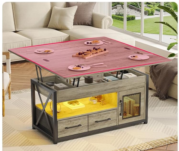
Two Way Lift Top Coffee Table