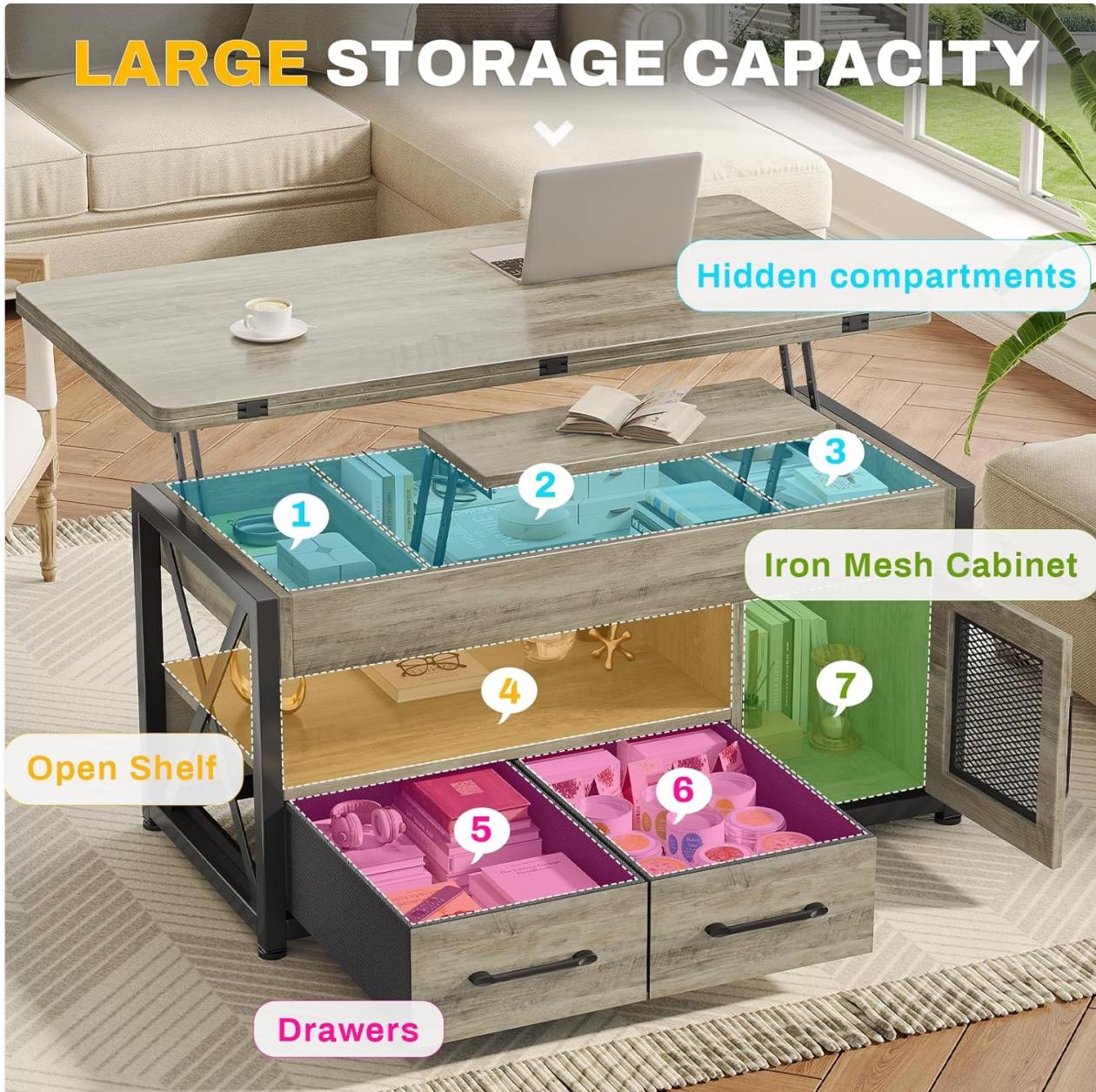
Image: An overhead view detailing the various storage options available within the coffee table, including hidden and accessible compartments.