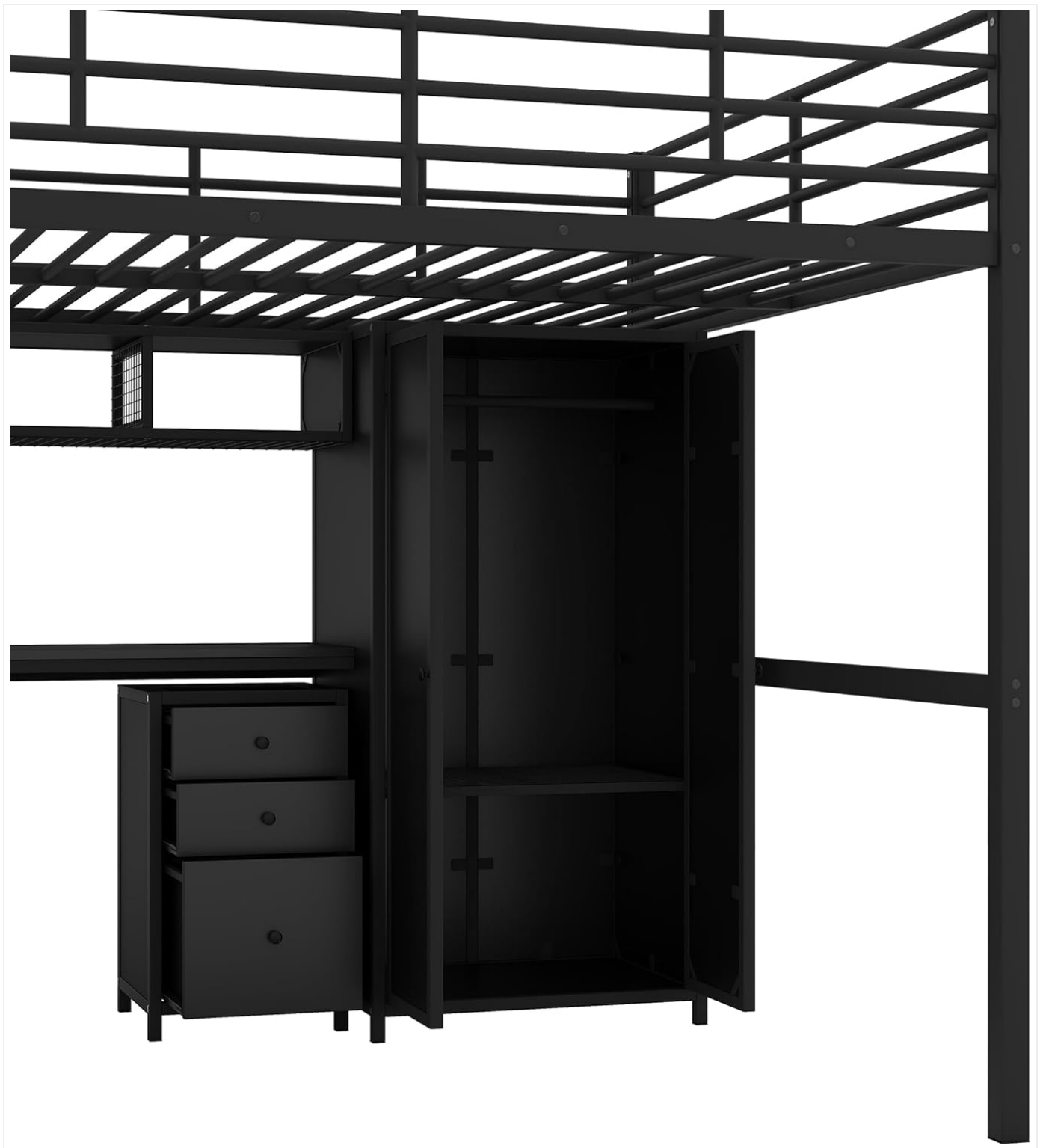
Image: View of the integrated wardrobe and the three drawers of the computer desk, located beneath the loft bed.