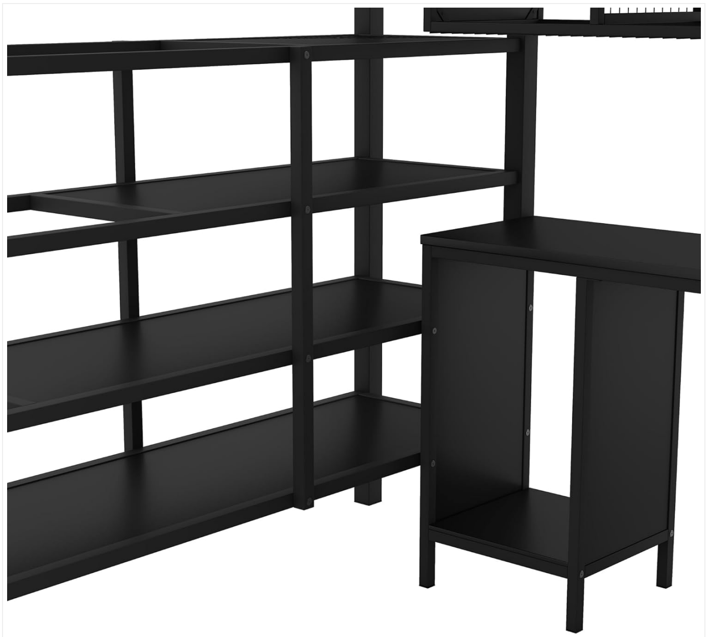
Image: Detailed view of the integrated stairway, showing the multiple storage shelves beneath each step.