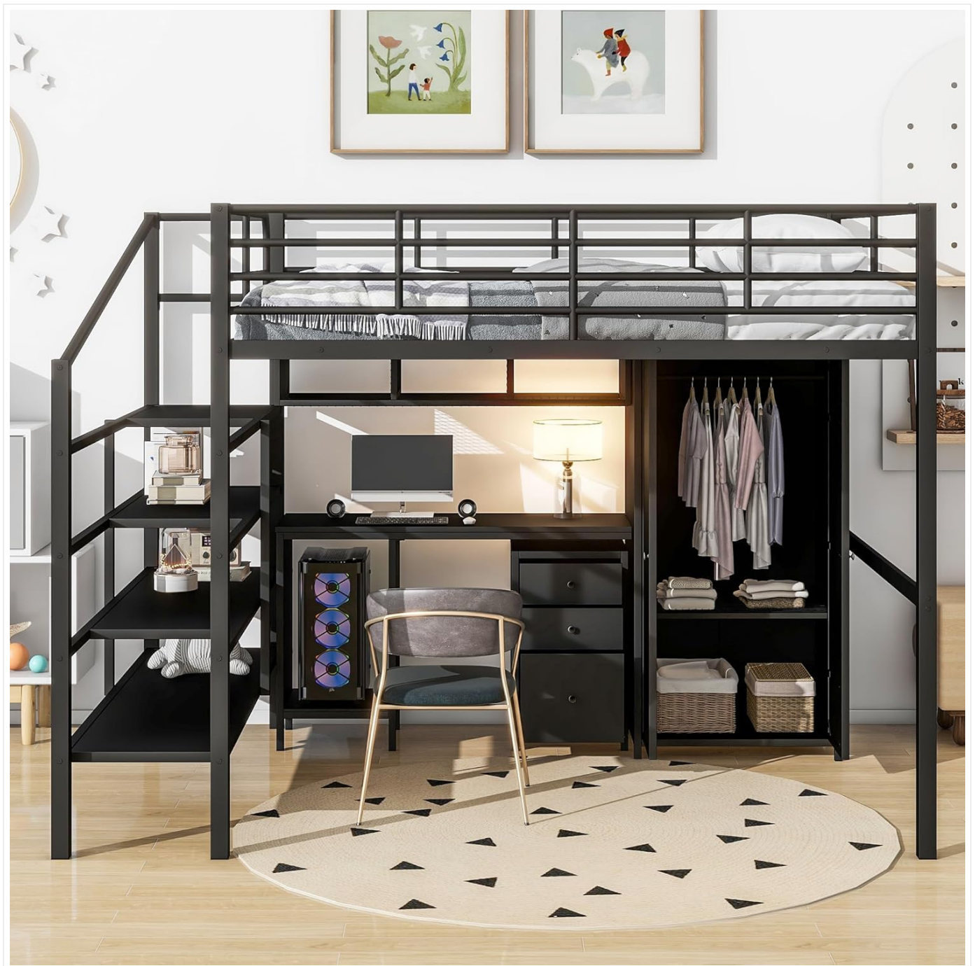
Image: Overview of the Linique Full Size Metal Loft Bed, showcasing the integrated wardrobe, storage stairway, and computer desk.