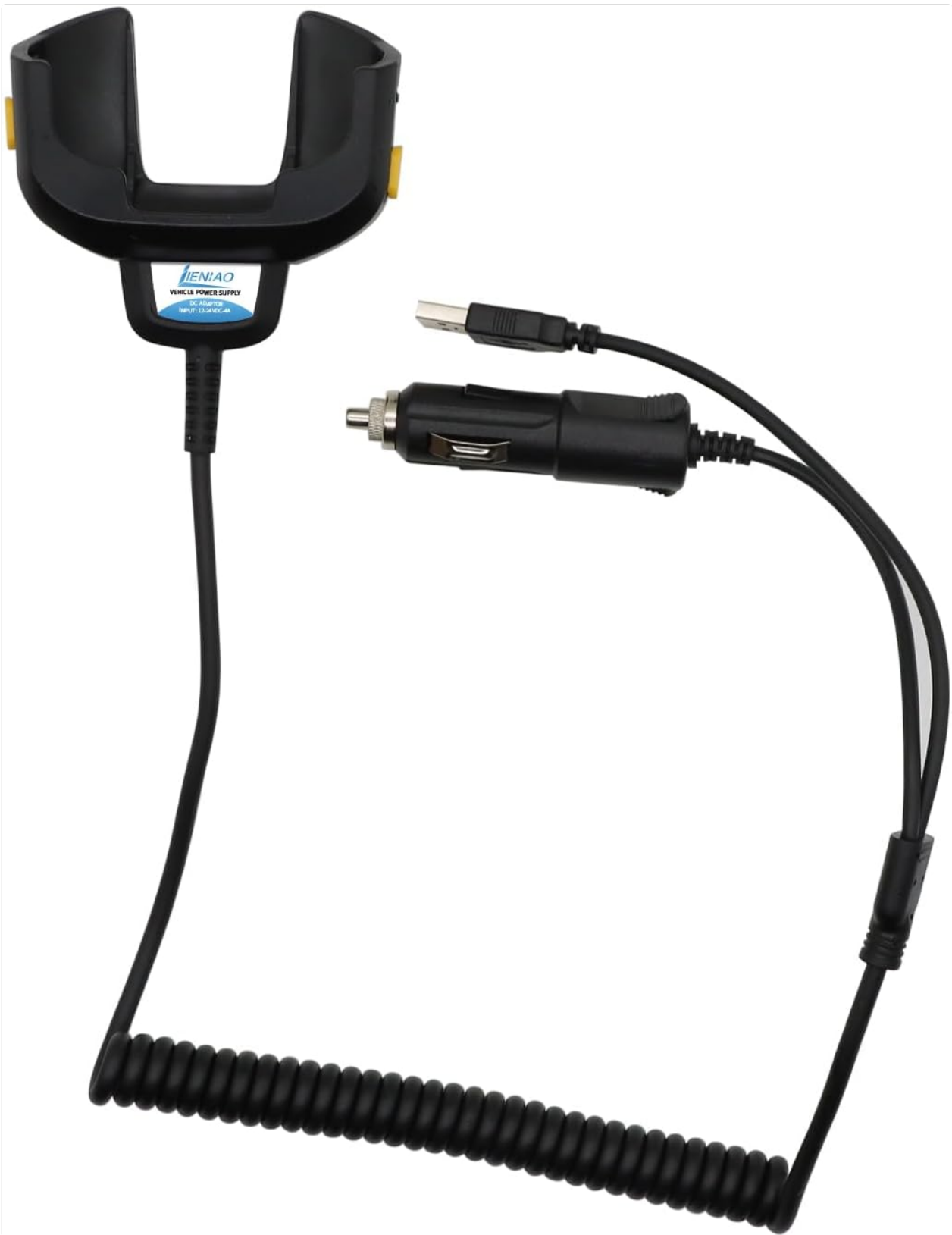
Image 1.1: Overview of the LIENIAO 2-in-1 USB Charger Cable, showing the scanner cradle, coiled cable, USB connector, and car power adapter.