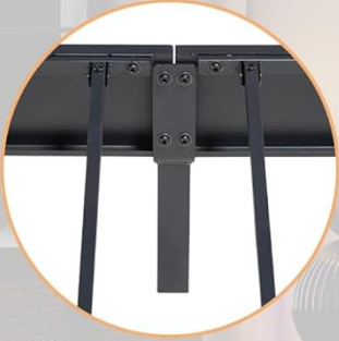
All Metal Design