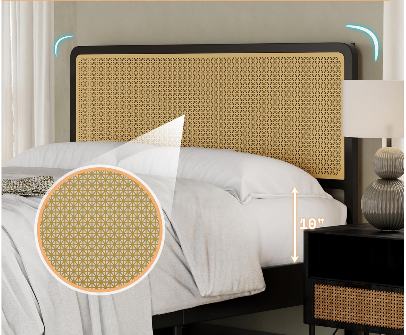
Figure 4: Detail of the Rattan Style Metal Headboard.