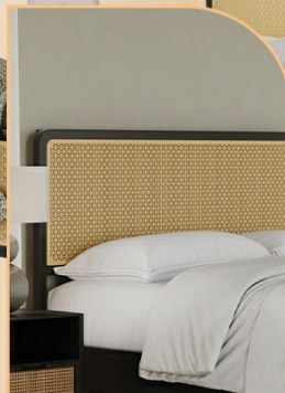
Gold Rattan headboard and footboard