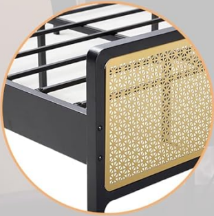
Wide Bed Side