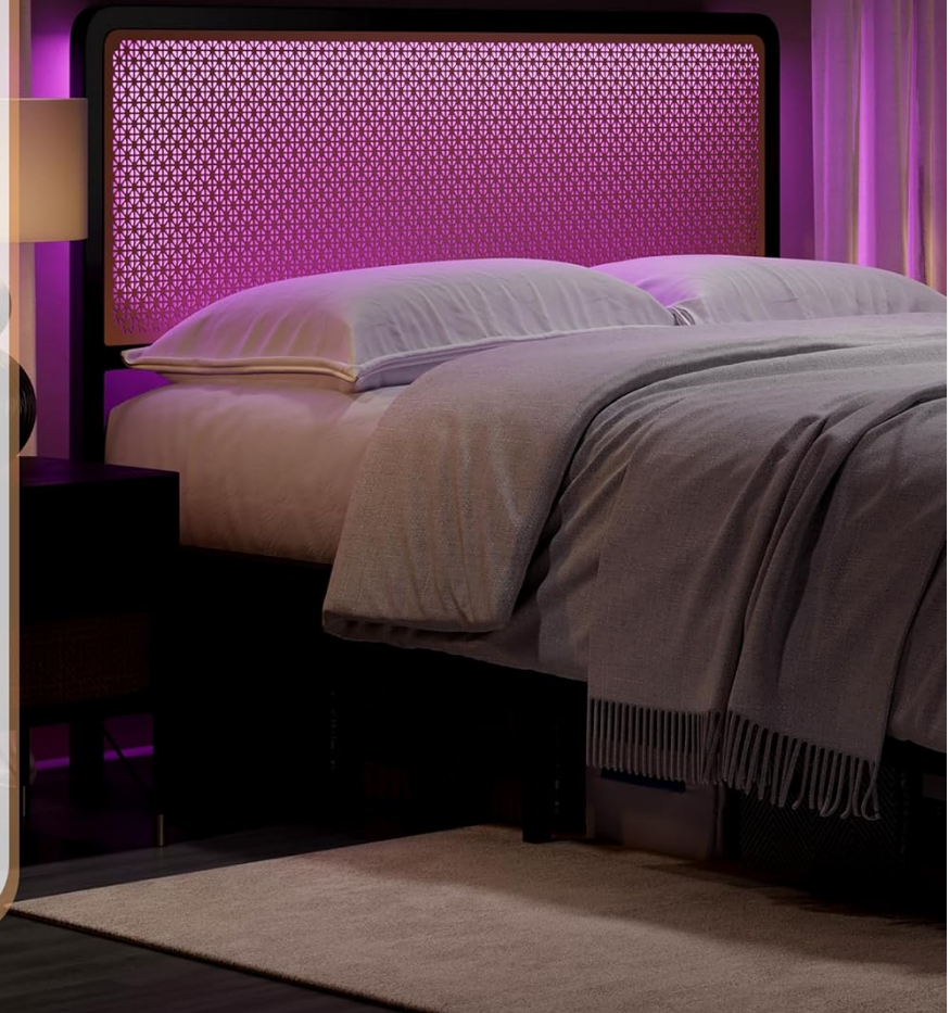
Figure 5: Features of the AMERLIFE Rattan LED Bed Frame.

Video 1: Overview of the AMERLIFE LED Metal Rattan Bed, demonstrating its features and design.