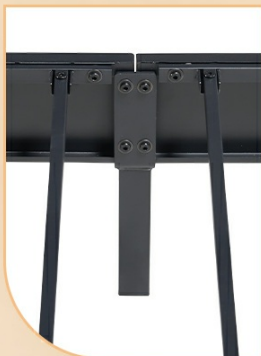
All Metal Design Bed Frame