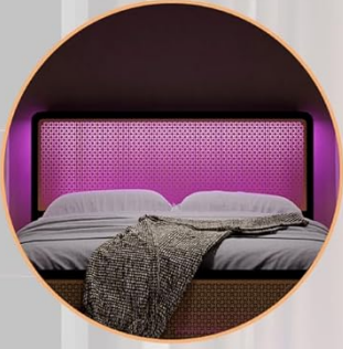
LED Rattan Headboard