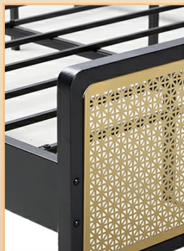
Wider Bed Sides