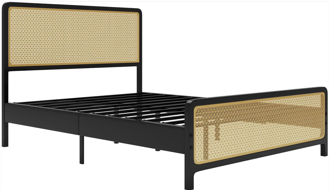
Figure 6: Assembled AMERLIFE Queen Size Bed Frame.