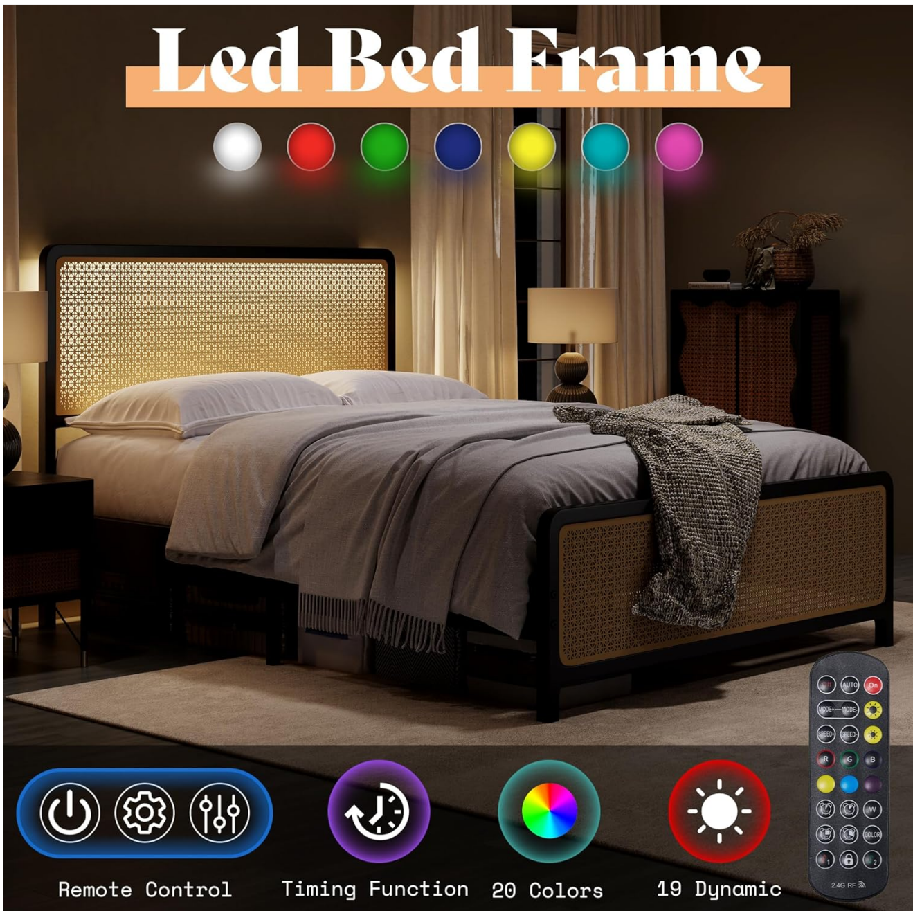
Figure 3: LED Bed Frame with Remote Control.