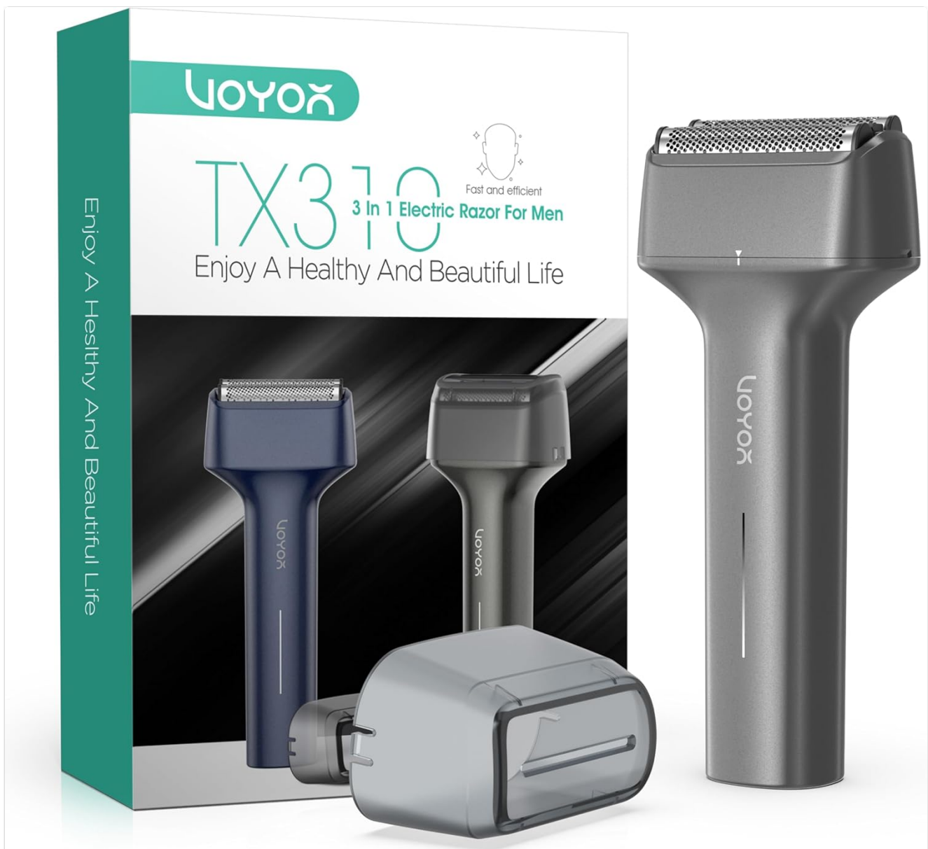
Figure 1: VOYOR TX310 Electric Foil Shaver with its packaging.