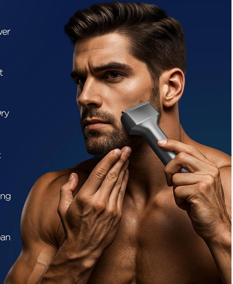
Figure 2: Key features of the VOYOR TX310 Electric Foil Shaver.