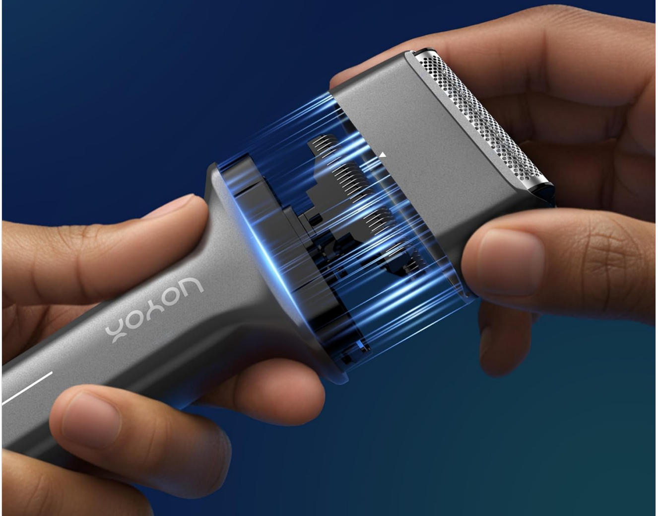
Figure 6: Cleaning the replaceable cutter head.

The blade head is detachable, making it easy to replace and clean