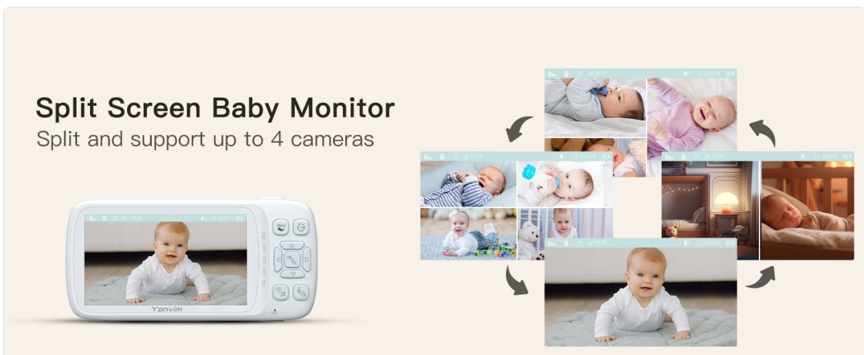
Image 5.8: The parent unit displaying two camera feeds simultaneously, demonstrating the split screen function that supports up to 4 cameras.