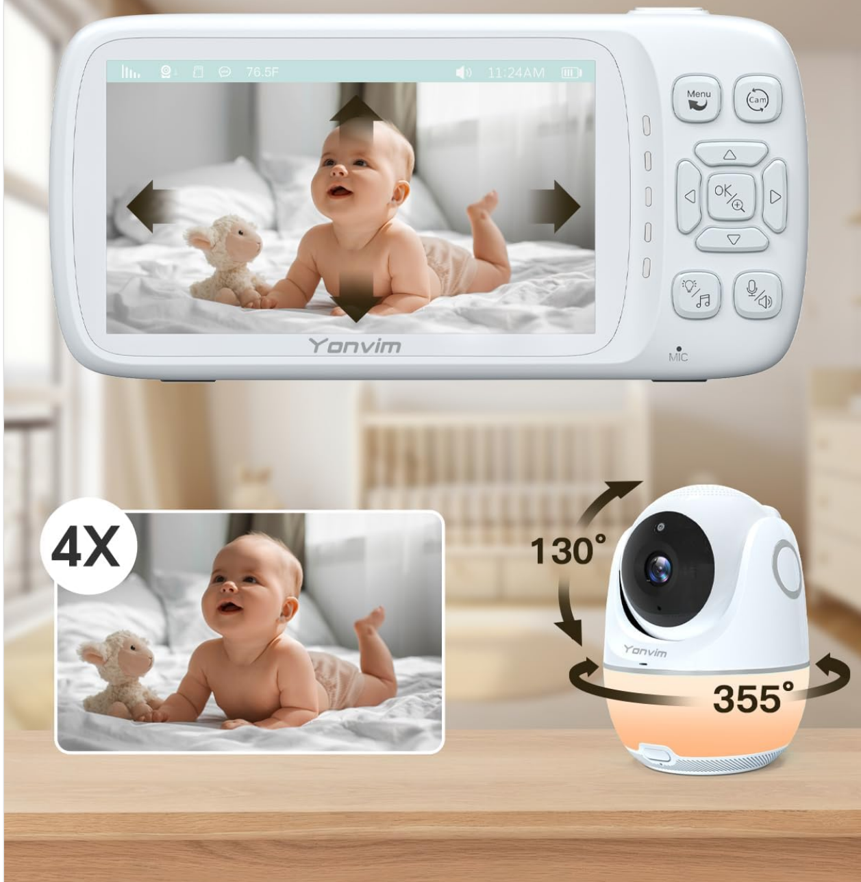
Image 5.1: The parent unit displaying a baby with arrows indicating pan and tilt movement, and a separate image showing the camera unit's 355-degree pan and 130-degree tilt capabilities. Zoom levels (2x, 4x, 10x) are also illustrated.