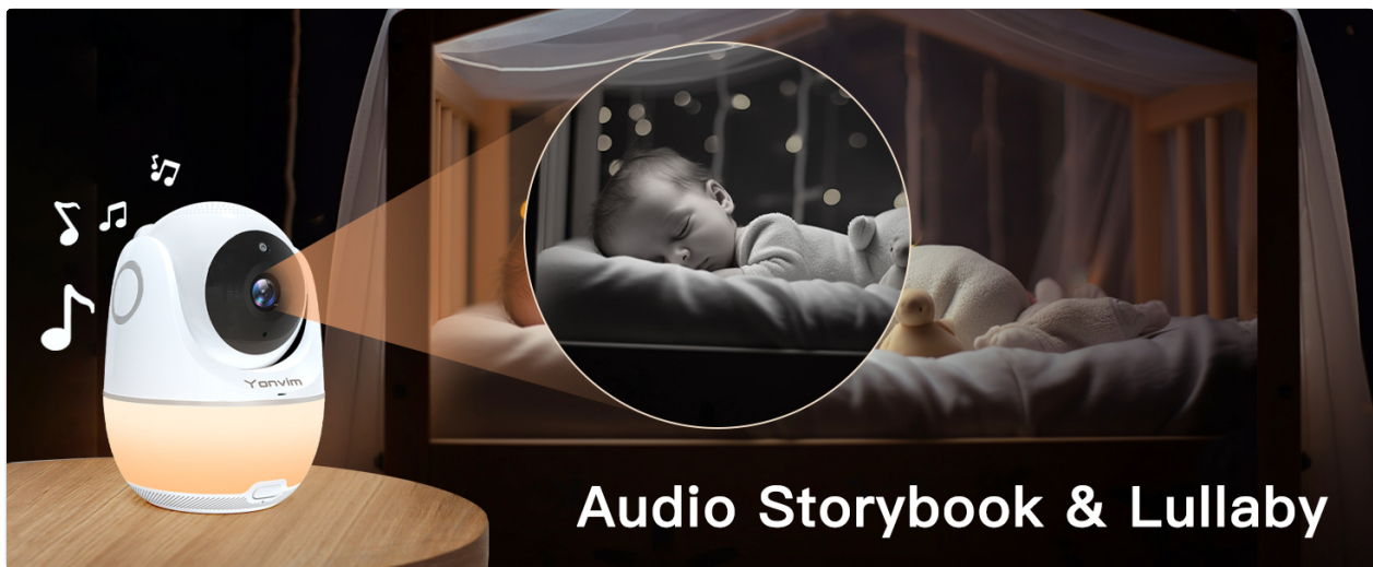
Image 5.7: The baby unit emitting musical notes towards a sleeping baby in a crib, illustrating the audio storybook and lullaby feature.