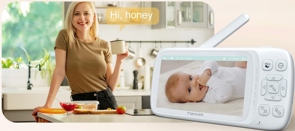
Image 5.2: A parent speaking into the monitor, and a baby in the crib, illustrating the two-way audio feature for real-time communication.