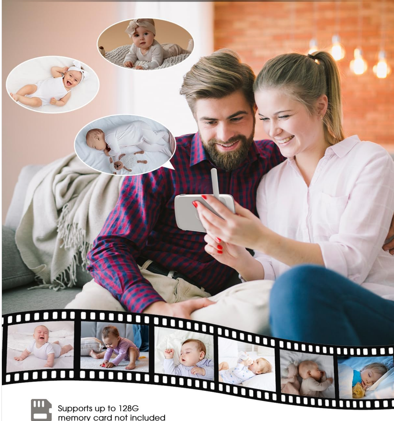
Image 5.6: A couple viewing recorded footage of their baby on the parent unit, with a filmstrip graphic and an SD card icon, highlighting the local recording and playback feature.