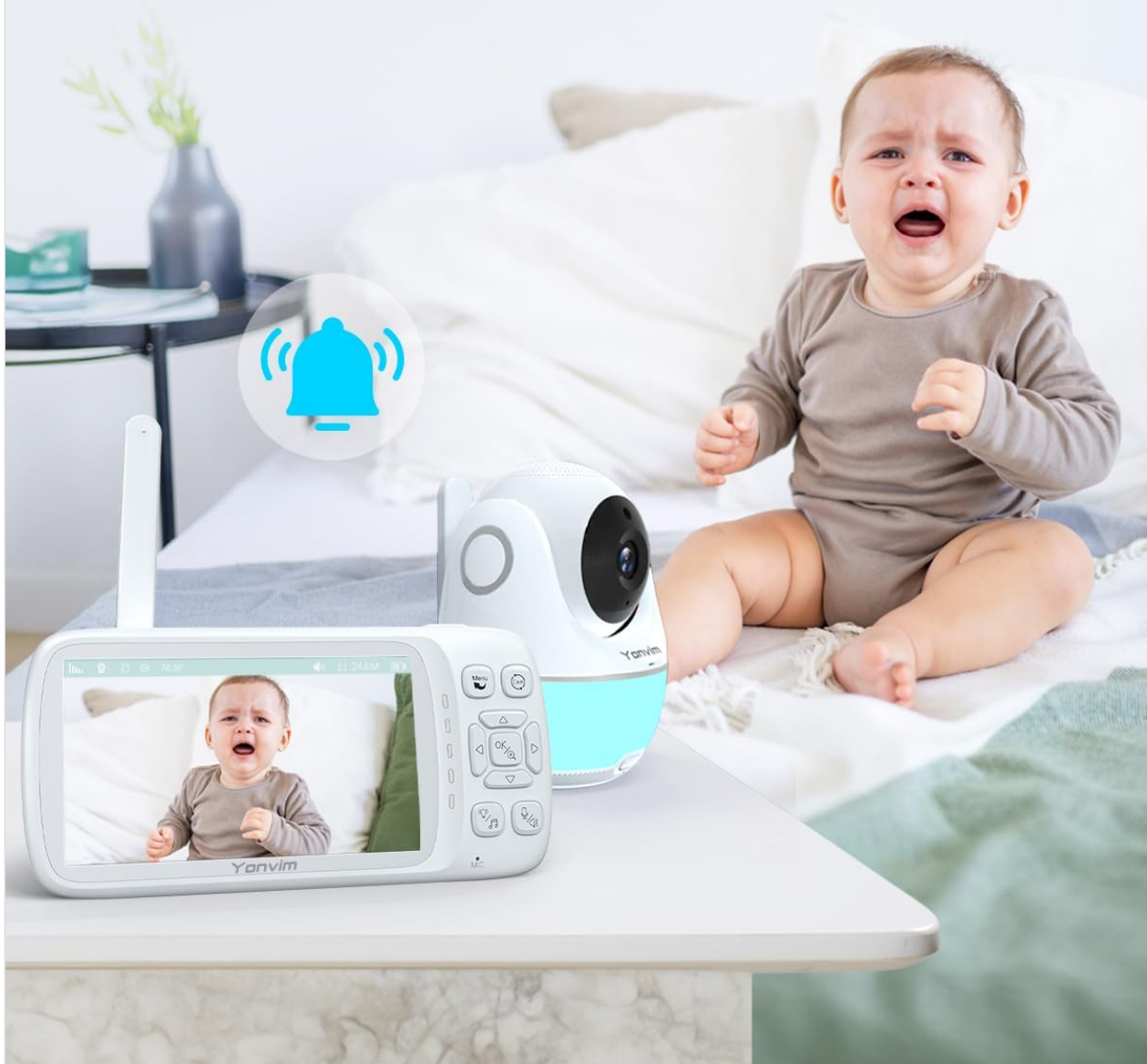
Image 5.5: The parent unit displaying a crying baby, with icons for sound, temperature, and feeding alerts, indicating the monitor's smart alert capabilities.