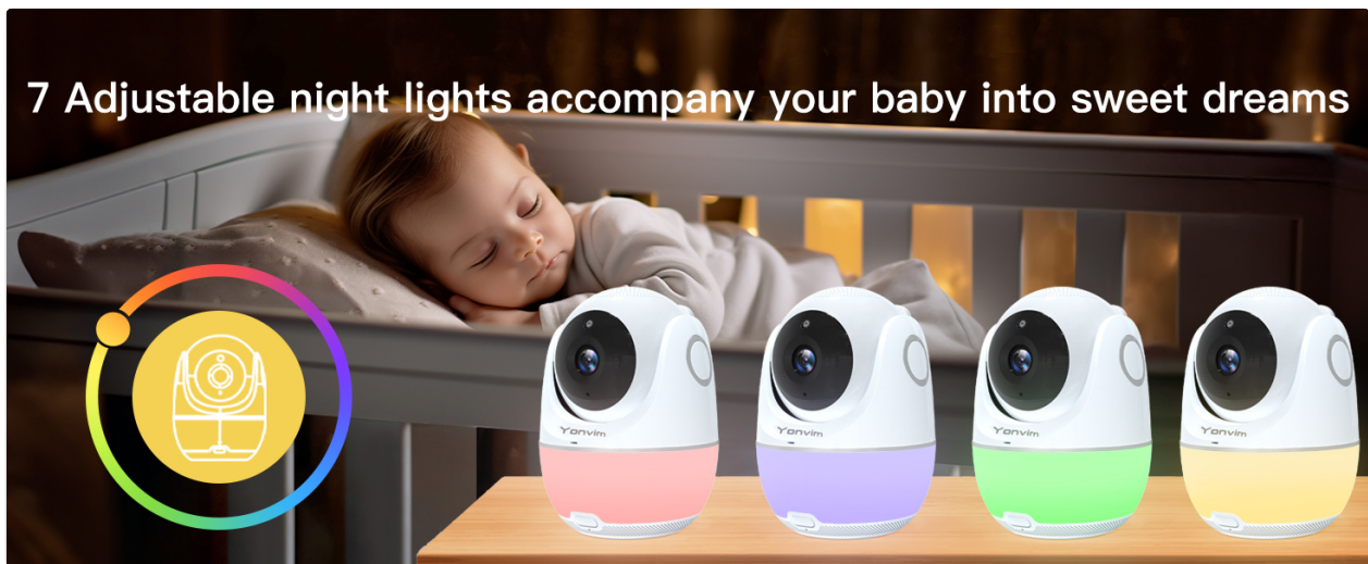
Image 5.4: The baby unit emitting various colors of light, illustrating the 7 adjustable night light options to create a soothing environment.