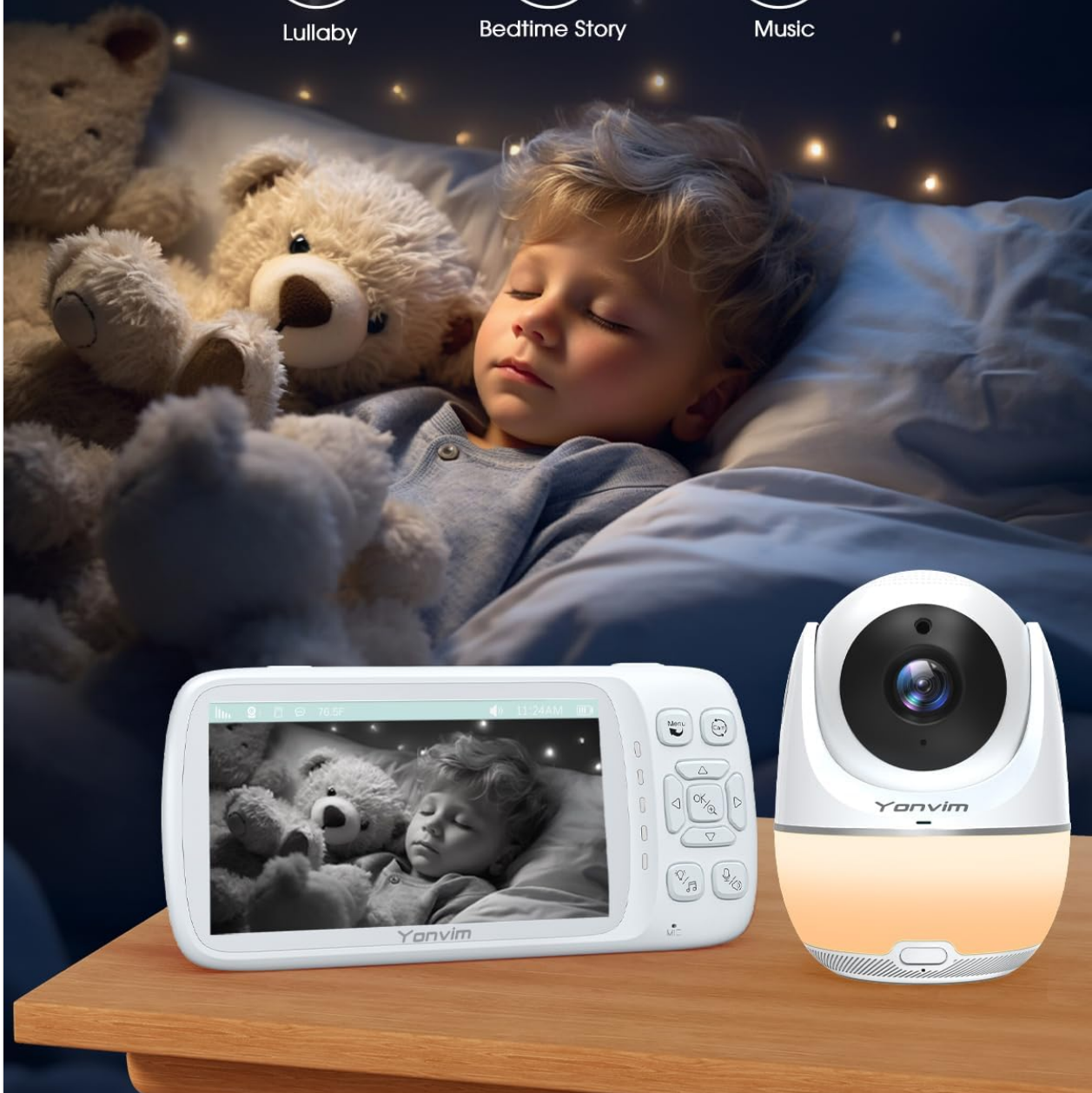
Image 5.3: The parent unit displaying a clear black-and-white image of a sleeping child in a dark room, demonstrating the HD night vision capability.