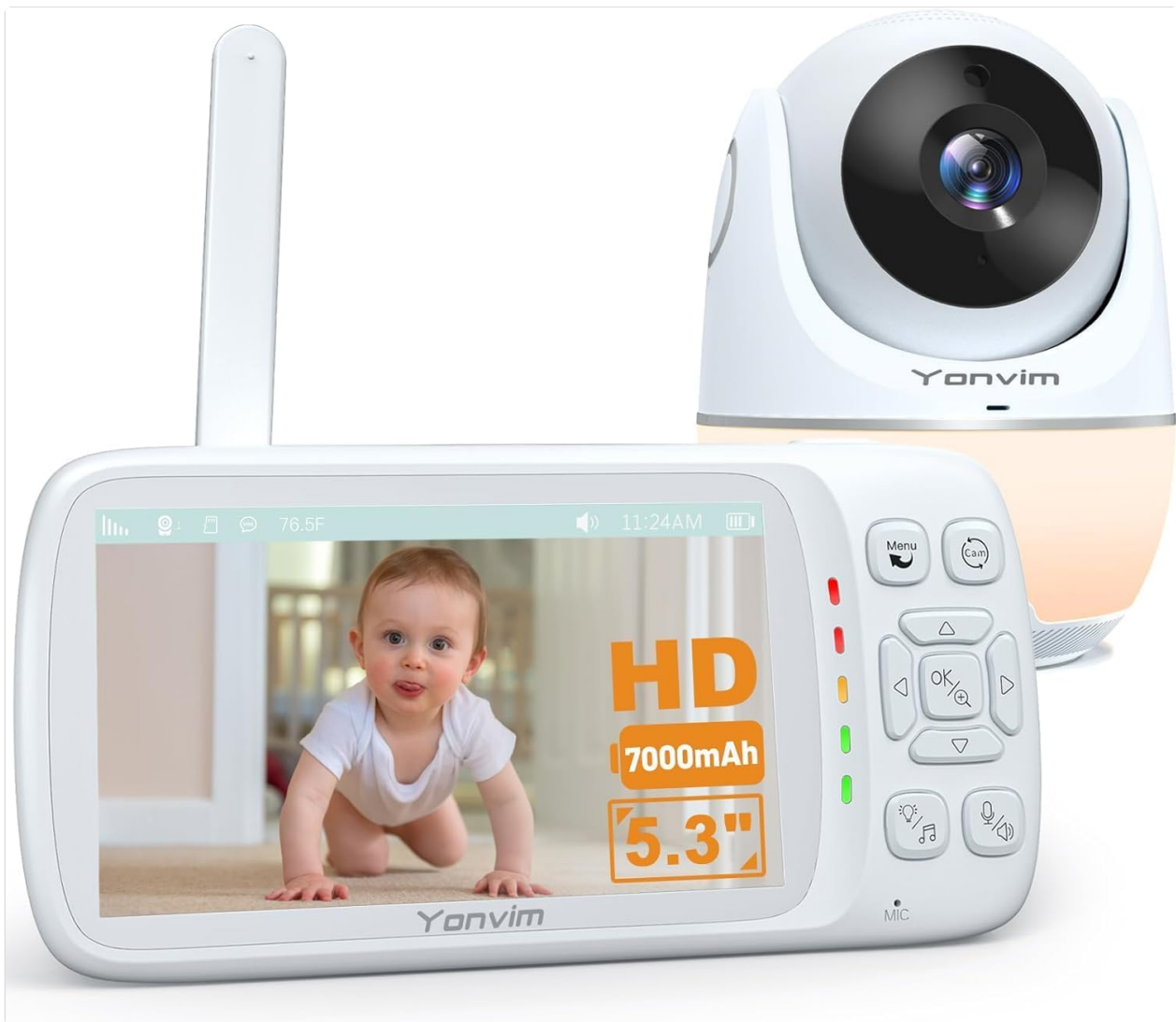
Image 3.1: Yonvim BM07 Baby Monitor Parent Unit and Baby Unit. The parent unit features a 5.3-inch screen and control buttons, while the baby unit is a dome-shaped camera with a night light base.