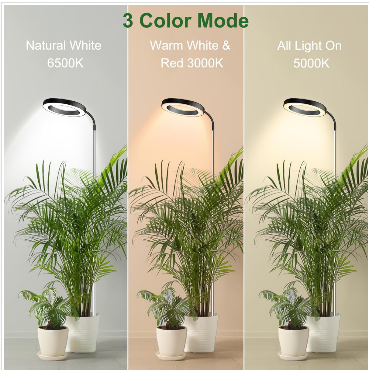
Figure 5.3: The 3 available color modes for different plant needs.