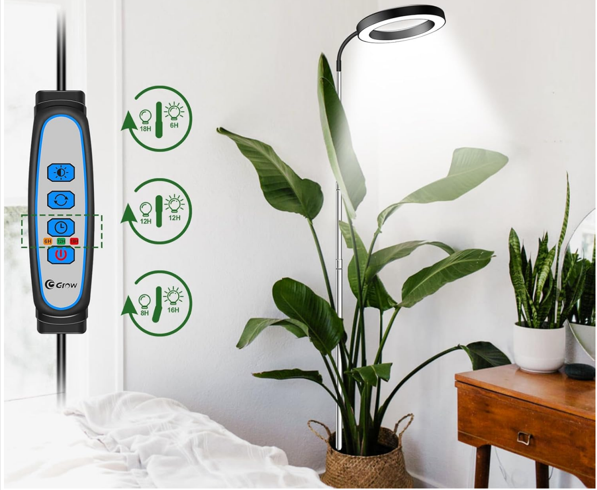
Figure 5.1: In-line controller for the grow light.