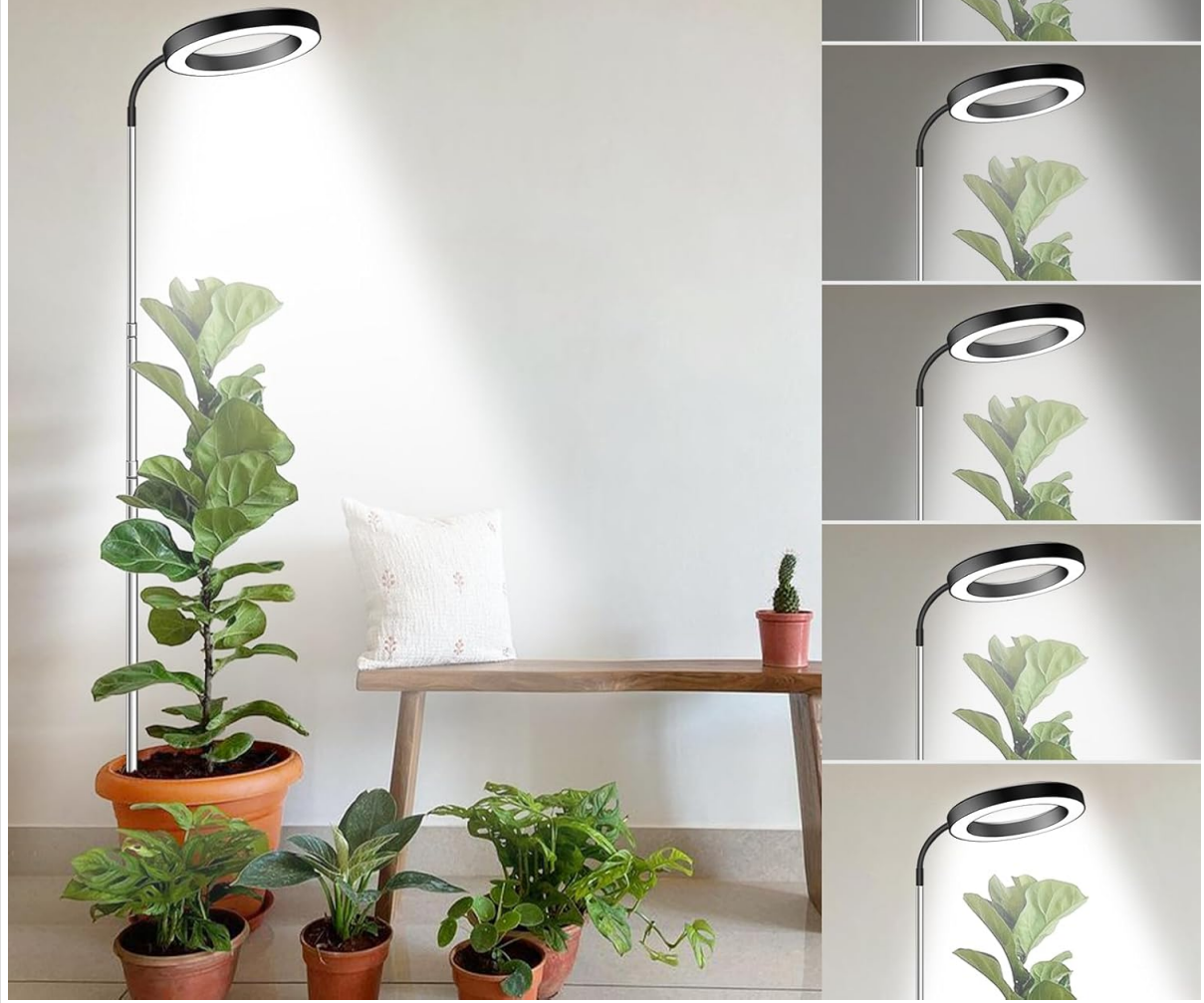
Figure 5.2: Visual representation of 5 dimmable brightness levels.