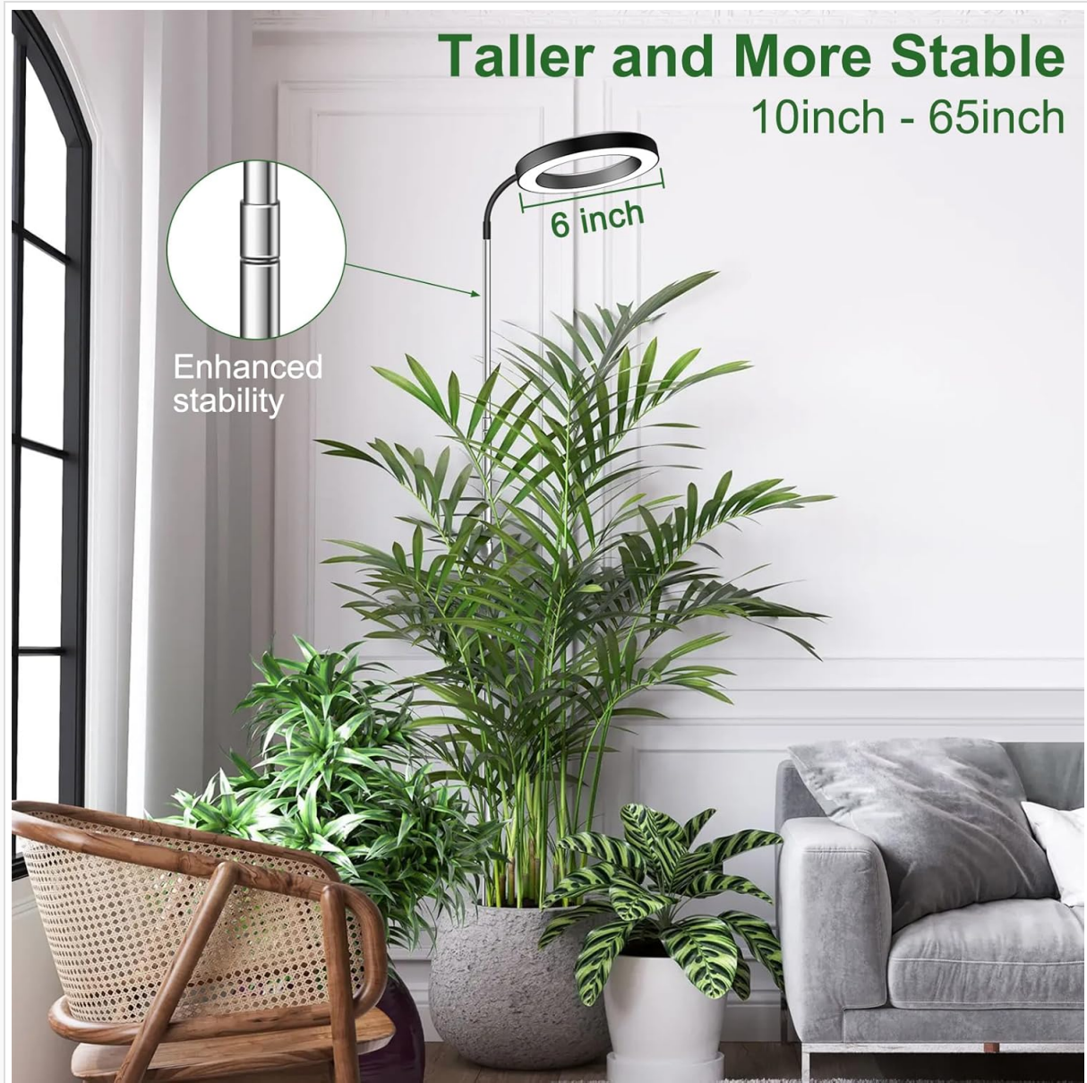
Figure 4.1: Adjusting the height of the grow light pole.