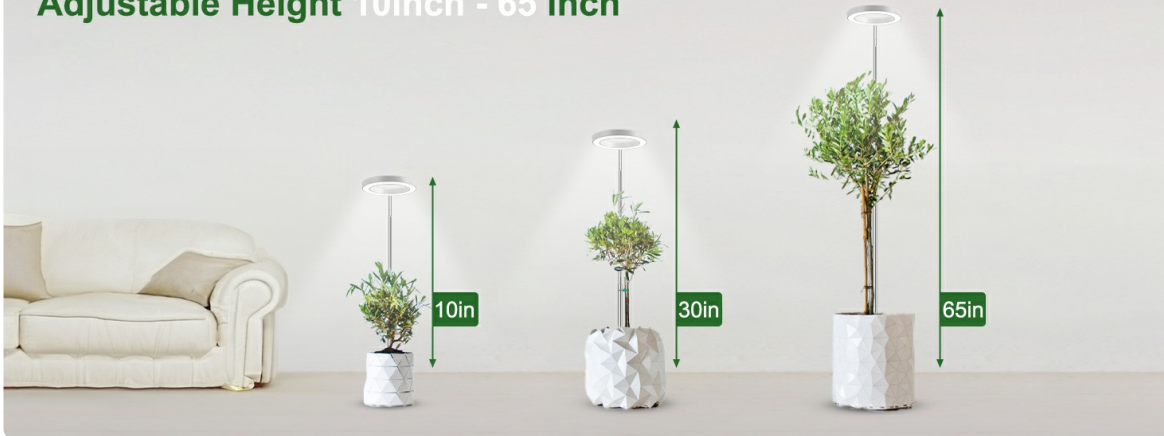
Image: Demonstrates the adjustable height feature of the grow light, accommodating plants from 10 to 65 inches tall.

Your browser does not support the video tag.