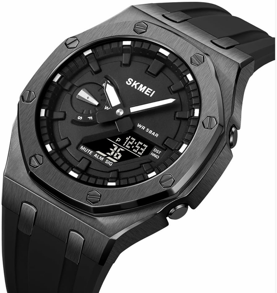
Image: Angled view of the watch highlighting the four control buttons on the sides of the case.