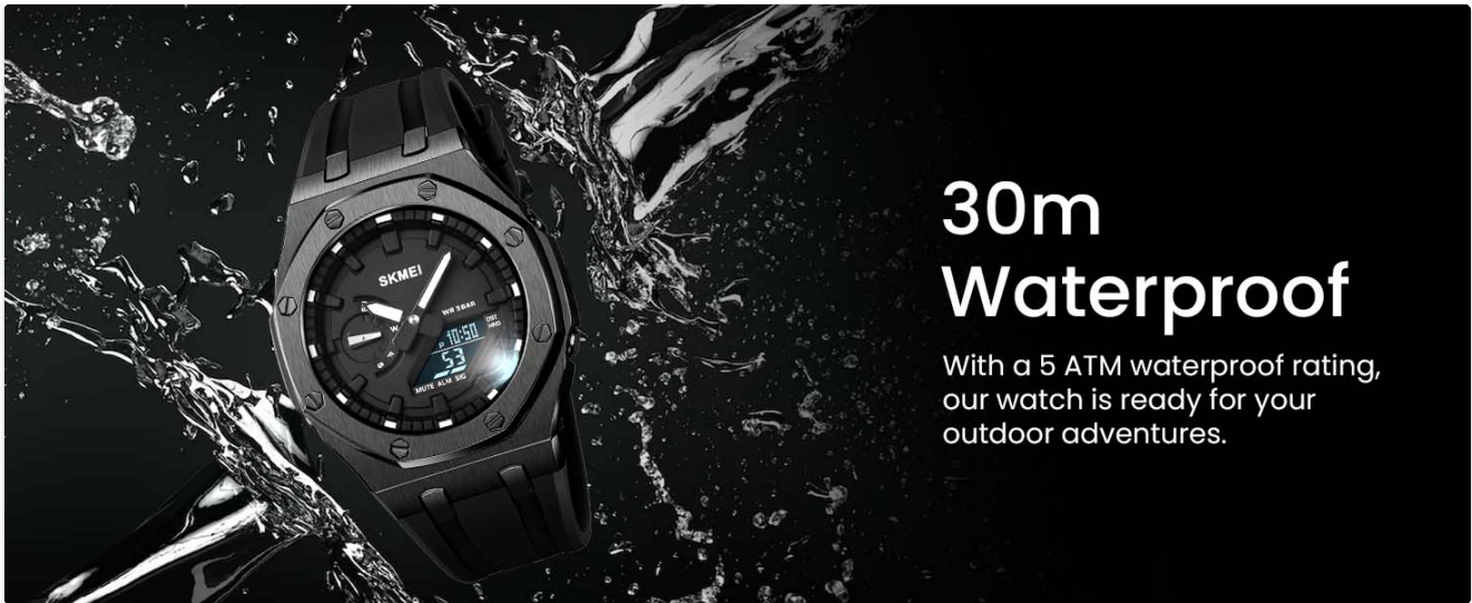
Image: The watch partially submerged in water, demonstrating its 50M water resistance capability.