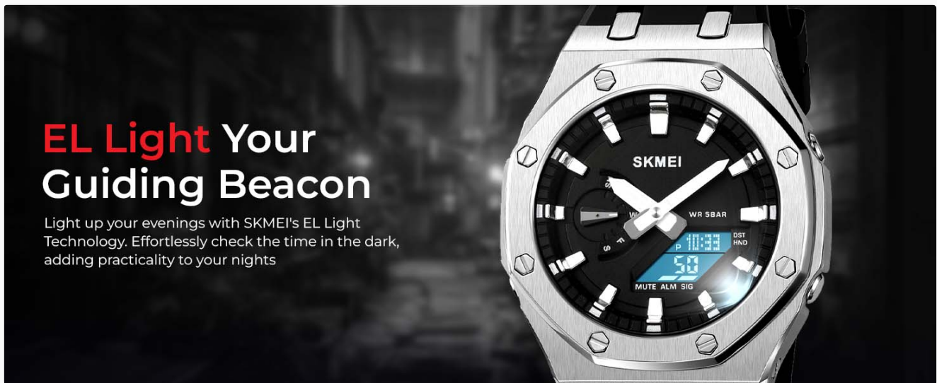
Image: The watch display illuminated by the EL backlight, showing clear visibility in the dark.

Press the Light Button (Top Left) to illuminate the digital display for a few seconds in low-light conditions.