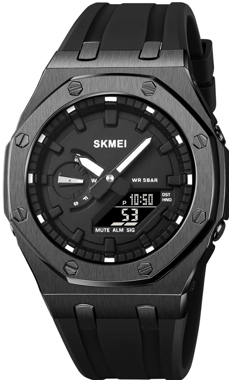
Image: Front view of the SKMEI Digital Sports Watch Model 2243, showcasing its analog and digital display.