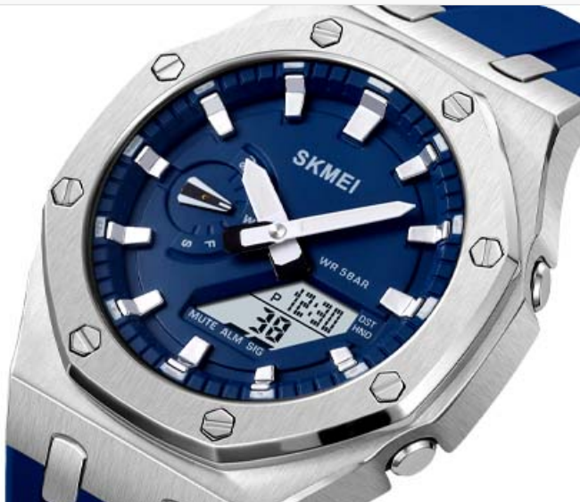
Image: Close-up of the watch face, emphasizing the scratch-proof hardness glass for clarity and protection.

Scratch-proof Hardness Glass Clarity and Protection