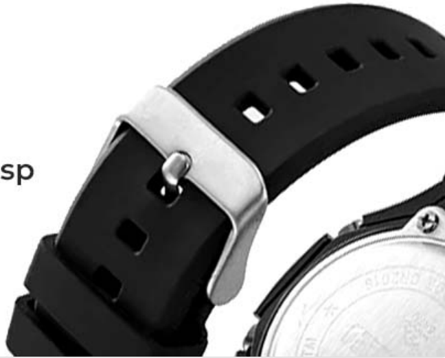
Image: Close-up of the watch's secure and comfortable clasp mechanism.