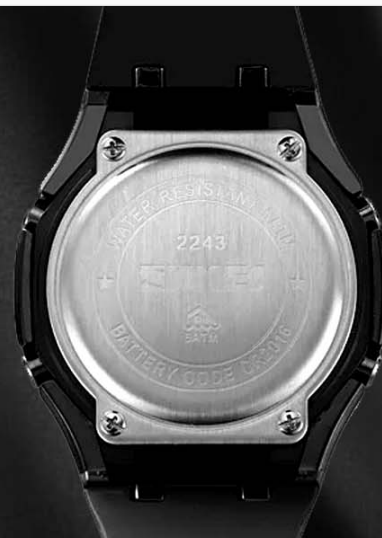
Image: Detailed view of the watch's stainless steel back cover, emphasizing its quality and construction.

The stainless steel back cover showcases the attention to detail and quality we put into every aspect of our watch.