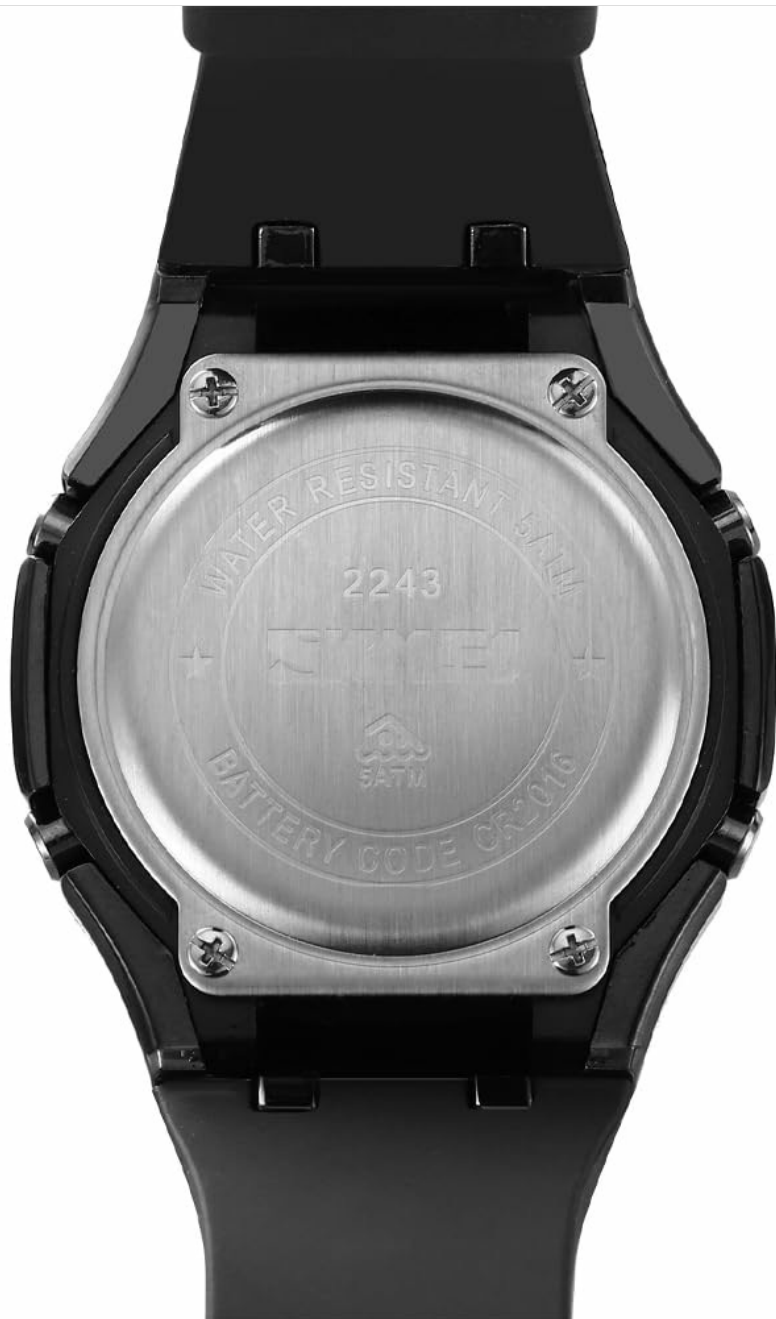
Image: The stainless steel back cover of the watch, indicating the battery code and water resistance rating.