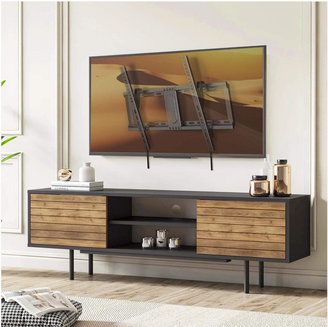
Figure 5: Tilt for Anti-Glare. This image illustrates the tilting capability of the mount, allowing the TV to be angled downwards from 0 to 8 degrees to minimize glare and improve viewing comfort.