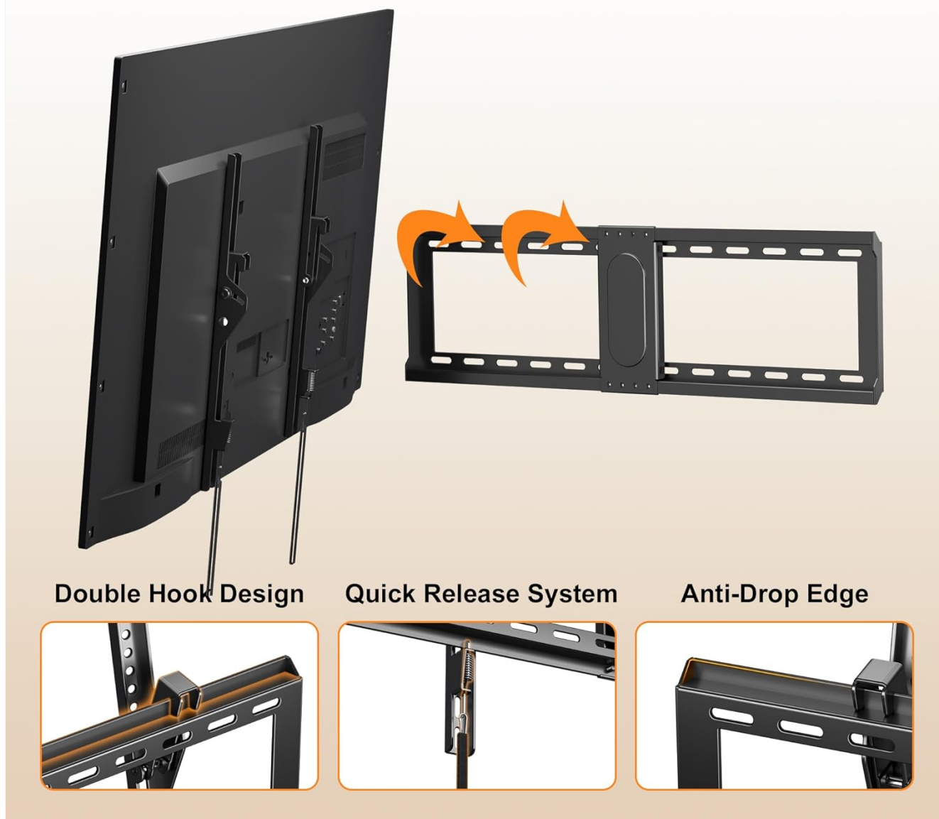
Figure 3: Safety Features. This image details the safety mechanisms of the mount, including a double hook design for secure attachment, a quick release system for easy removal, and an anti-drop edge to prevent the TV from falling.