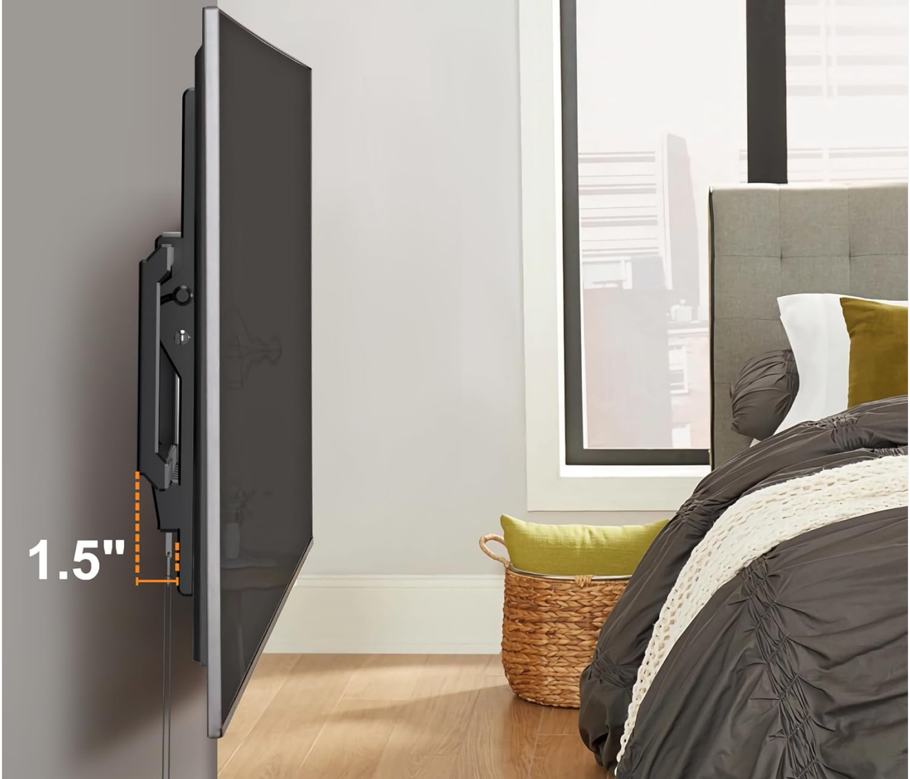
Figure 4: Low Profile Design. This image demonstrates how close the TV sits to the wall (1.5 inches or 3.81 cm) once mounted, providing a sleek and space-saving appearance.