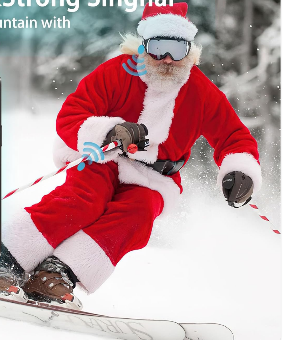
Connecting the Kalence T10 speakers to a smartphone via Bluetooth.