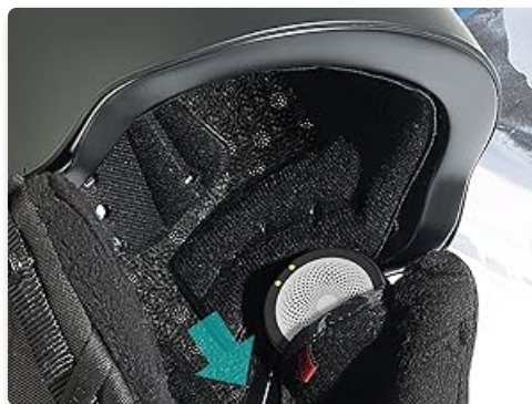
Inserting the speaker into the helmet's ear pad slot.