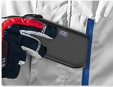
Charging case displaying full charge.