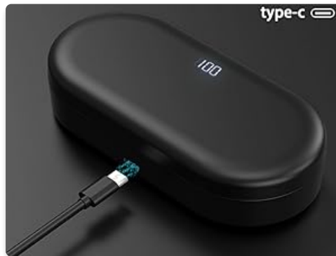
Connecting the USB-C charging cable.