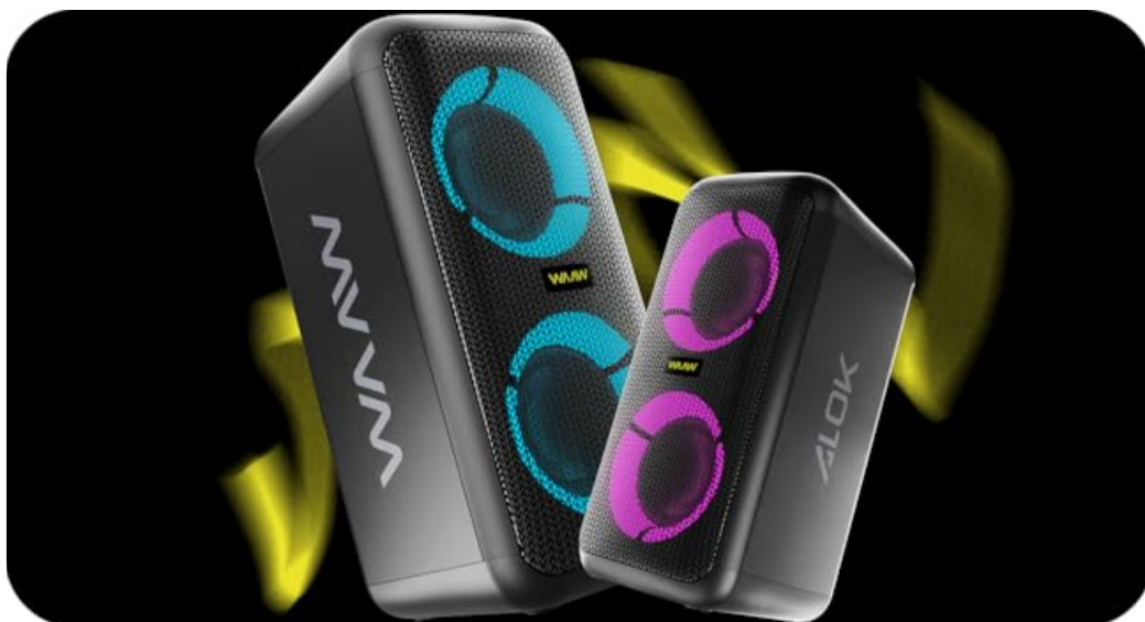
Image: Diagram showing how two INFINITE 200 speakers connect wirelessly using TWS technology.