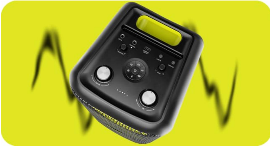
Image: Overview of key features including TWS, battery life, power, LED show, speaker configuration, Bluetooth version, and Power Bass.