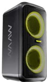
Image: Visual representation of the speaker's dimensions.