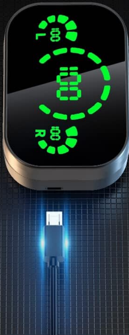
Image: The charging case of the VOLT PLUS TECH Pro Wireless Earbuds YD03 connected to a USB-C charging cable, illustrating the charging process.

Improve charging time, fast life, greatly enhance the service life of the charging module, charge more quickly and safely.