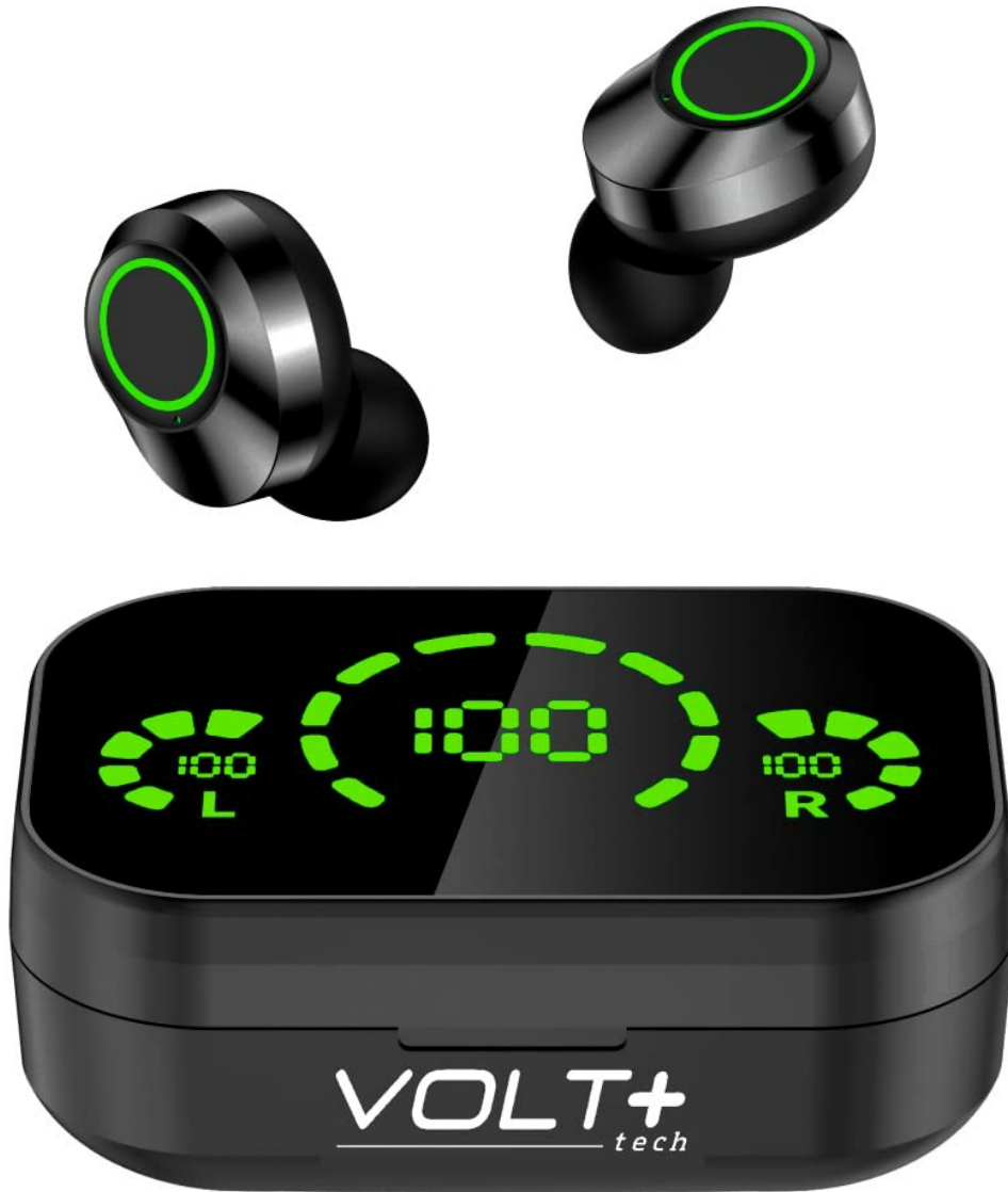
Image: The VOLT PLUS TECH Pro Wireless Earbuds YD03, showing both earbuds and the charging case with its LED display.