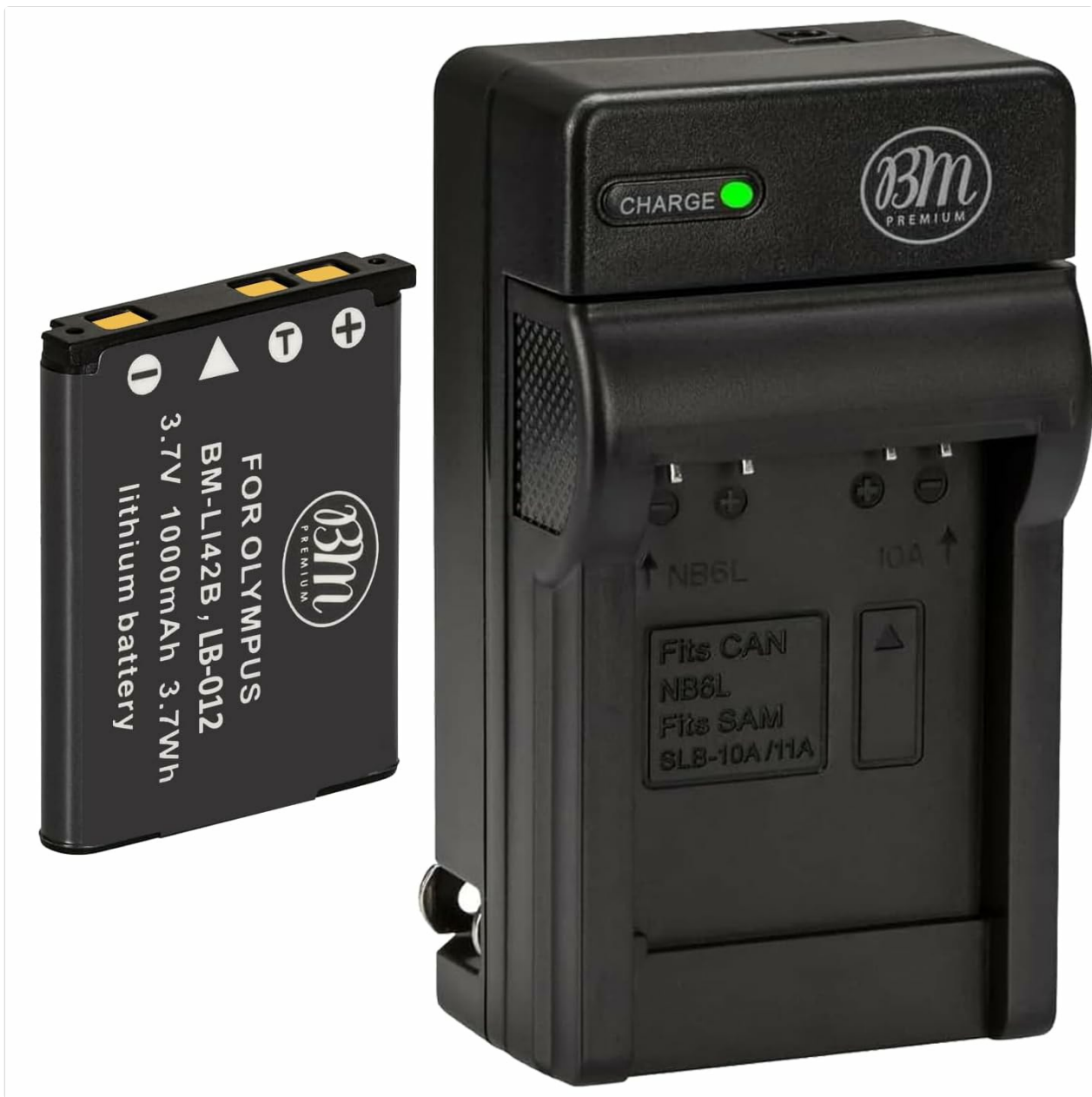
Image: BM Premium LB-012 Battery and Charger Kit. This image displays the LB-012 battery and the charging unit, highlighting the product's components.