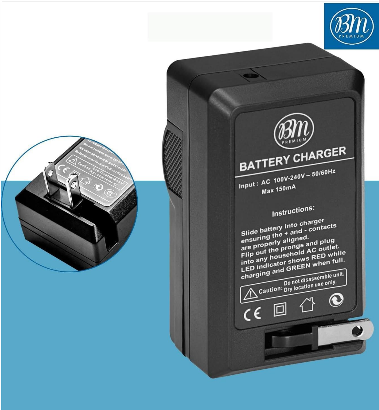
Image: Back of BM Premium Charger with instructions and warnings. This image shows the label on the back of the charger, detailing input specifications and safety warnings such as 'Do not disassemble unit' and 'Dry location use only'.