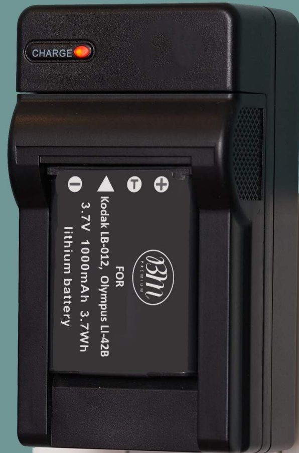
Image: BM Premium Charger plugged into a wall outlet with battery. This image demonstrates the charger in use, connected to a standard wall outlet with a battery inserted, ready for charging.

Make sure you never miss another once-in-a-lifetime moment by always having a battery ready with BM Premium's Wall Charger