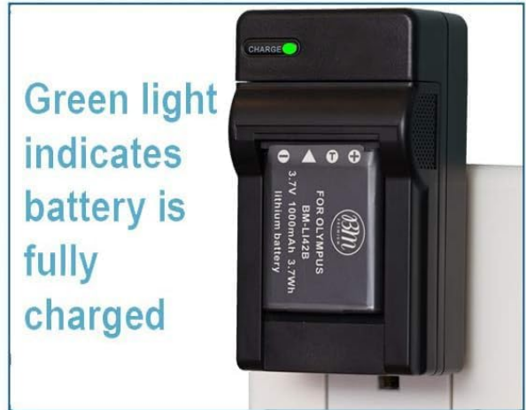
Image: BM Premium Charger LED indicators for charging status. This image shows the charger's LED light, illustrating the difference between a red light (charging) and a green light (fully charged).