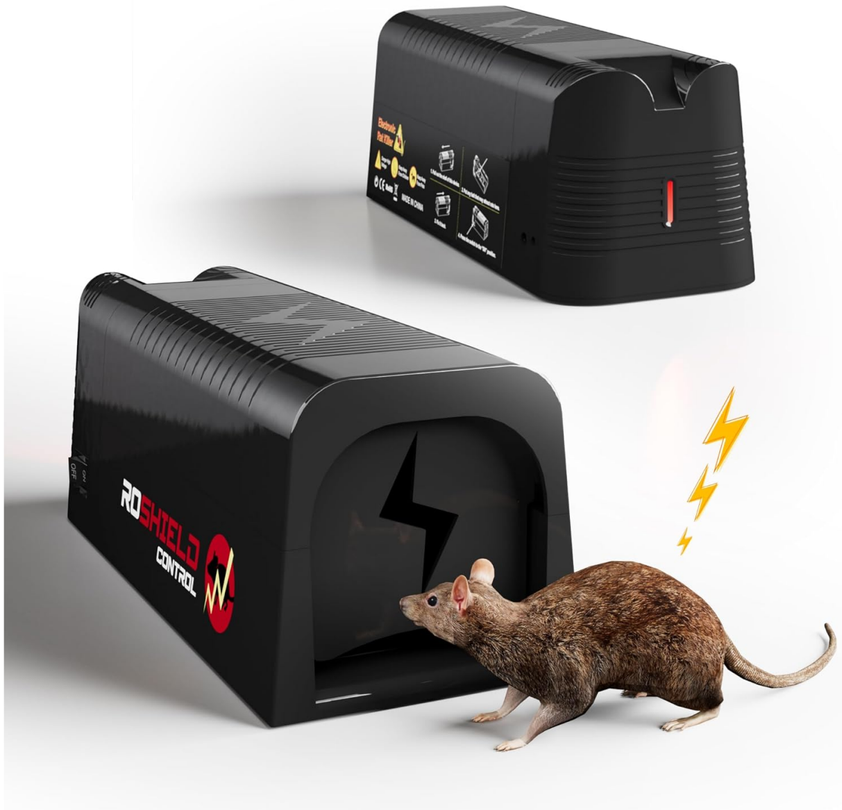
The Roshield Electric Rat and Mouse Trap, designed for effective rodent elimination.