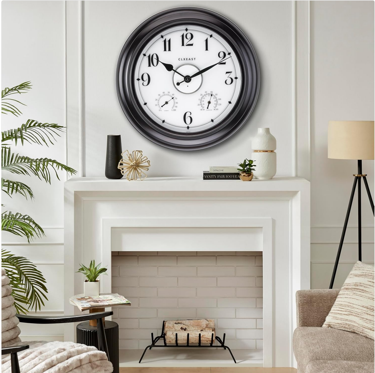
Figure 4: Example of the clock mounted indoors above a fireplace.

The clock is designed for wall mounting. Use appropriate hardware for your wall type to ensure secure installation. Consider placing the clock in a location that is protected from direct, prolonged exposure to extreme heat, sunlight, and constant heavy rain for optimal performance and longevity.