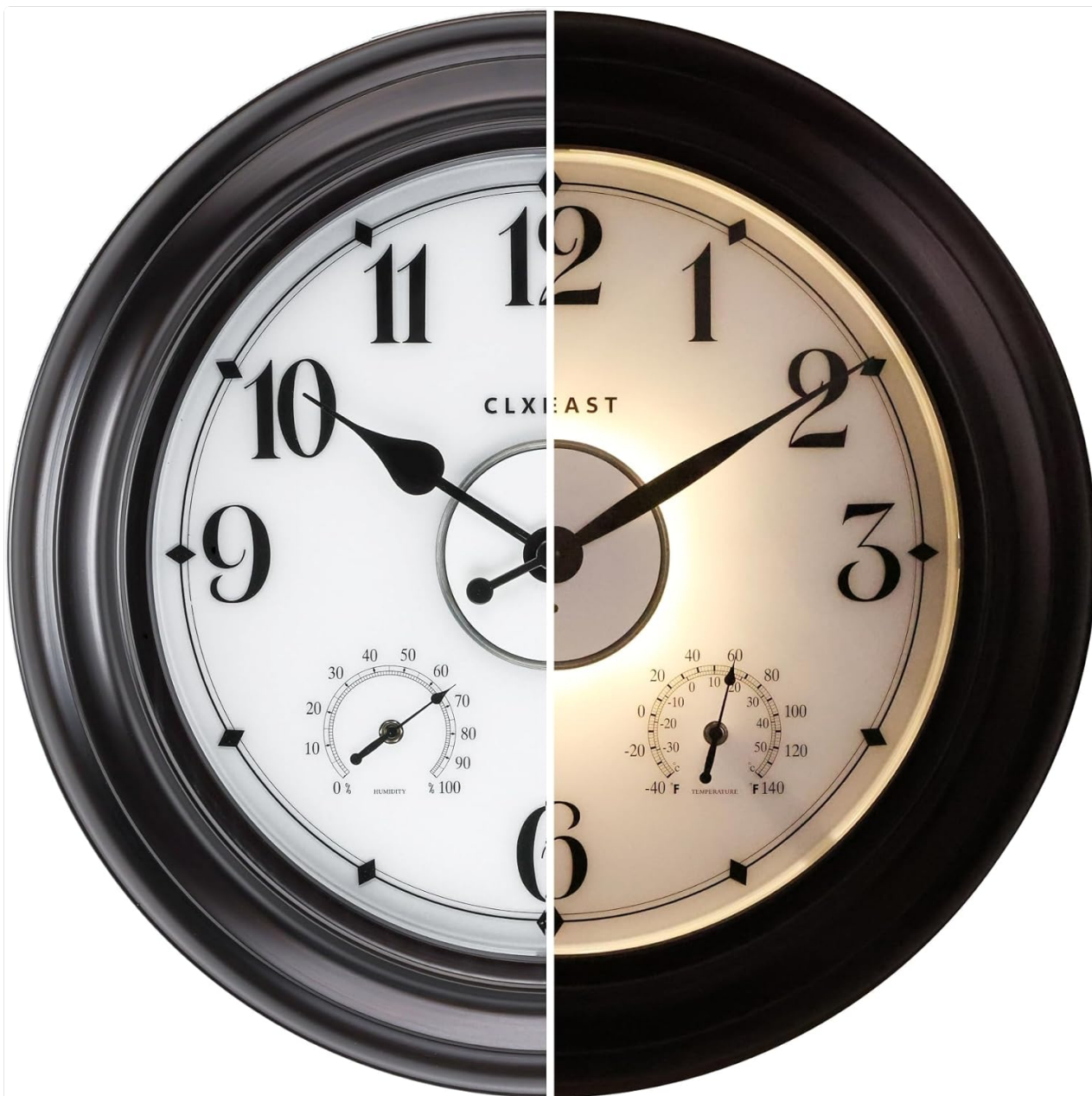
Figure 1: The CLXEAST outdoor clock, demonstrating its appearance in both daylight and illuminated night modes.