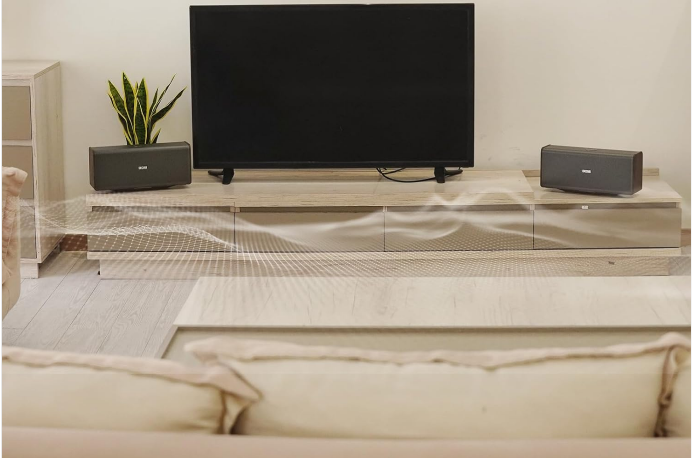
Image: Two DOSS SoundBox Ultra speakers positioned on a TV stand, demonstrating the immersive stereo sound setup in a living room environment.

Pair two SoundBox XL Ultra speakers for wider soundstage.