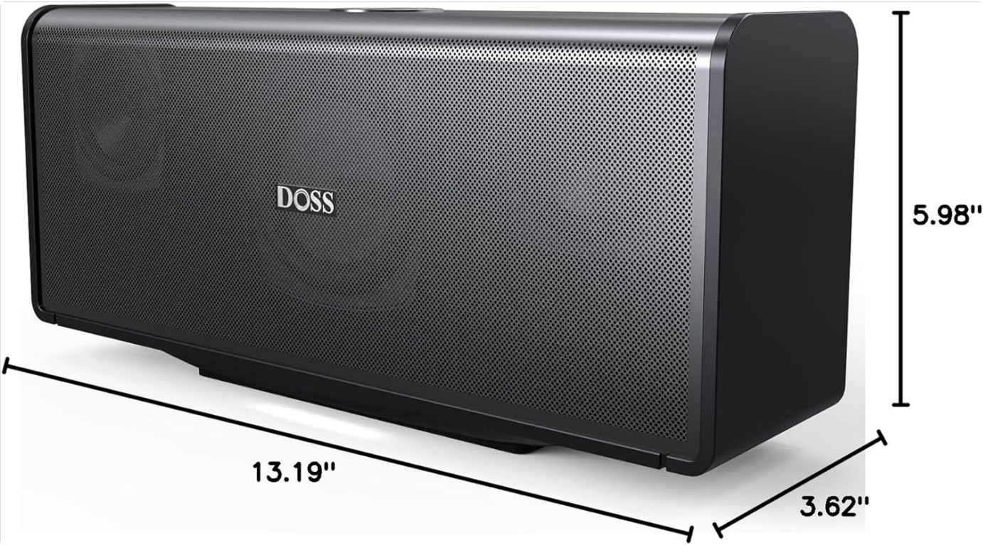
Image: A visual representation of the DOSS SoundBox Ultra speaker with its dimensions (13.19" W x 5.98" H x 3.62" D) clearly marked.