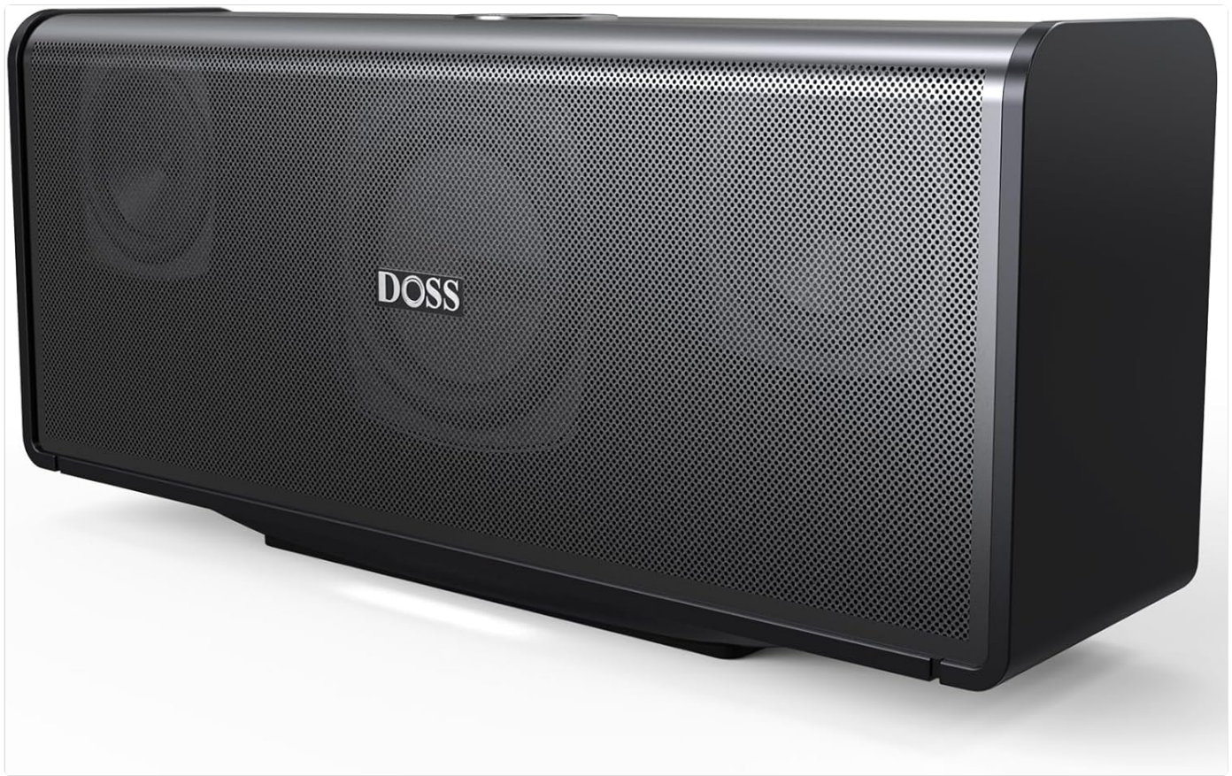
Image: Front view of the DOSS SoundBox Ultra speaker in black, showcasing its sleek design and perforated metal grille.